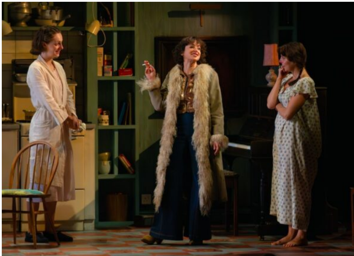
Helena Wilson, Laura Donnelly, and Ophelia Lovibond in The Hills of California .