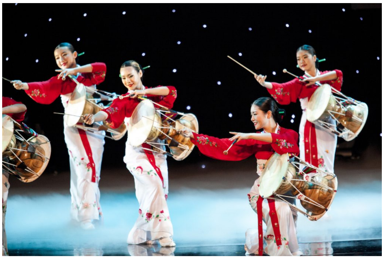
Jung Im Lee Korean Dance Academy.