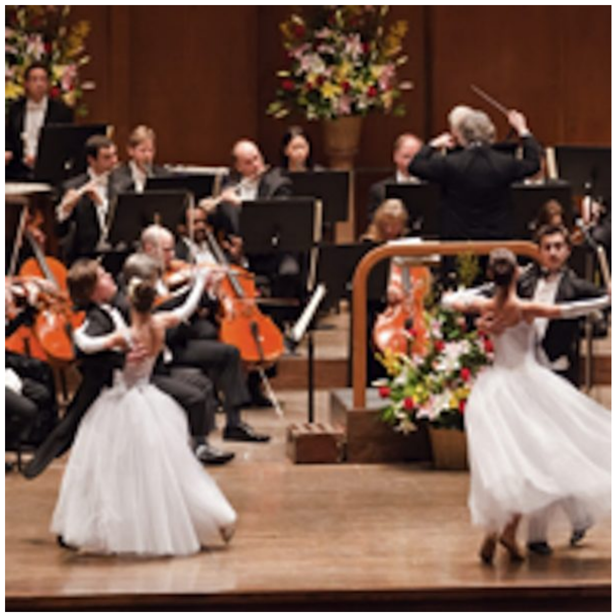
Salute to Vienna.

Salute to Vienna at Segerstrom Center for the Arts, 600 Town Center Dr., Costa Mesa; Sat., Jan. 1, 7 pm. Also at Disney Hall, 111 S. Grand Ave., downtown; Sun., Jan. 2, 2:30 pm. Salute to Vienna