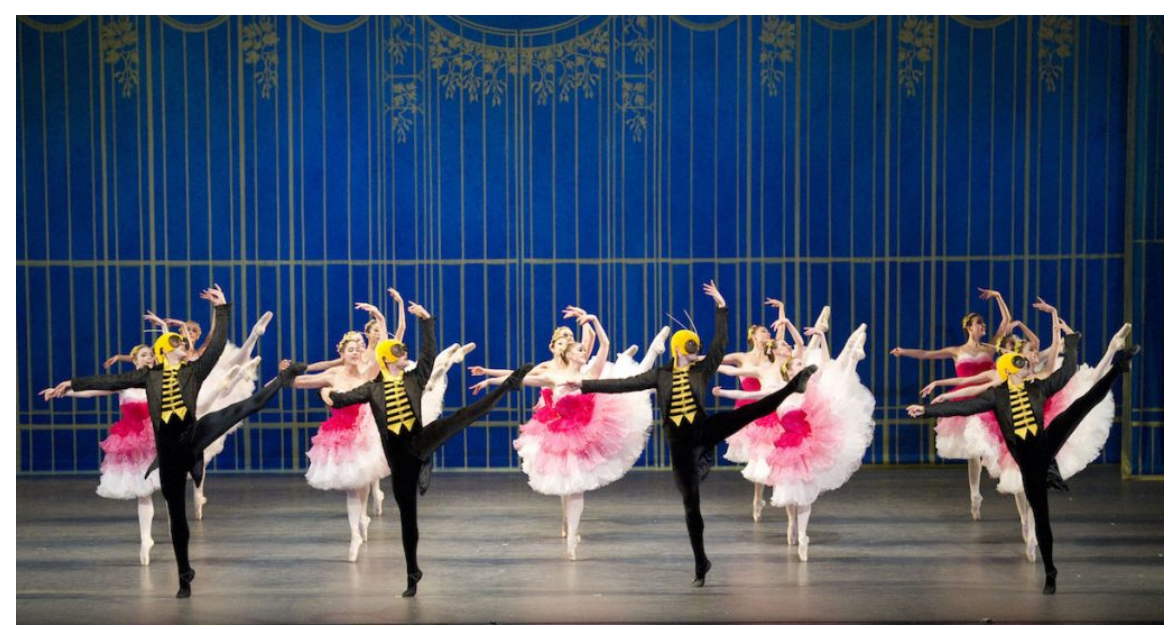
American Ballet Theatre's "Nutcracker".

• American Ballet Theatre at Segerstrom Center for the Performing Arts, 600 Town Center Dr., Costa Mesa; Wed.-Fri., Dec. 15-17, 7 pm, Sat., Dec. 18, 2 pm & 7 pm, Sun., Dec 12 & 19, 12:30 & 5:30 pm, Wed.-Thurs., Dec. 15-16, 7 pm. Details, tickets and Covid protocols at SCFTA