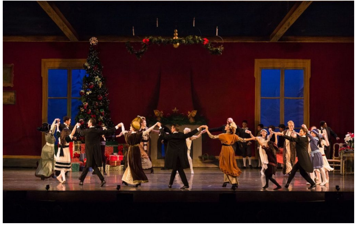
Los Angeles Ballet's "Nutcracker".

• American Ballet Theatre at Segerstrom Center for the Performing Arts, 600 Town Center Dr., Costa Mesa; Wed.-Fri., Dec. 15-17, 7 pm, Sat., Dec. 18, 2 pm & 7 pm, Sun., Dec 12 & 19, 12:30 & 5:30 pm, Wed.-Thurs., Dec. 15-16, 7 pm. Details, tickets and Covid protocols at SCFTA