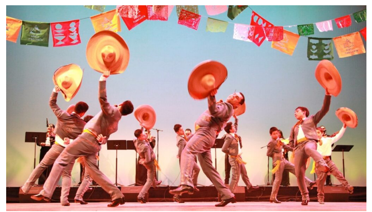
Danza Floricanto/USA.

Celebrating its first Christmas in its new home, Danza Floricanto/USA pays tribute to Mexican holiday traditions with Navidad en el Barrio . This is the 17th year for the company's seasonal performance, the first at Casa del Mexicano, 2900 Calle Pedro Infante, E.LA; Sat., Dec. 18, 7 pm, $10, $15 at door. Danza Floricanto or 213-466-2611.