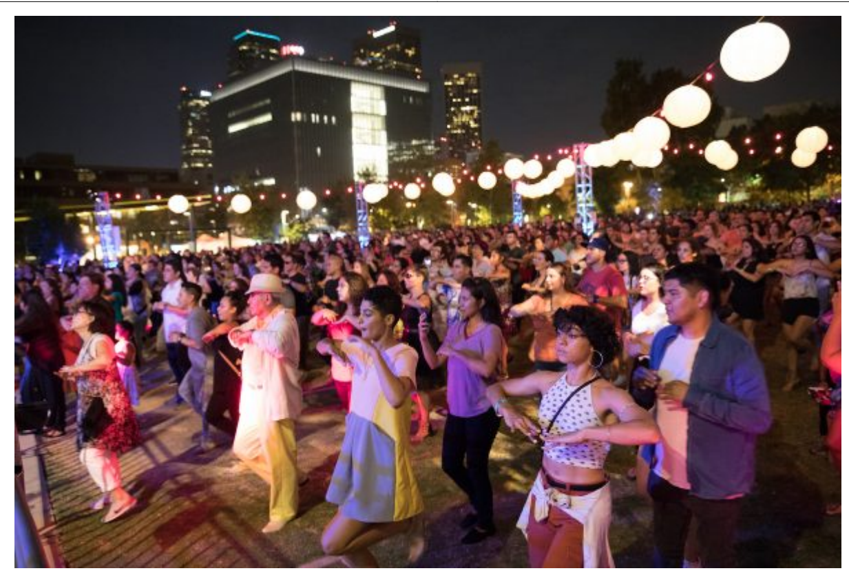
Dance DTLA.