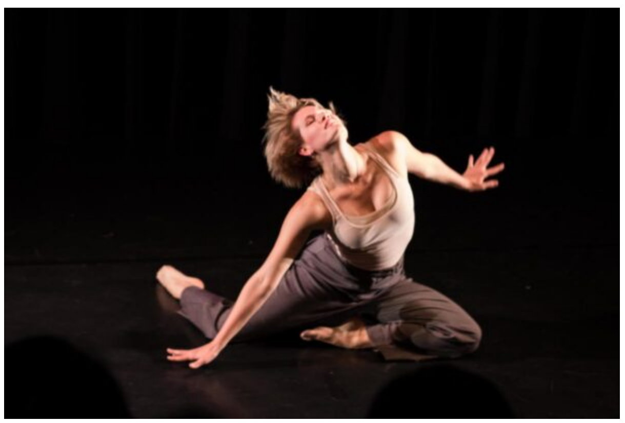
Re:borN Dance Festival.

Repertory Company and Encore Dance Company. Info on workshops and other activities is at the website. Placentia-Yorba Linda Unified Performing Arts Center, 1651 N. Valencia Ave., Placentia; Fri., Aug. 12, 7:30pm, $25-$30, $20 student. Re:borN Dance.