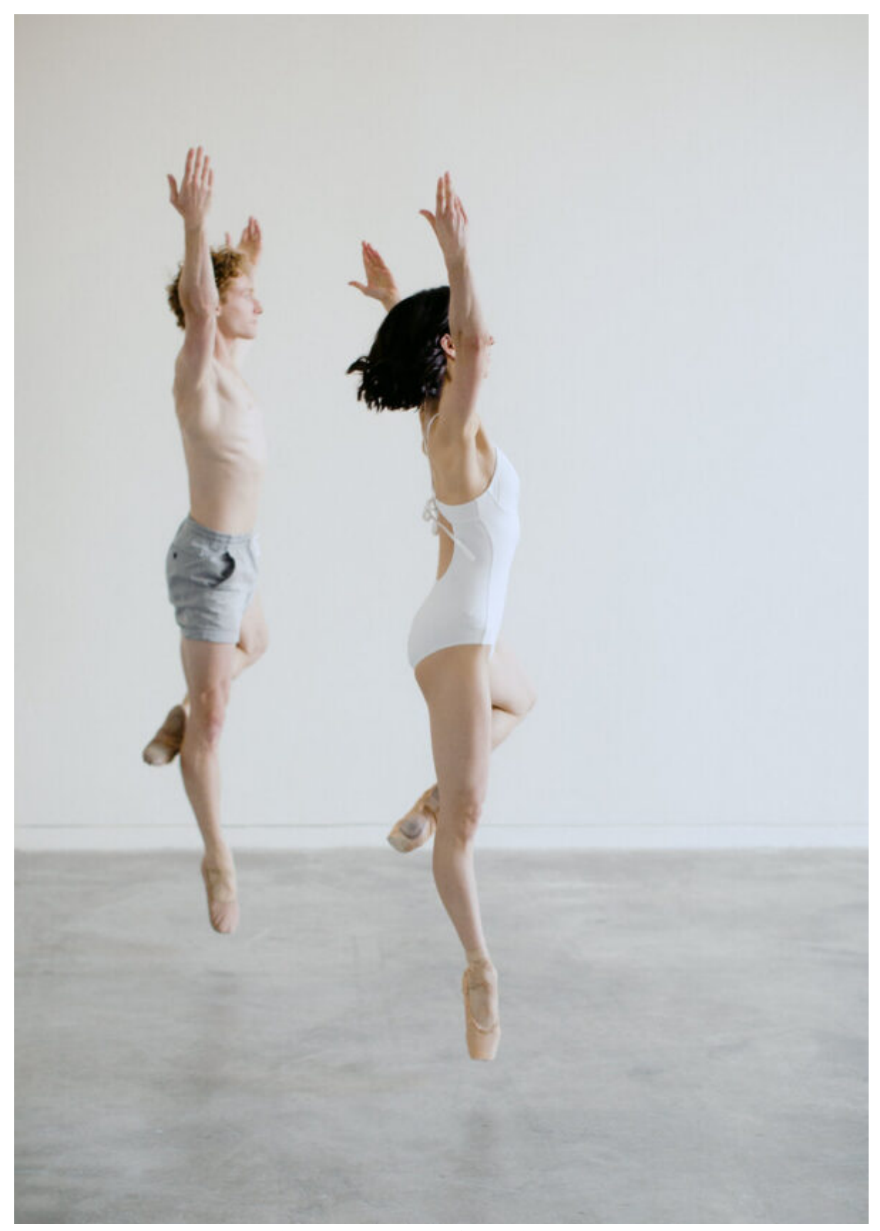
Skylar Campbell Dance Collective.