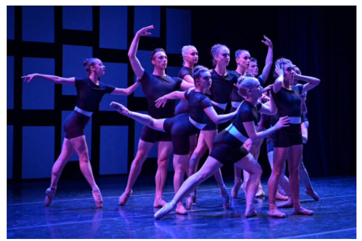
Ballet Project OC.