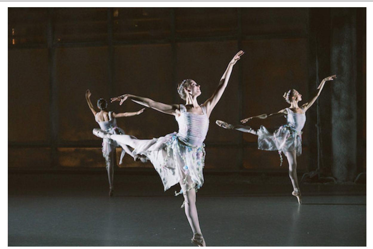
American Contemporary Ballet.