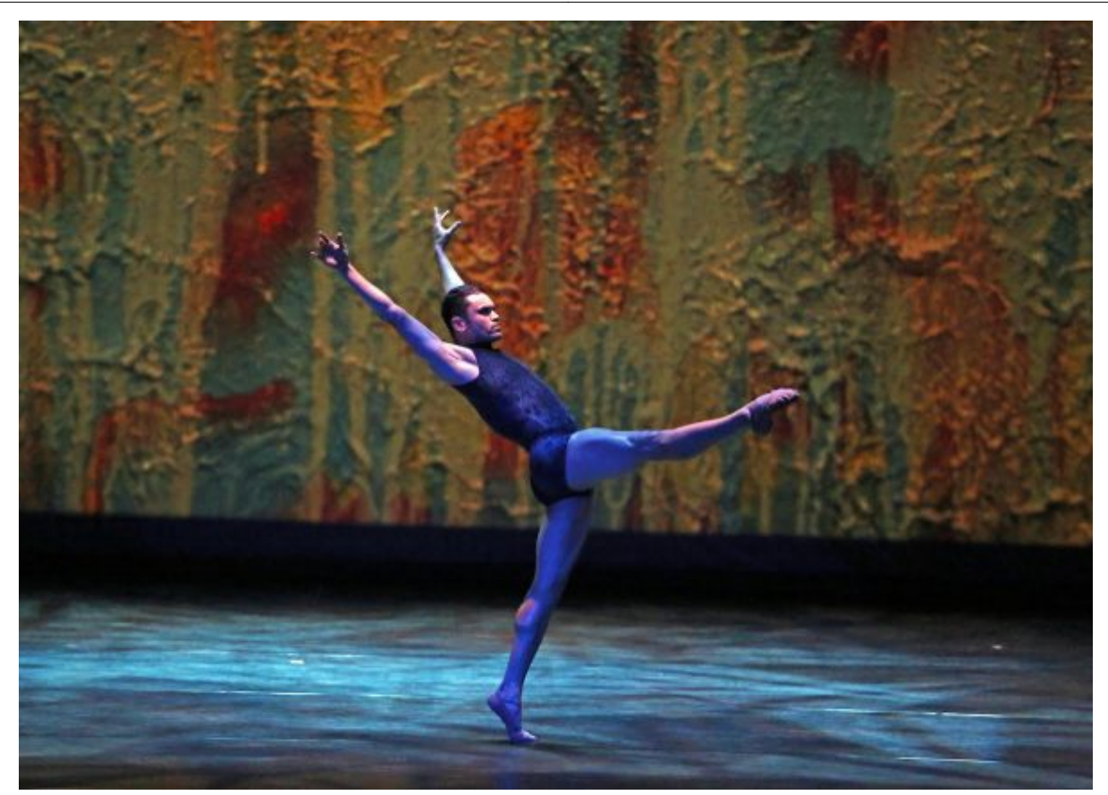
Raiford Rogers Modern Ballet.