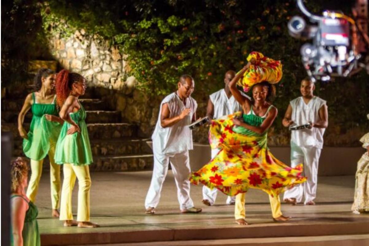
Viver Brasil.