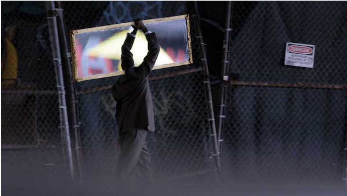
Forgotten Song, a film in Dances With Films (DWF/LA).