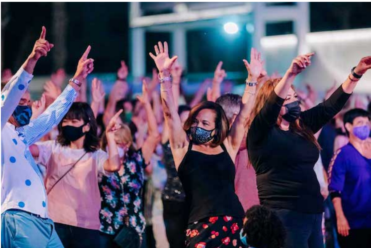
Dance DTLA.

Saucy salsa is the dance genre for the penultimate edition of this summer's Music Center Dance DTLA . The free dance lesson at 7 p.m. is followed by a chance to dance under summer stars. Join in or sit back and enjoy the free dance show. For the finale next week, be ready for Bollywood. Details at the website. Music Center, Jerry Moss Plaza, 135 N. Grand Ave., downtown; Fri., Sept. 3, 7pm too 11pm, free. Music Center LA