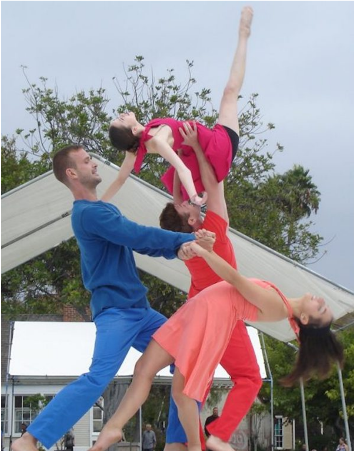
San Pedro Festival of the Arts.