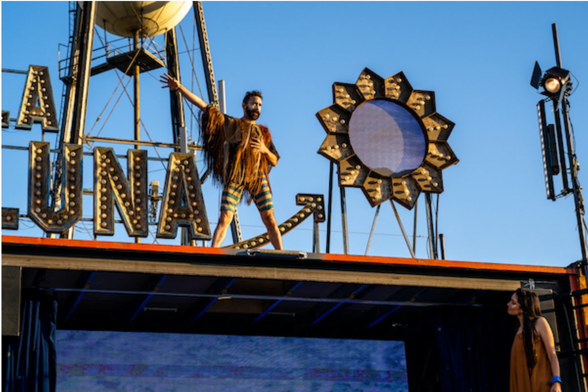
Birds on the Moon.