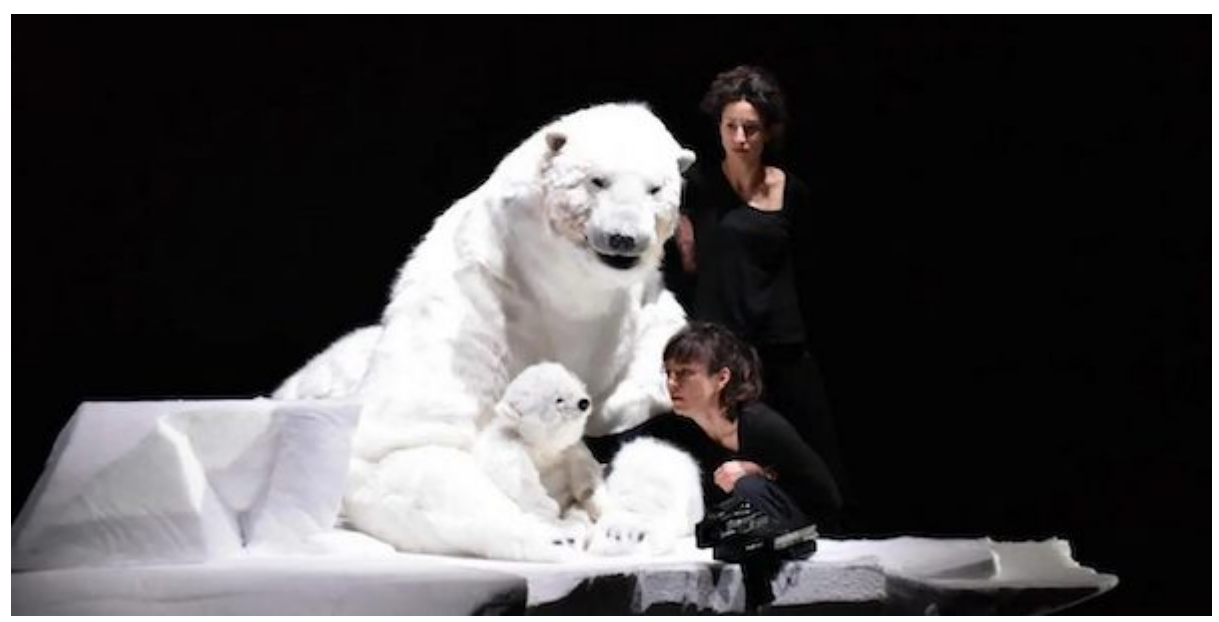
Chaliwaté Company & Focus Company. Photo courtesy of the artists