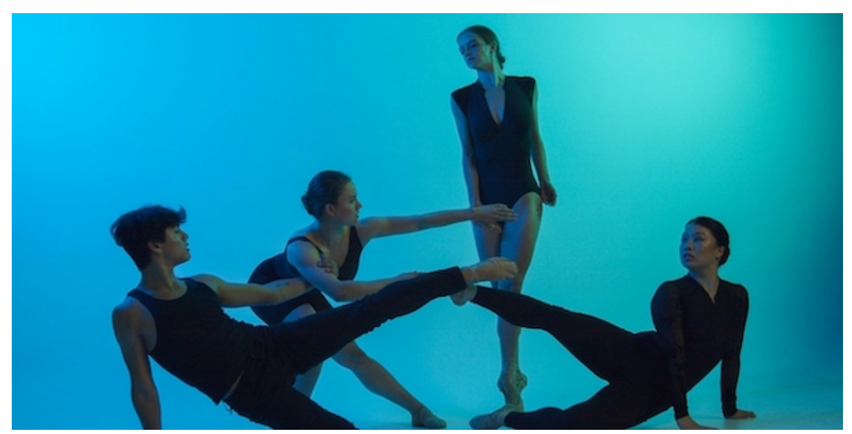
The Realm Company.