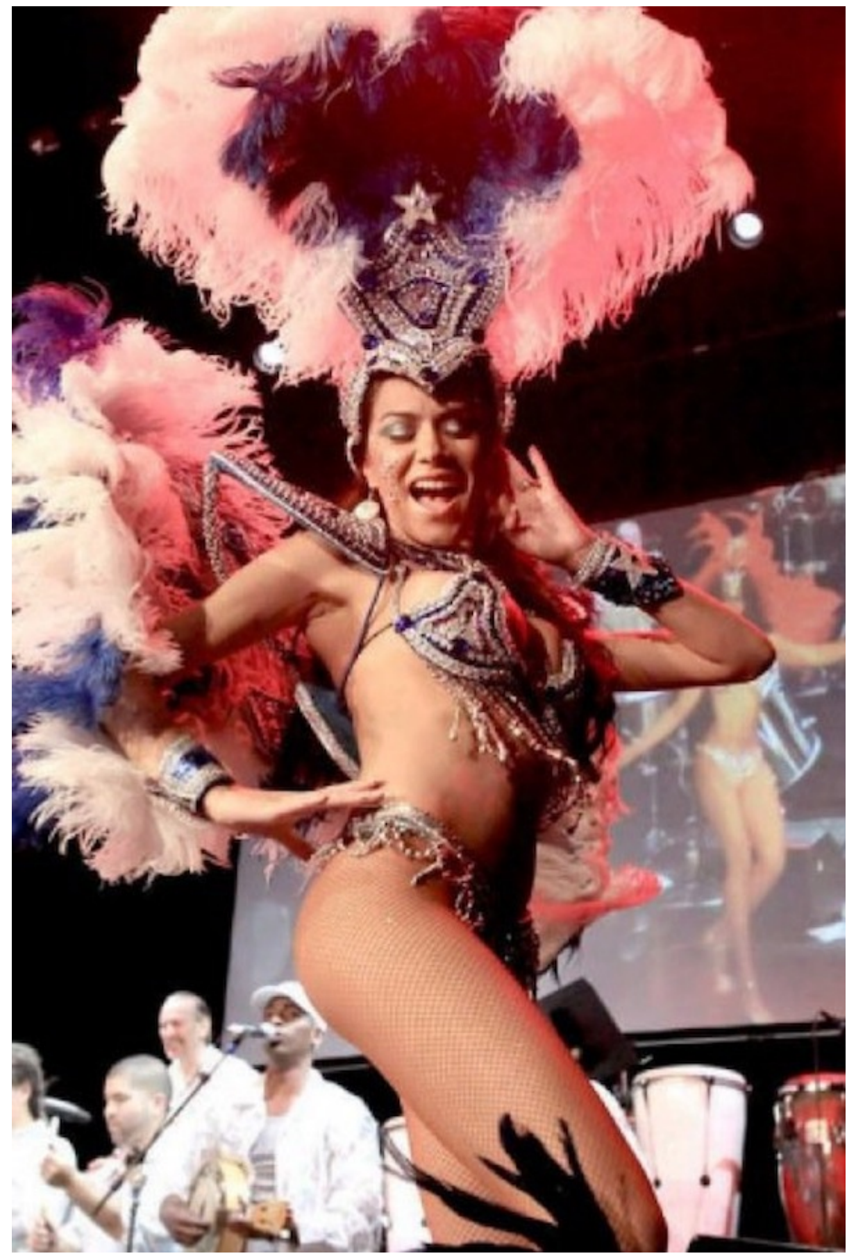
Brazilian Nites' Samba dancer.