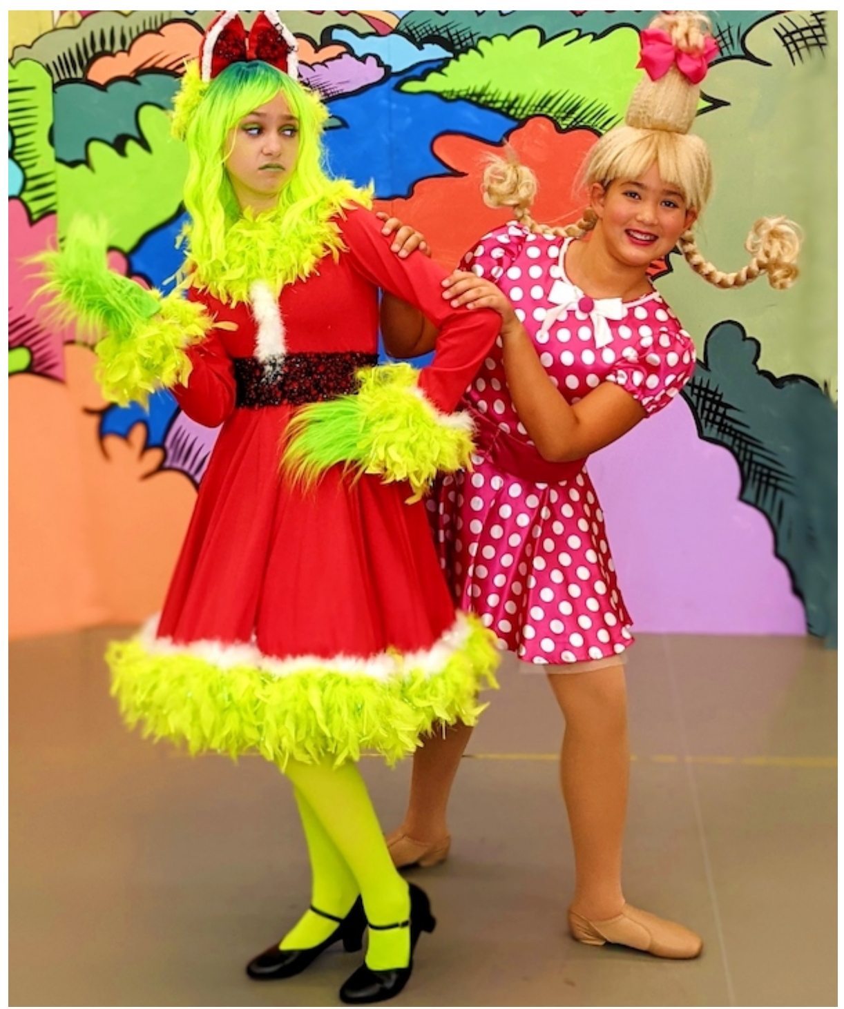
Inland Pacific Ballet Academy.

Academy presents the family-friendly Seussical Jr . Live at Inland Pacific Ballet Academy Studio Theater 7, 9061 Central Ave., Montclair; Fri.-Sat., Oct. 29-30, 7 pm, Sun., Oct. 31 & Nov. 7, 2 pm, Thurs. & Sat., Nov. 4 & 6, 7 pm, $25, $15 children under 12; digital livestream $35 per device. Program info & Covid protocols and tickets at Inland Pacific Ballet.