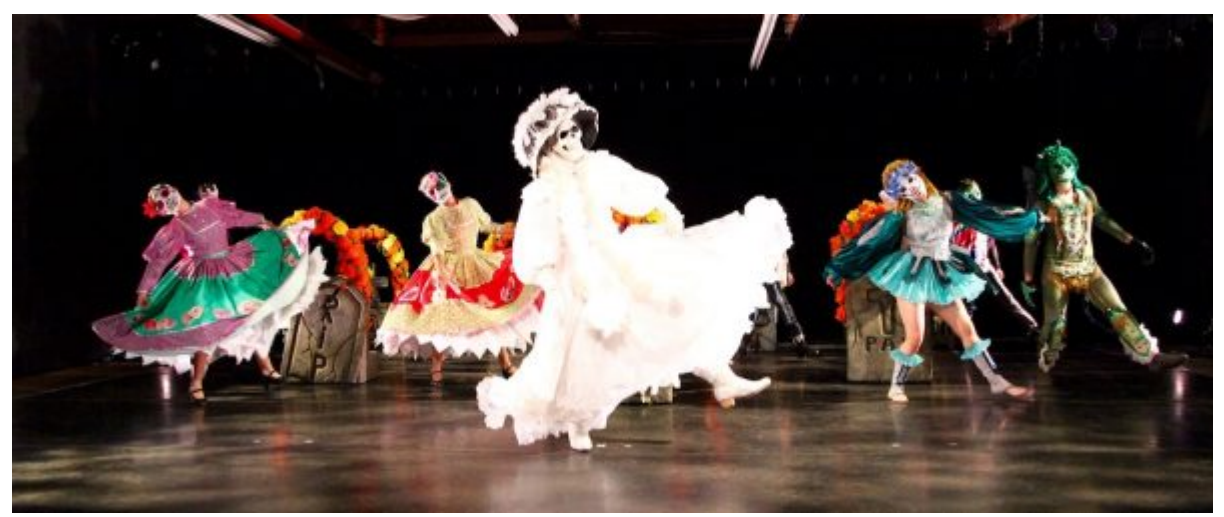
Danza Floricanto/USA's "Día de Los Muertos (Day of the Dead)".

The long-running, family friendly Fiesta del Día de los Muertos~Day of the Dead Celebration hosted by Danza Floricanto/USA returns as a live performance. At Casa Del Mexicano, Floricanto Center for the Performing Arts, 2900 Calle Pedro Infante, East LA; Sat., Nov. 6, 8 pm, Sun., Nov. 7, 6 pm, $20 at door, $15 pre-sale; $10 seniors & $5 children under 10 at door only. Tickets and Covid protocols at Danza Floricanto.