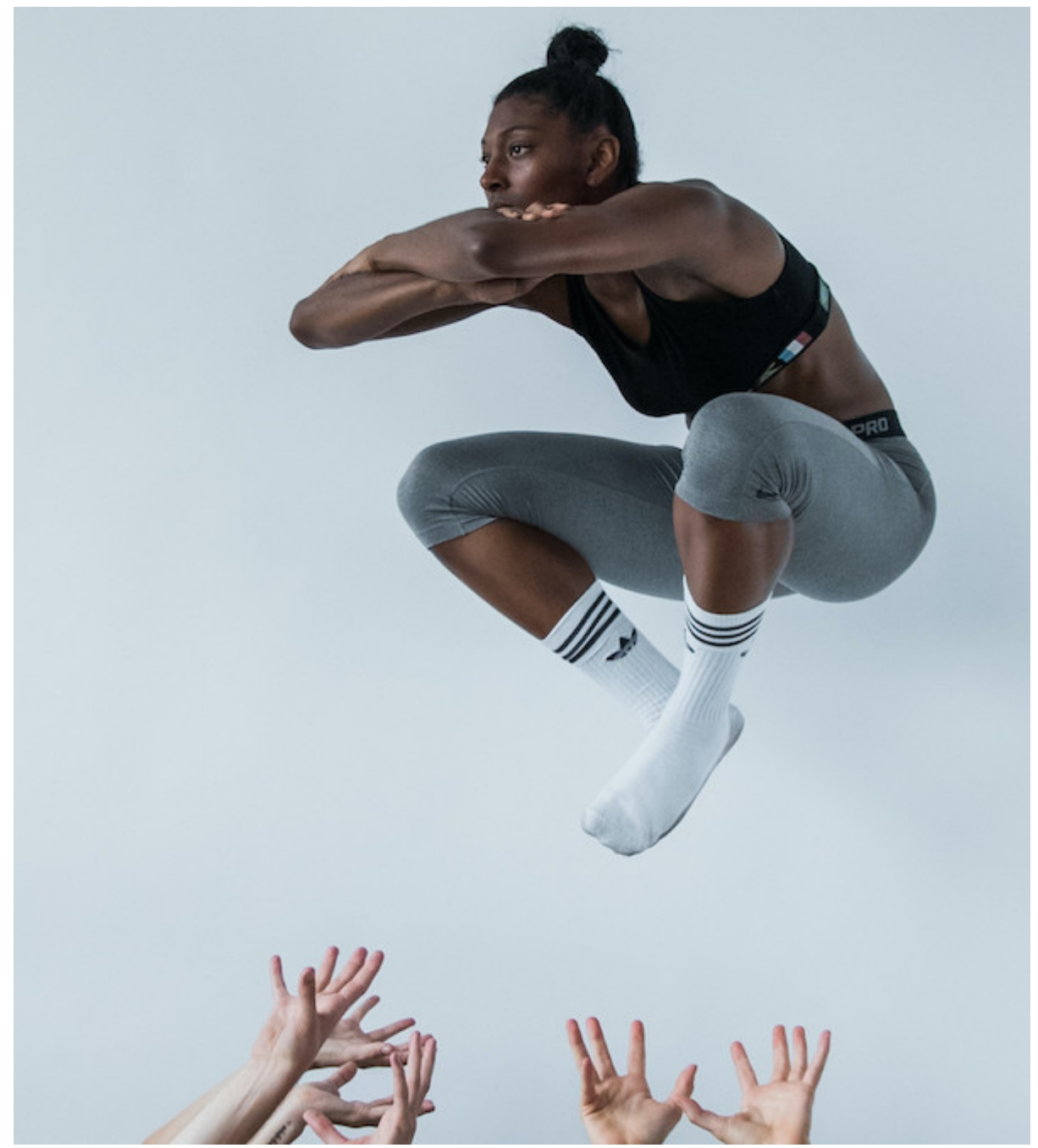
The TL Collective.