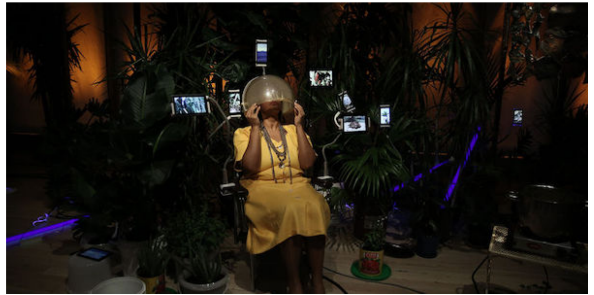
Hammer Museum's "No Humans Involved."