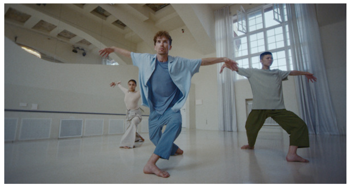
"Films.Dance Round 2."