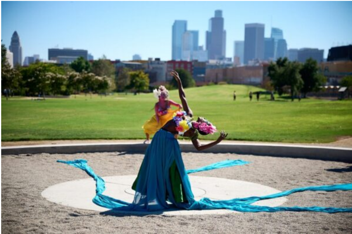
Heidi Duckler Dance's "Ebb & Flow."