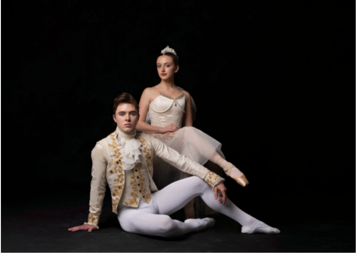
Los Angeles Ballet “Cinderella.”