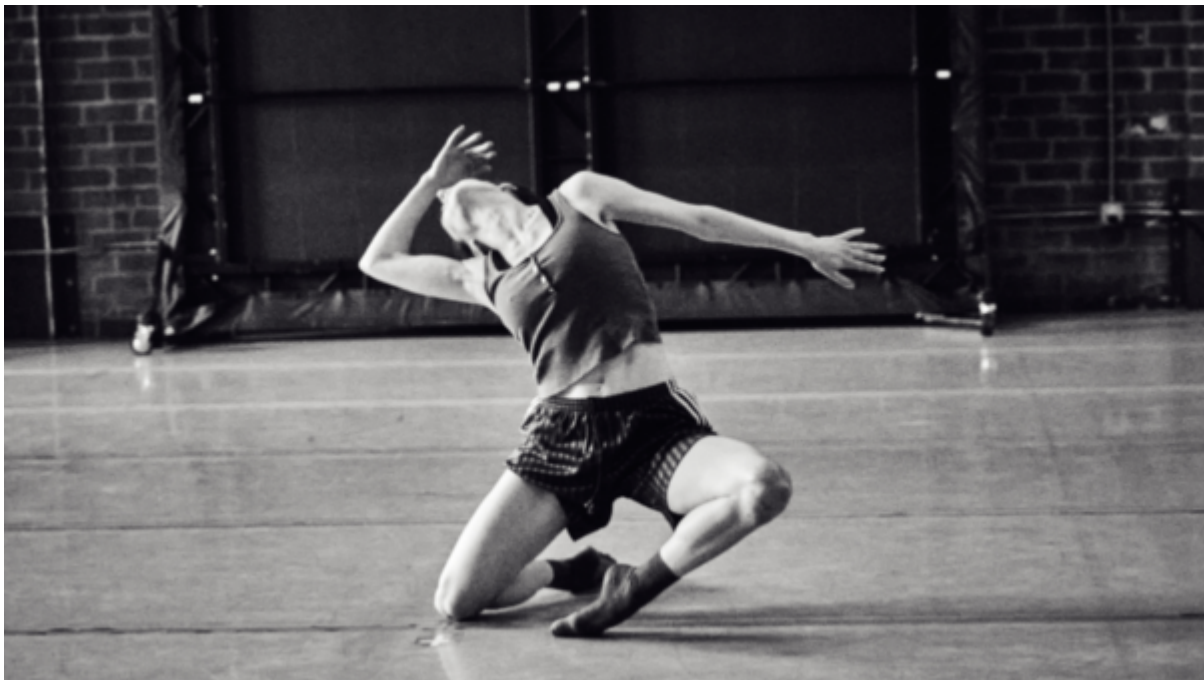
Los Angeles Dance Project.