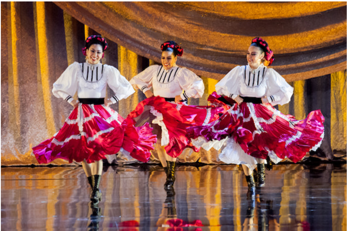
Pacifico Dance Company.