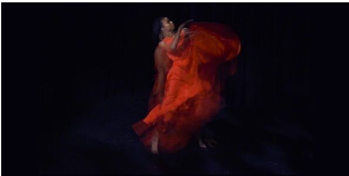
Zoe Rappaport.

In choreographer Zoe Rappaport's A/VOID , an eclectic ensemble of dancers leads the audience through the ten-thousand foot light and sound installation Chromasonic Field , responding to the evolving light and sound frequencies. Chromasonic Field , 677 Imperial St., Downtown Arts District; Fri.-Sat., June 13-14, 7:30 & 9:30 pm, $35-$55. Chromasonic .