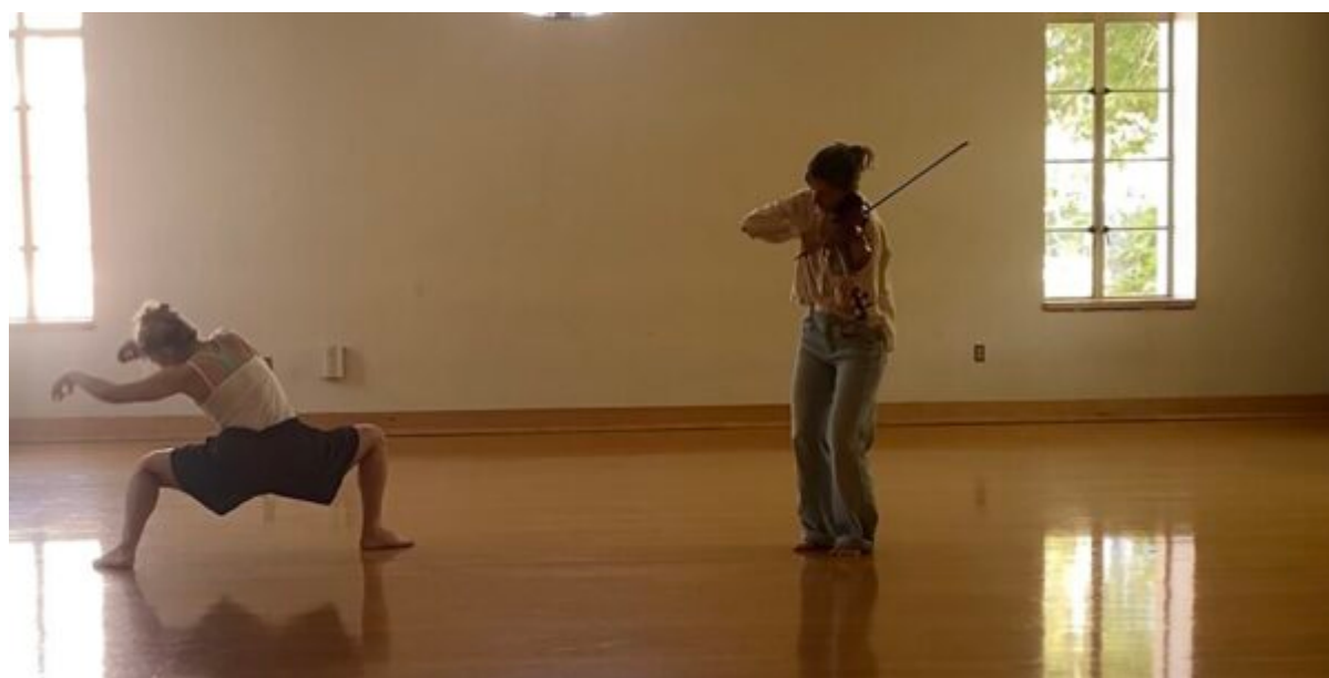
Kairos.

KAIROS Movement Collective — Dance at the Odyssey at Odyssey Theatre Ensemble, 2055 S. Sepulveda Blvd., West LA; Sat., June 21, 8 pm, $25, $60 festival pass. Odyssey Theatre Ensemble .