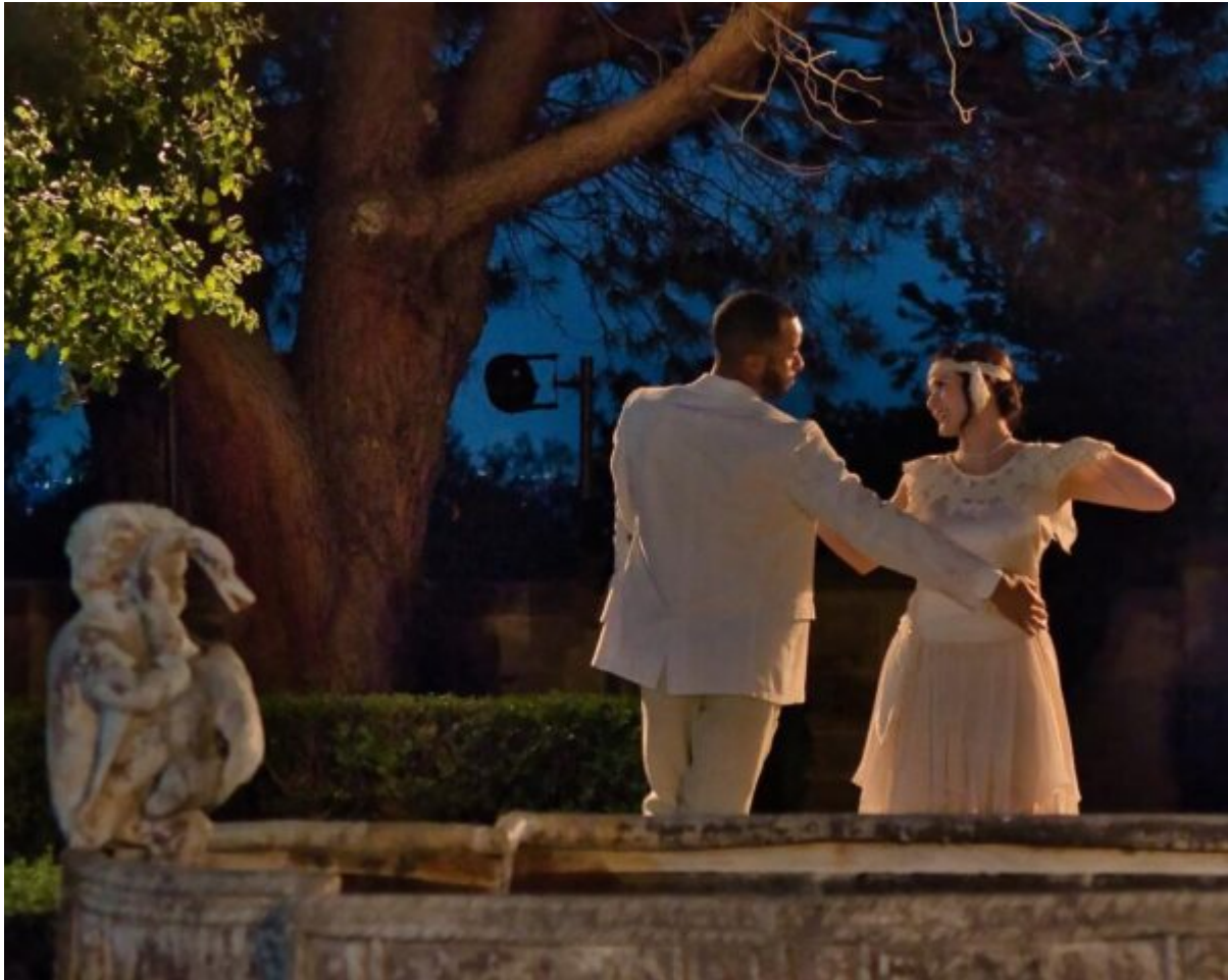
Mixed eMotion Theatrx in "Gatsby Redux."