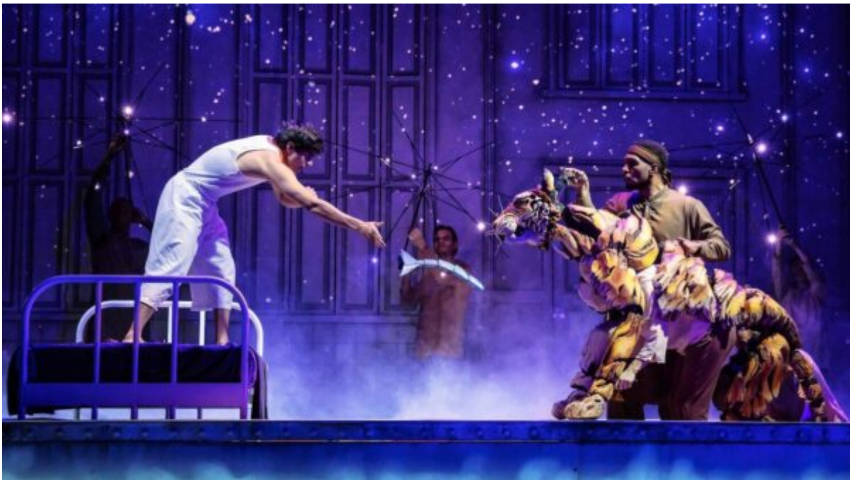
Life of Pi.