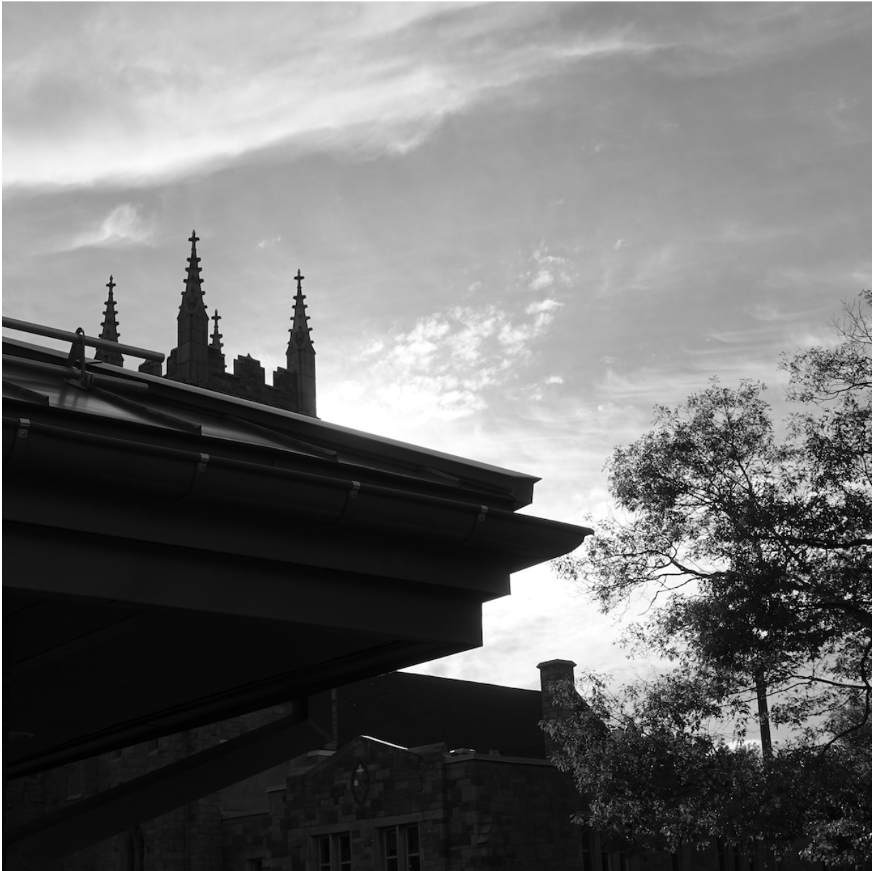
Huddle of roofs under equinox light