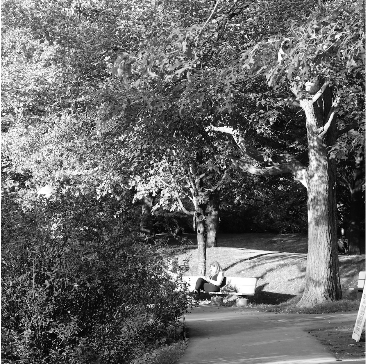
alone at the bend in the walkway