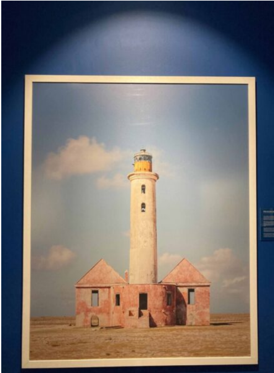
Klein Lighthouse. 1879. Willemstad, Curaçao

Lighthouses, described as “mystical beacons that have been saving sailors and enticing explorers for centuries,” reminded me of the movie written and directed by Derek Cianfrance The Light Between the Oceans (2016) with Michael Fassbender and Alicia Vikander.