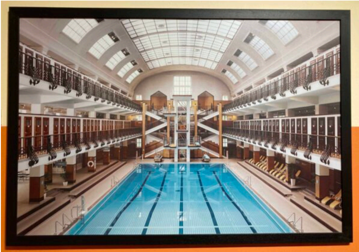
Amalienbad. 1926. Vienna, Austria