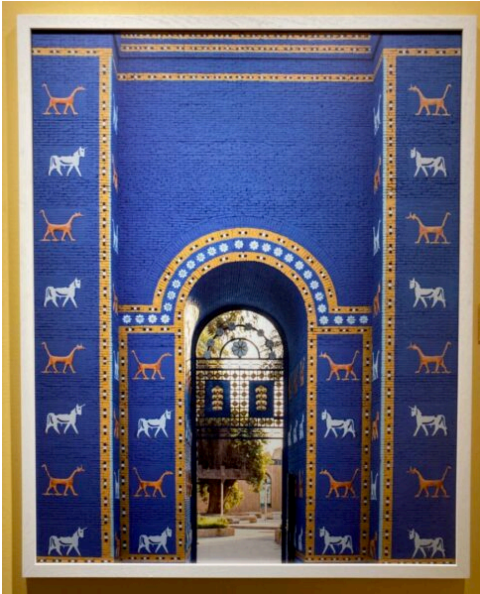
Ishtar Gate. 575, Hillah, Babil, Iraq

Further back to 575, a replica of the Ishtar Gate to ancient Babylon was rebuilt in Iraq, while the reconstruction from archival materials excavated in 1914 is at the Pergamon Museum in Berlin.