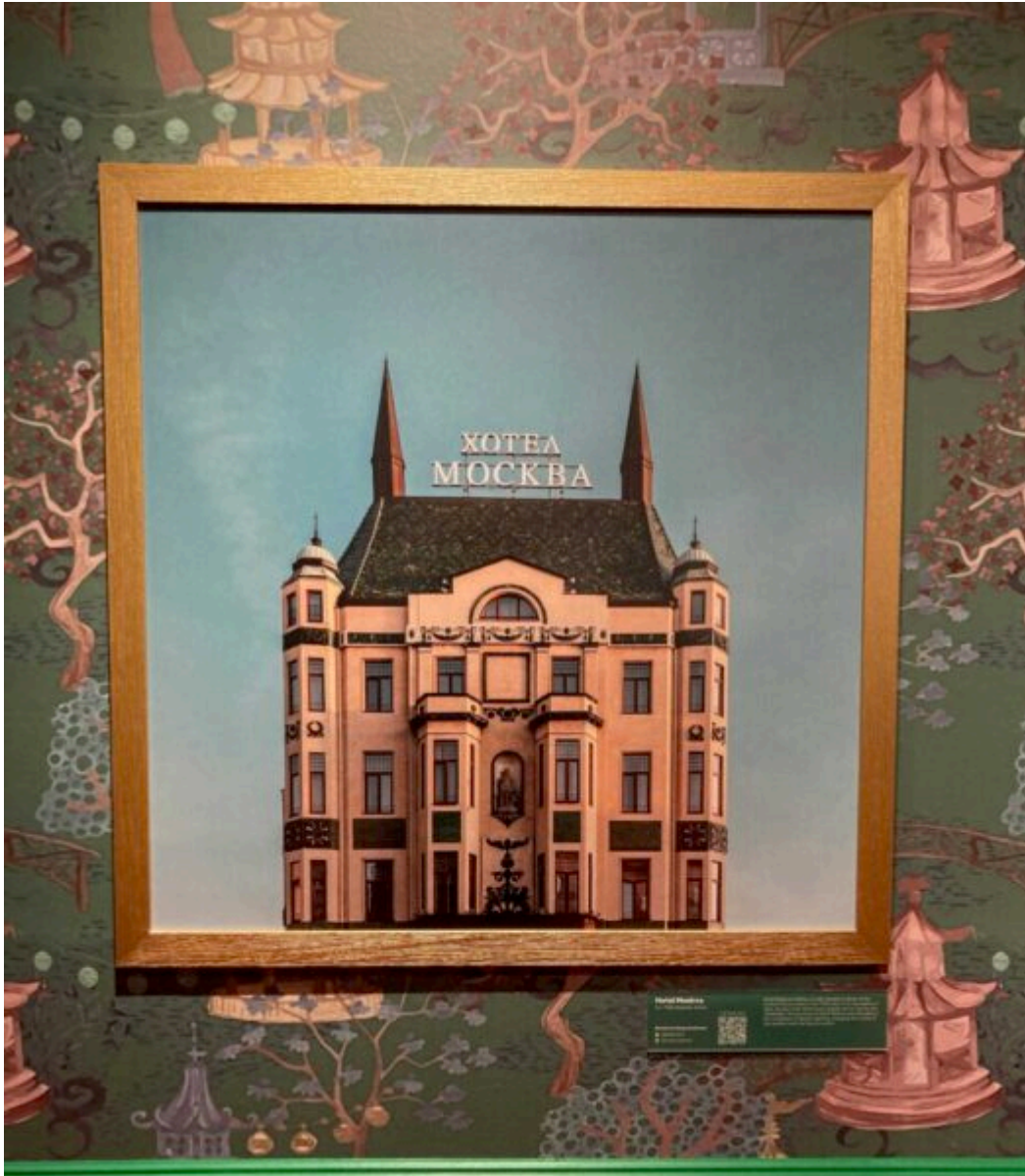
Hotel Moskva. 1908. Belgrade, Serbia

Hotel Moscow, Belgrade, Serbia, built tin 1908 as Palace Rossiya.