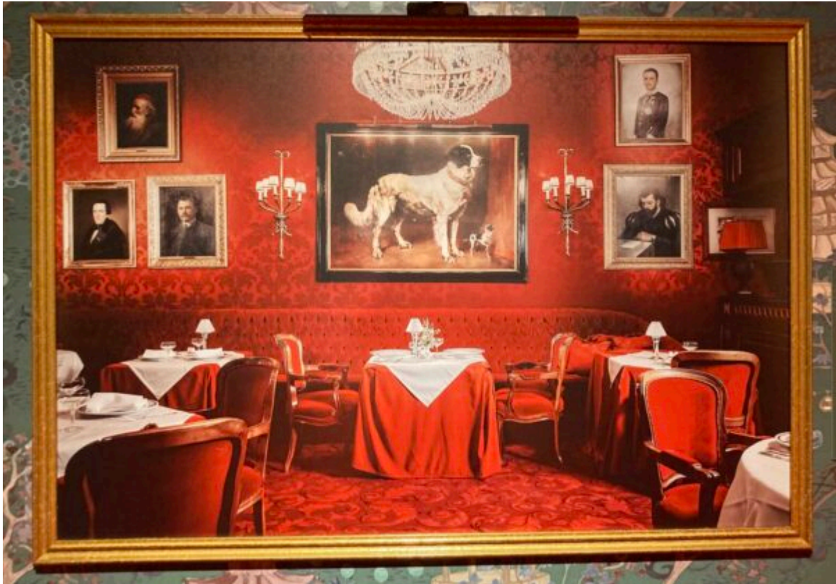
Hotel Sacher. 1876. Vienna, Austria