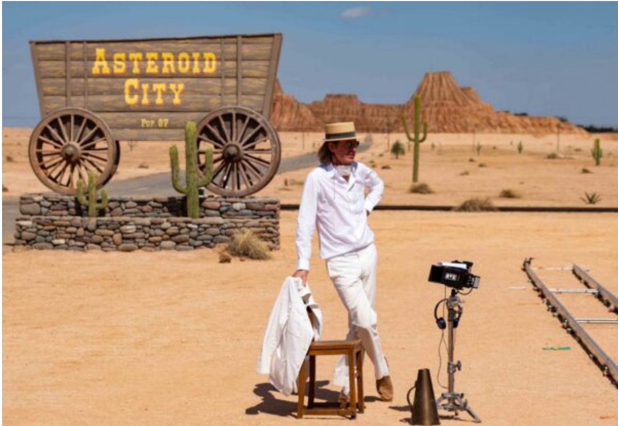
Wes Anderson on set of ASTEROID CITY

As a film critic, I appreciate Wes Anderson's work, and wrote an article about his latest movie, Asteroid City , for the Italian film monthly Best Movie.