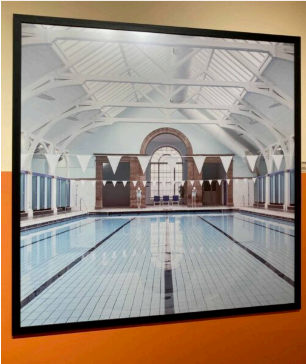
Warrender Baths. 1887. Edinburgh, Scotland

A similar goal was behind the establishment of the Warrender Baths in Edinburgh, Scotland in 1887, except this one was a private club for the upper class.