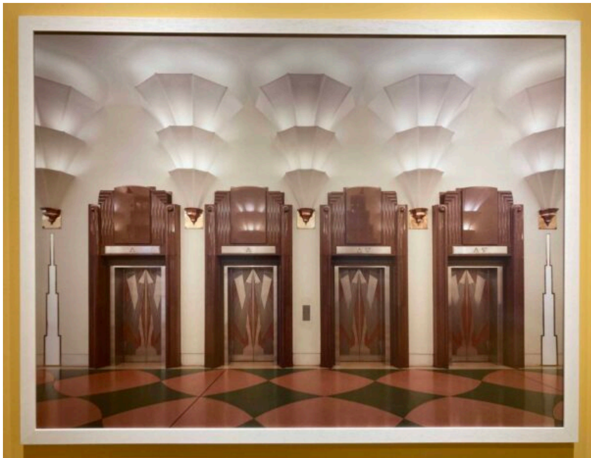
MLC Building. 1936. Sydney, Australia

I visited the unusual exhibit “ Accidentally Wes Anderson ” at the Santa Monica Art Museum on the Promenade, on view until August 18.