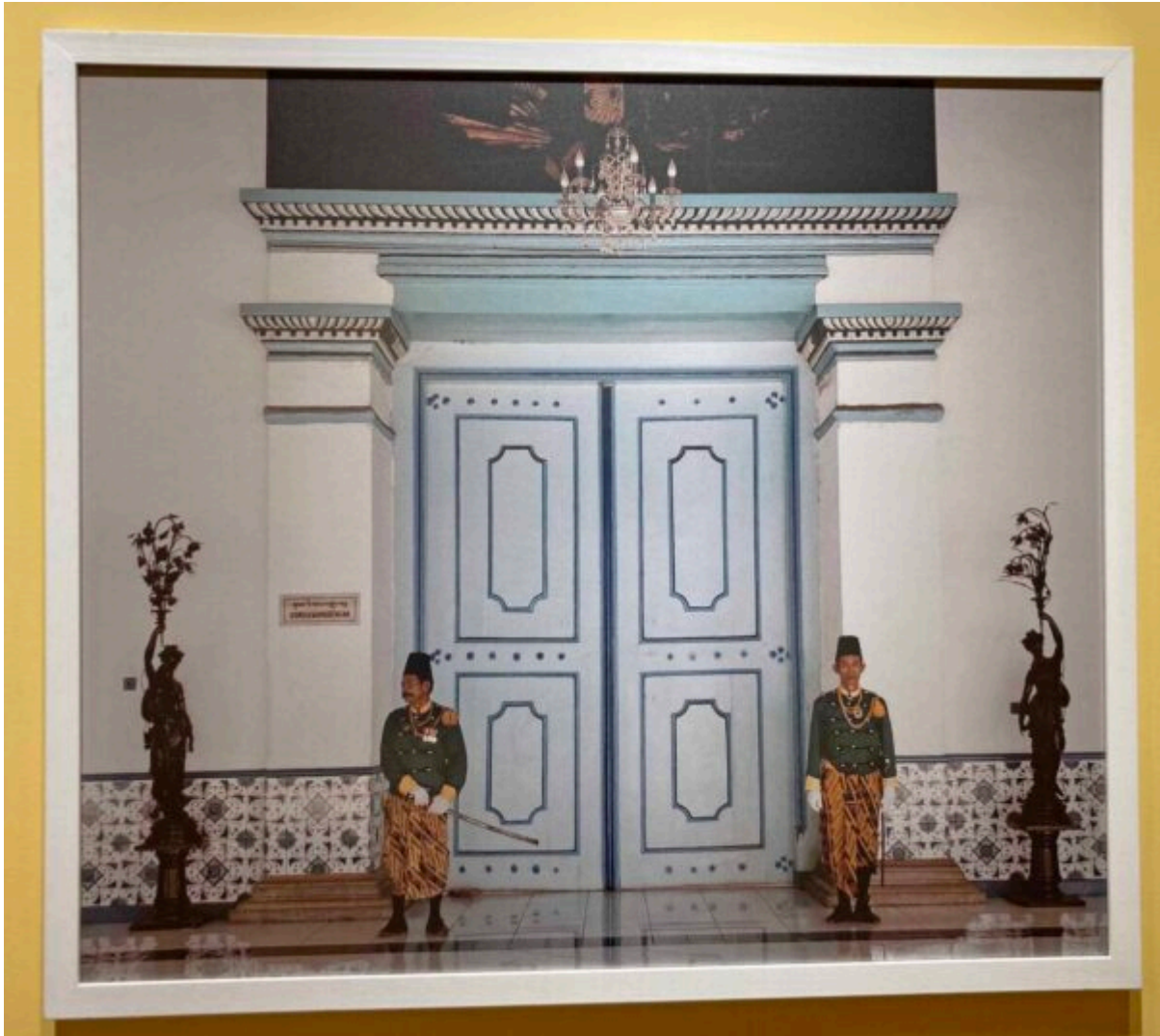
Surakarta Hadiningrat Royal Palace. 1744. Central Java

Going back three centuries to 1744, see the guards at the doors of Surakarta Royal Palace in Central Java.