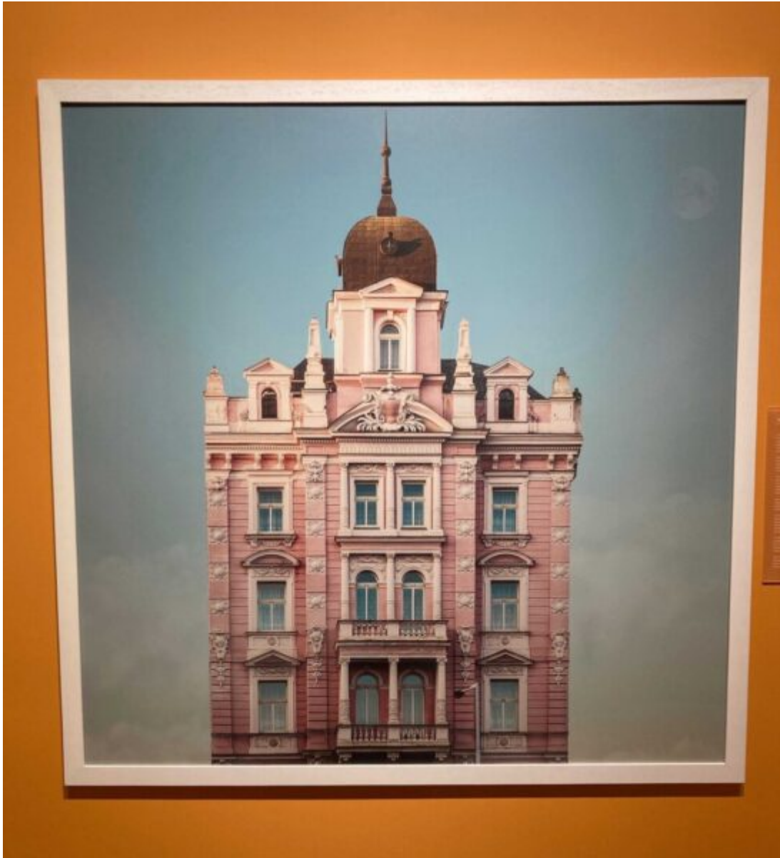
Hotel Opera. 1890. Prague, Czech Republic

Hotel Opera, Prague, built in 1890 in Bohemian Neo-Renaissance style.