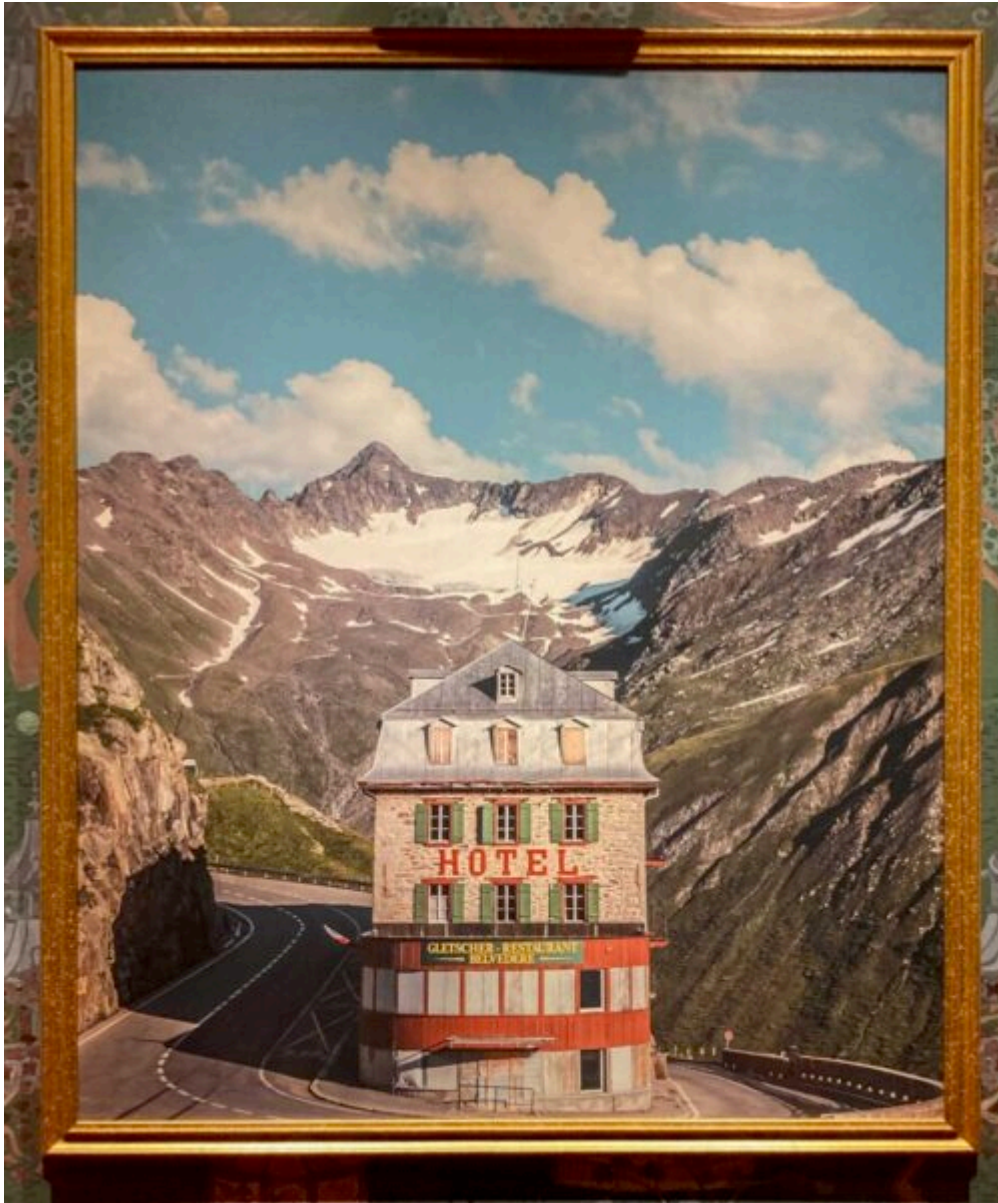
Hotel Belvedere. 1783. Furka Pass, Switzerland

Hotel Belvedere, 1783 in Switzerland was chosen for the book cover of Accidentally Wes Anderson .