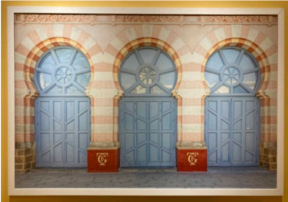
Gran Teatro Falla. 1905. Cadiz, Spain

Look at more doors to the 1905 Gran Teatro Falla in Cádiz, Andalusia, Spain, in the Neo-Mudéjar style.