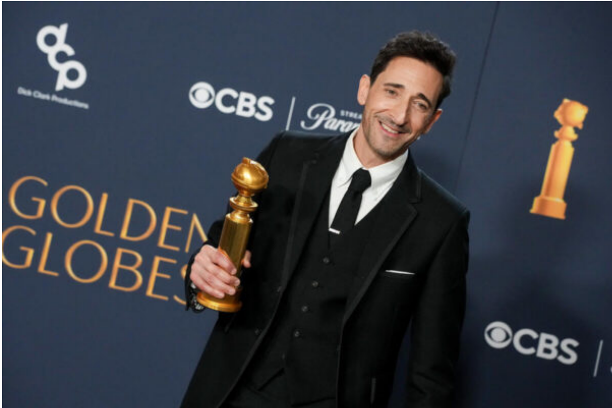
Adrien Brody — Golden Globes 2025