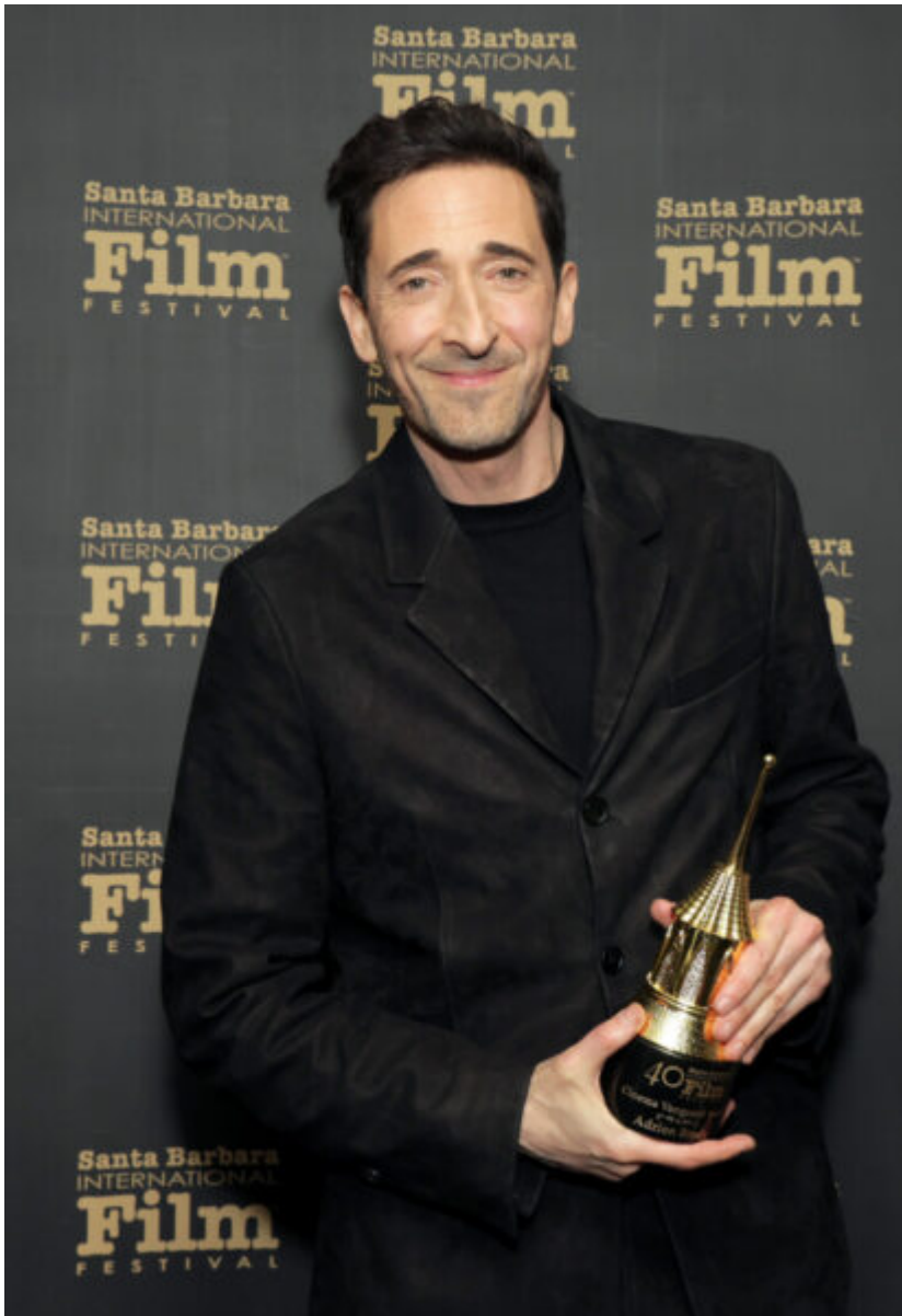
Adrien Brody.

On February 13 Adrien Brody and his costar Guy Pearce were honored with the Cinema Vanguard Award at the 40th Santa Barbara Film festival. During the Q&A he said: “I gained an understanding of the hardships many people endure, that sense of loss and suffering that is pervasive in this world.”