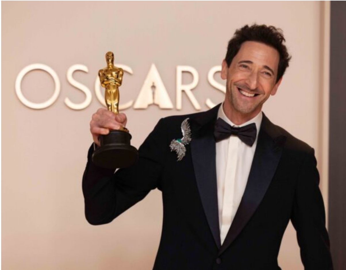
Adrien Brody

P.S. Adrien Brody did win the Oscar as Best Actor for The Brutalist . He said at the end of this acceptance speech: “I’m here once again to represent the lingering traumas and the repercussions of war, of systematic oppression, of anti-Semitism and racism, of othering. I pray for a healthier, happier and more inclusive world. I believe that, if the past can teach us anything, it’s a reminder to not let hate go unchecked. Let’s fight for what’s right. Keep smiling, keep loving one another. And let’s rebuild together.”