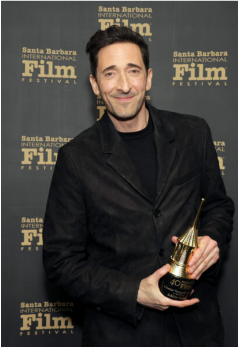
Adrien Brody.

On February 13 Adrien Brody and his costar Guy Pearce were honored with the Cinema Vanguard Award at the 40th Santa Barbara Film festival. During the Q&A he said: “I gained an understanding of the hardships many people endure, that sense of loss and suffering that is pervasive in this world.”