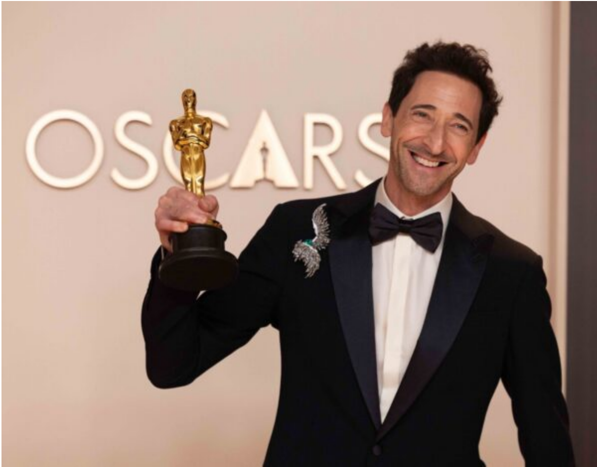
Adrien Brody

P.S. Adrien Brody did win the Oscar as Best Actor for The Brutalist . He said at the end of this acceptance speech: “I’m here once again to represent the lingering traumas and the repercussions of war, of systematic oppression, of anti-Semitism and racism, of othering. I pray for a healthier, happier and more inclusive world. I believe that, if the past can teach us anything, it’s a reminder to not let hate go unchecked. Let’s fight for what’s right. Keep smiling, keep loving one another. And let’s rebuild together.”