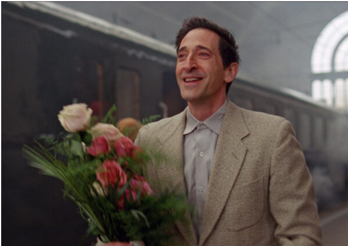
Adrien Brody — The Brutalist