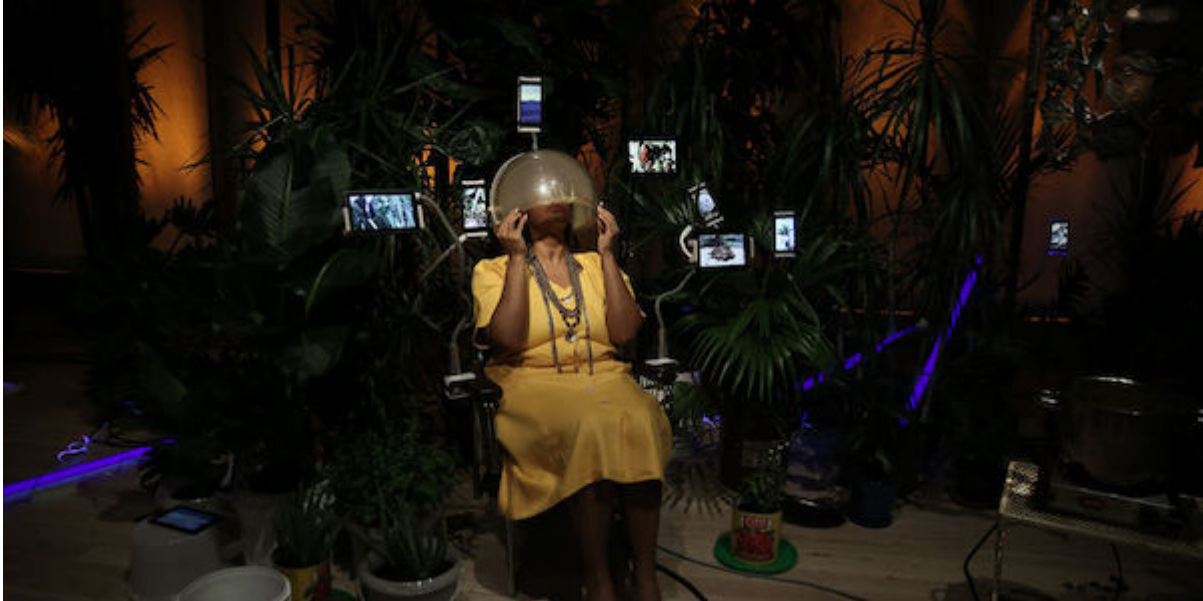
Hammer Museum's "No Humans Involved."