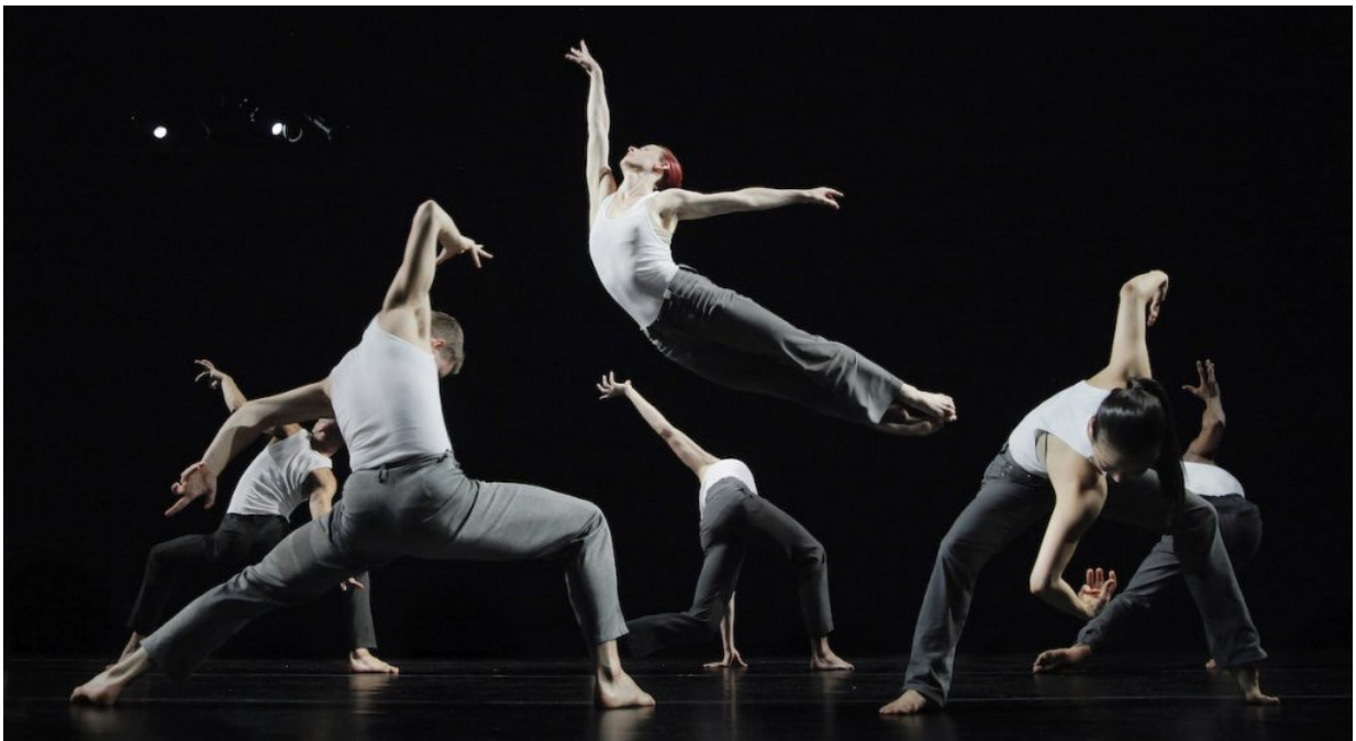
Invertigo Dance Theatre.

Invertigo Dance Theater Fall Soirée, online, Thurs., Oct. 21, 7:30 pm, reservations and donation levels at Invertigo Dance Theater .