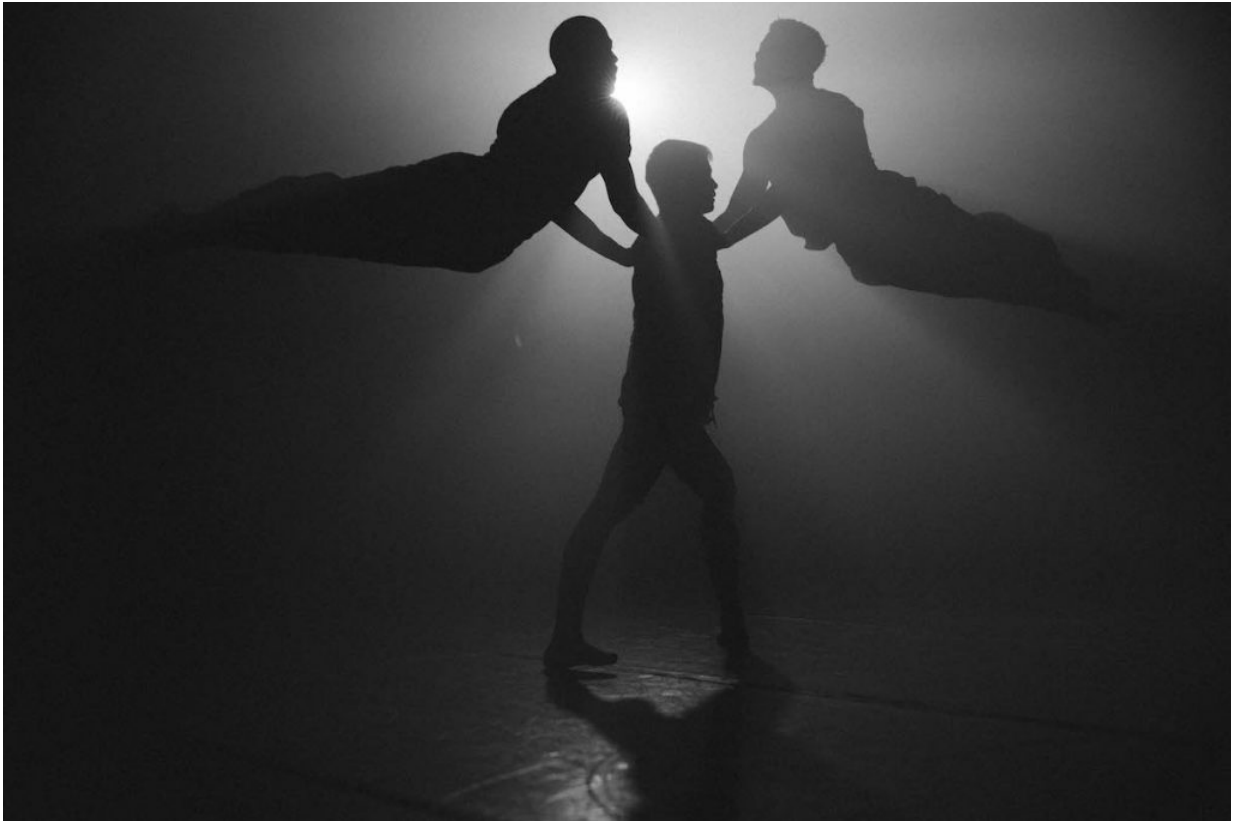
LA Dance Project.

Invertigo Dance Theater Fall Soirée, online, Thurs., Oct. 21, 7:30 pm, reservations and donation levels at Invertigo Dance Theater .