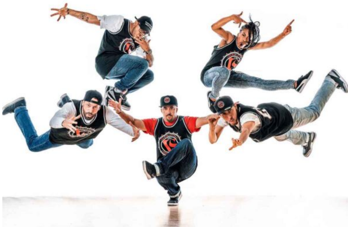
Versa Style Dance Company.