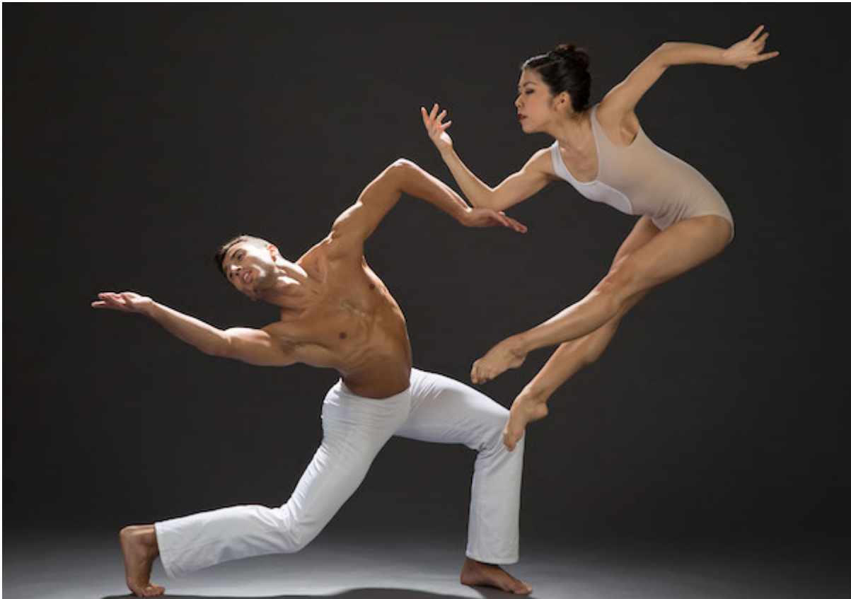
Ballet X.