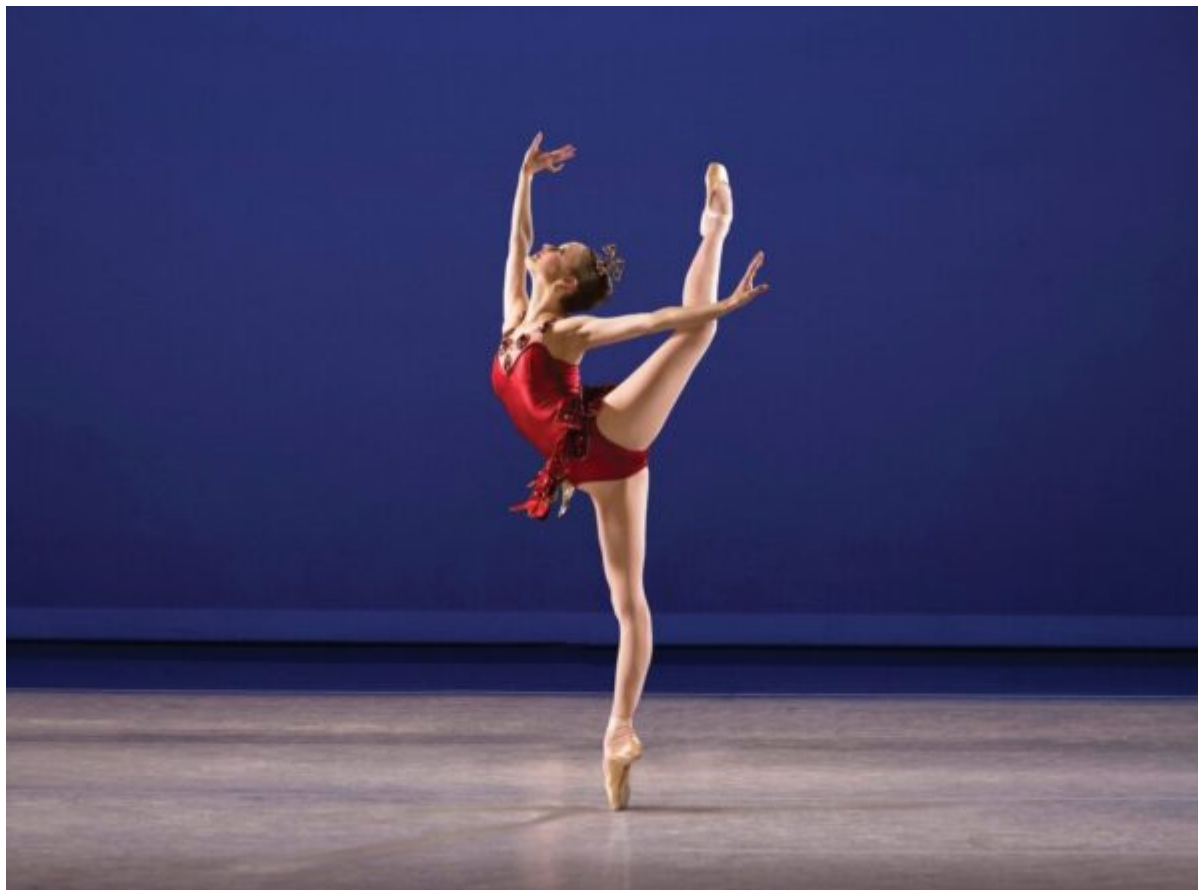
Los Angeles Ballet.