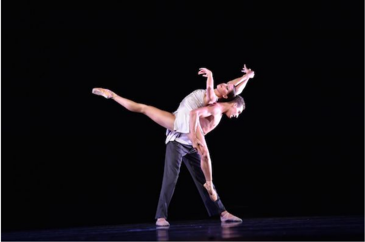
National Choreographers Initiative.