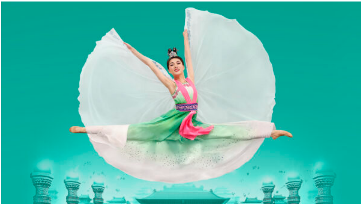
Shen Yun.

Presenting itself as “China before communism,” the touring company Shen Yun built its reputation on the athleticism, flexibility, and group precision of its dancers, but dodged questions about its connections with China’s banned Falun Gong. More recently, the organization has faced accusations of dancer abuse and a lawsuit alleging child labor violations. In that context, the company tours local venues from now through early February. At the Music Center, Dorothy Chandler Pavilion, 135 N. Grand Ave., Downtown LA; Thurs., Jan. 22, 2 pm, Fri., Jan., 23, 7:30 pm, Sat.-Sun., Jan. 24-25, 1 pm, $91-$231. Also at Thousand Oaks Civic Arts Plaza, 2100 E. Thousand Oaks Blvd., Thousand Oaks; Fri., Jan. 30, 7:30 pm, Sat.-Sun., Jan. 31-Feb. 1, 1 pm, $94.40-$196.95. Also at Long Beach Terrace Theater, 300 E. Ocean Blvd., Long Beach; Fri., Feb. 6, 7:30 pm, Sat.-Sun., Feb. 7-8, 1 pm, $89-$218. Shen Yun .