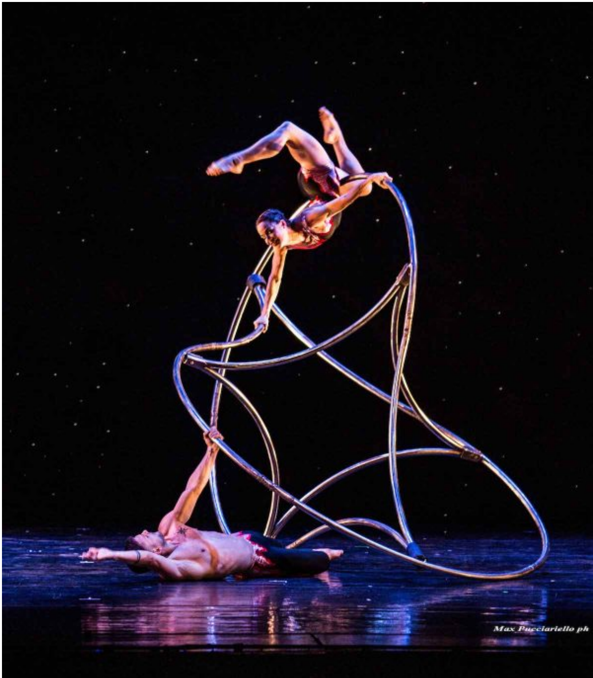
Momix in “Viva MOMIX.”

Dialogues + Sensations: Unearthed at ARC Pasadena (A Room to Create), 1158 E. Colorado Blvd., Pasadena; Fri.-Sat., Sept. 16-17, 8pm, $25. Info at Wild Roots Dance ; tickets at Eventbrite .