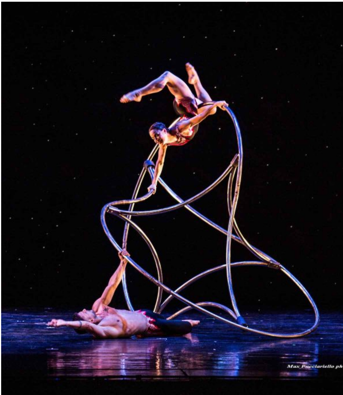
Momix in “Viva MOMIX.”

Dialogues + Sensations: Unearthed at ARC Pasadena (A Room to Create), 1158 E. Colorado Blvd., Pasadena; Fri.-Sat., Sept. 16-17, 8pm, $25. Info at Wild Roots Dance ; tickets at Eventbrite .