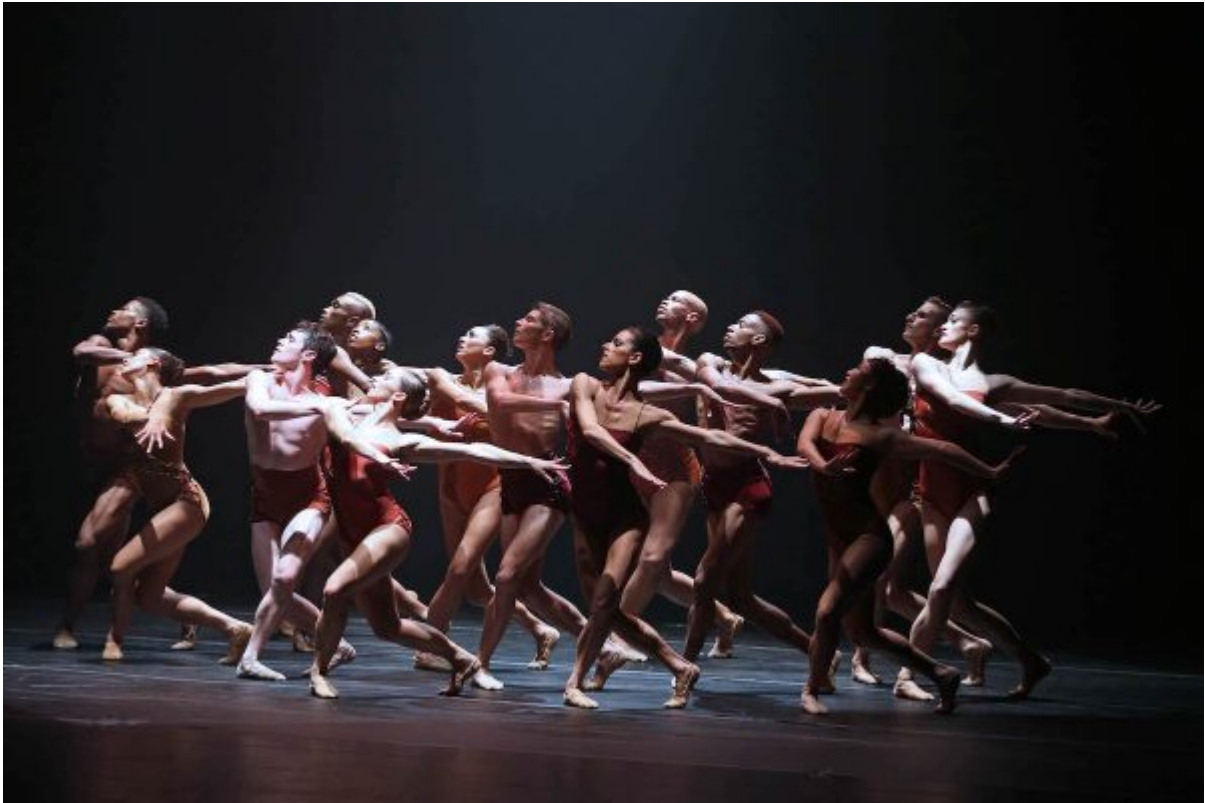
Complexions Contemporary Ballet.

Thurs., Sept. 15 to Sun., Sept. 25, various times and prices. Fulcrum Arts .