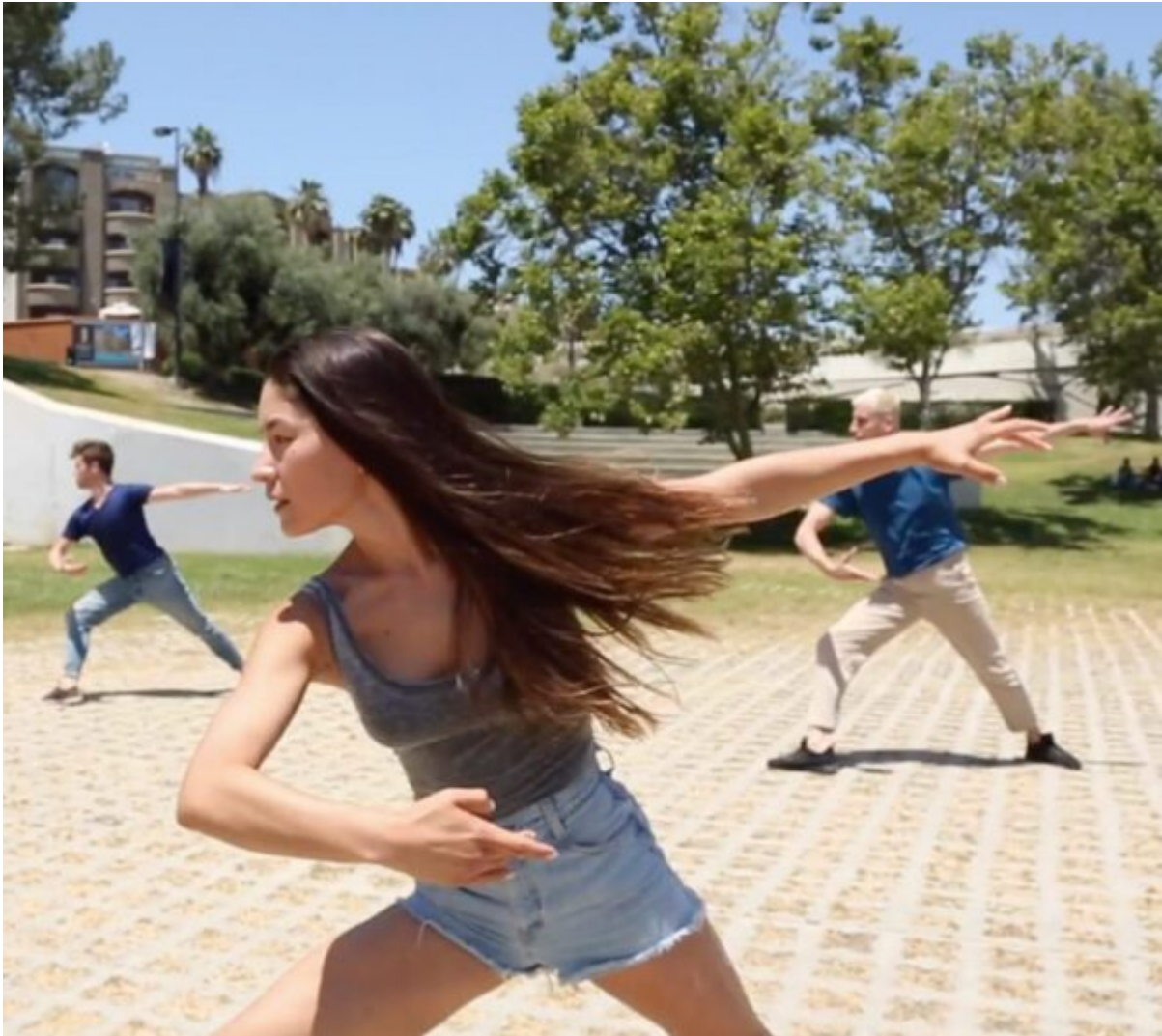
Barak Ballet.