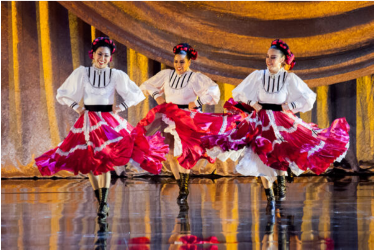
Pacifico Dance Company.