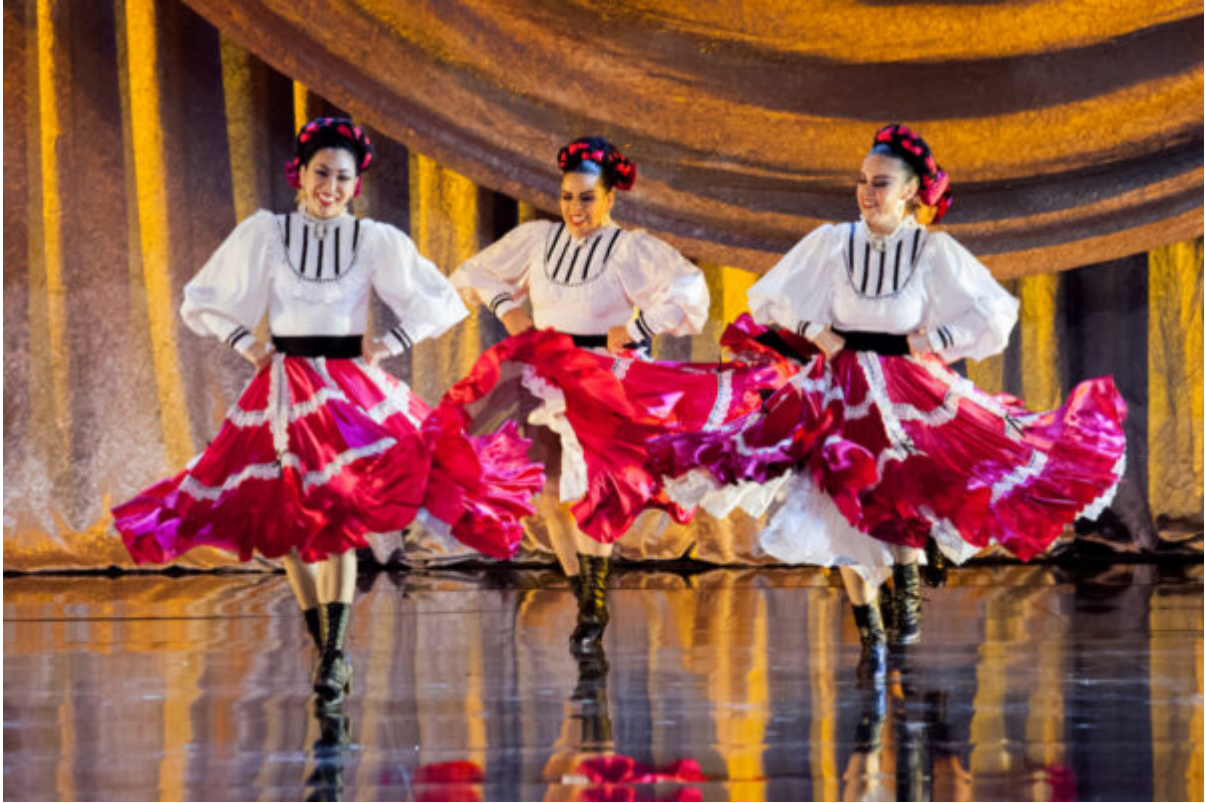
Pacifico Dance Company.