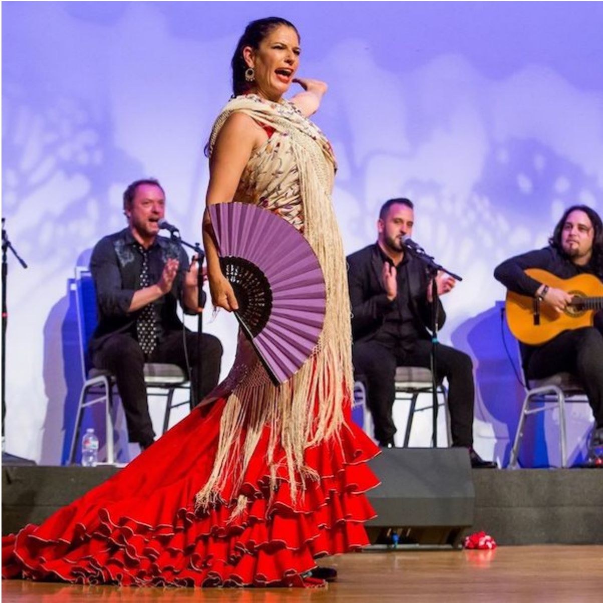
Esencia Flamenco Dance Company.