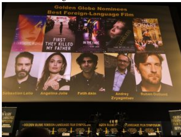
Nominated Foreign Films Directors

[alert type=alert-white ]Please consider making a tax-deductible donation now so we can keep publishing strong creative voices.[/alert]