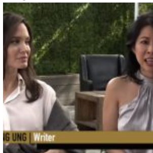
Loung Ung – Writer OF FIRST THEY KILLED MY FATHER