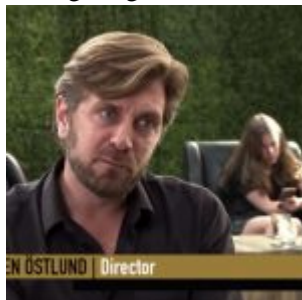
Ruben Östlund – Director of THE SQUARE