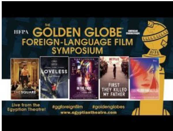
Nominated Foreign Films Posters