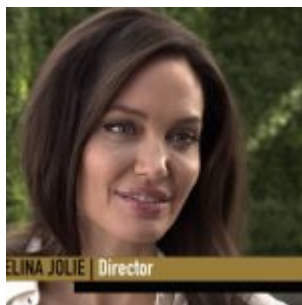
Angelina Jolie – Director of FIRST THEY KILLED MY FATHER