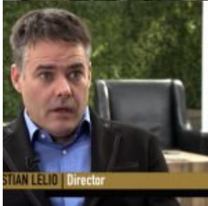
Sebastian Lelio – Director of FANTASTIC WOMAN