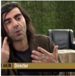
Fatih Akin – Director of IN THE FADE