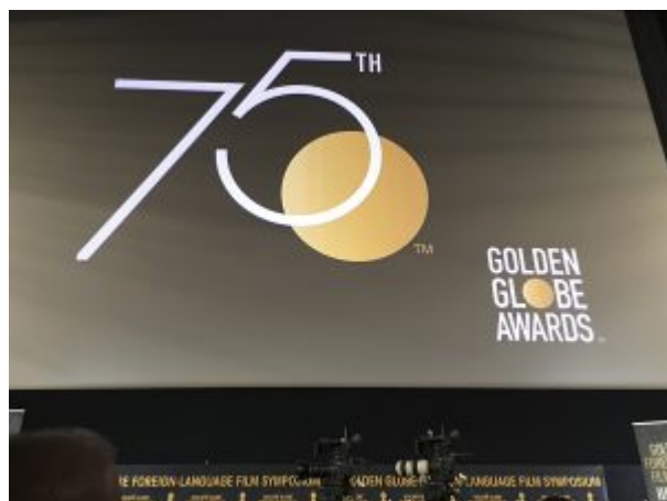
Golden Globes 75th Anniversary