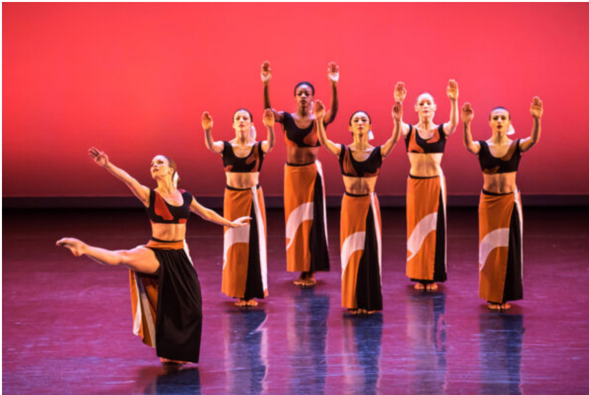
Martha Graham Dance Company.