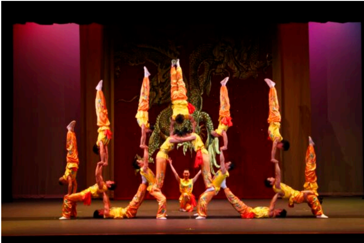
The Peking Acrobats.

Known for their astonishing flexibility, balance, athleticism and acrobatics, The Peking Acrobats return for one performance. The popular troupe retain the pre-Beijing name they have performed under since their founding, stating they feared audience confusion given their established brand. Segerstrom Center for the Arts, Segerstrom Concert Hall, 600 Town Center Dr., Costa Mesa; Sat., Jan. 18, 8 pm, $55.37 $111.87. SCFTA .