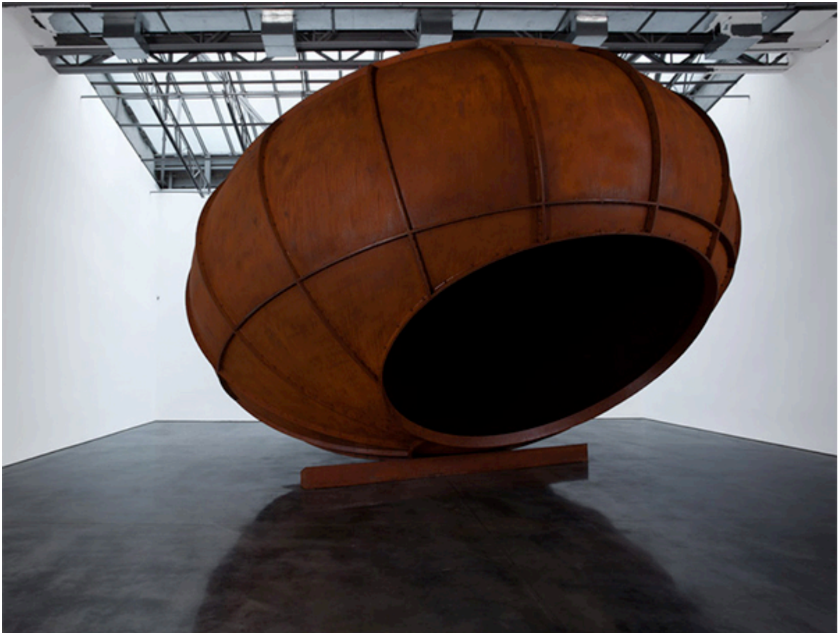
At Gladstone Gallery, New York