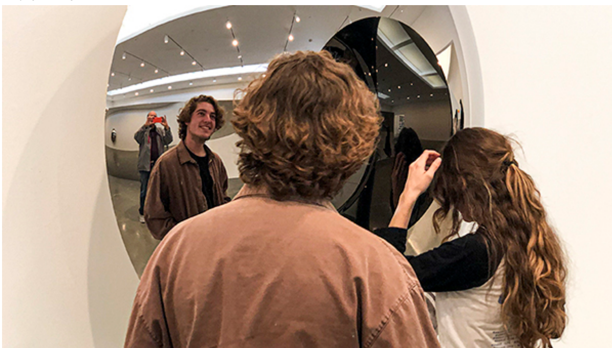
In the Mirror