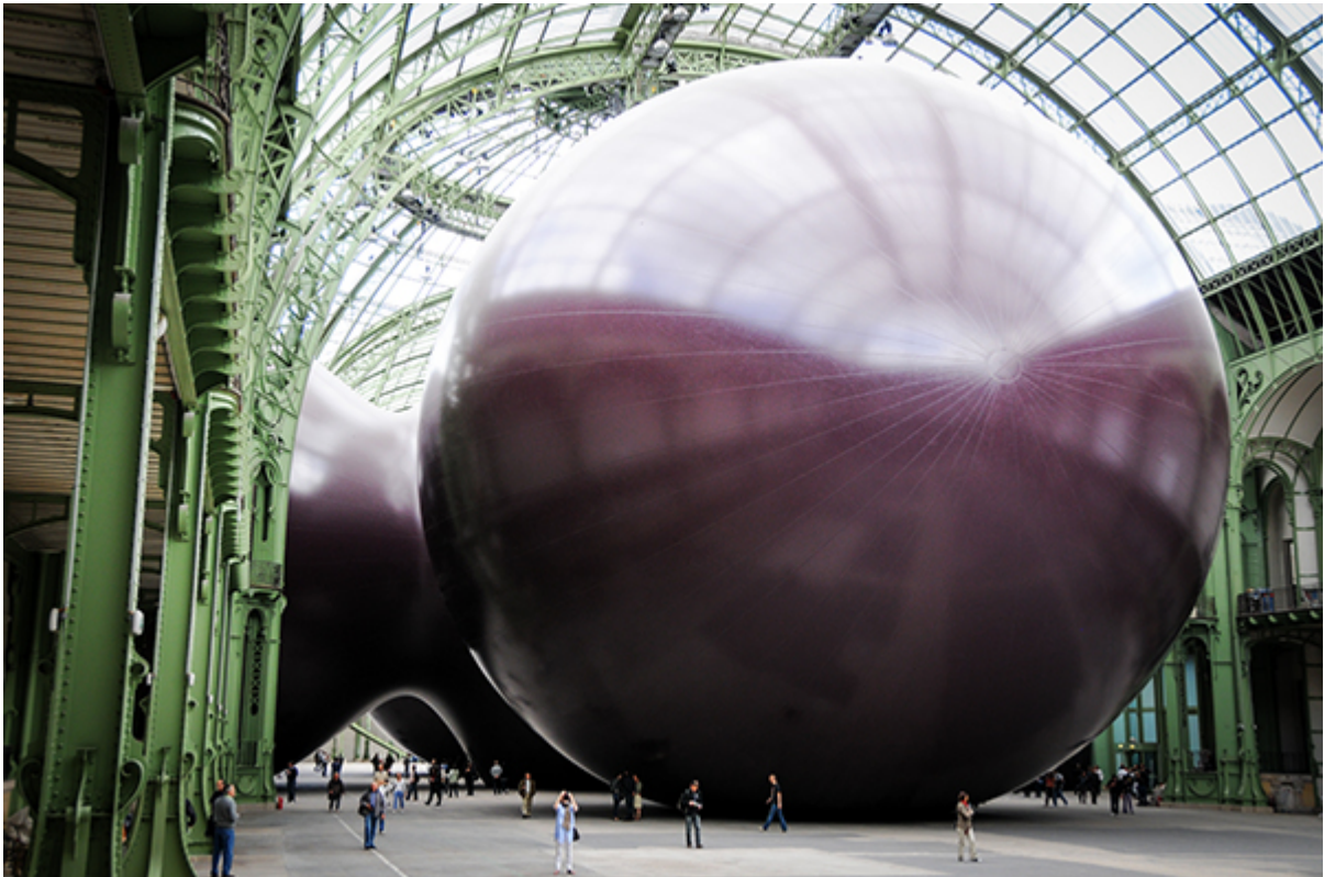
"Leviathan," Grand Palais, Paris