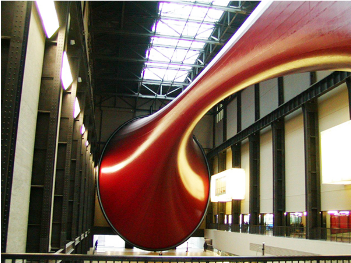
"Marsyas," Tate Modern, London