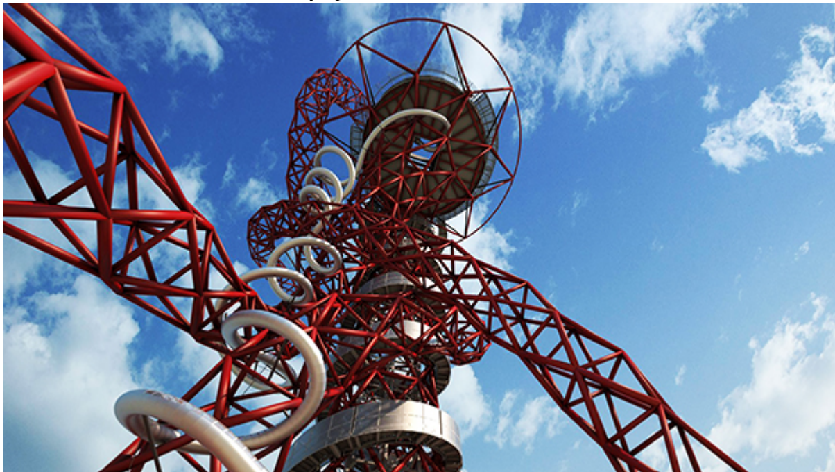
“ArcelorMittal Orbit “