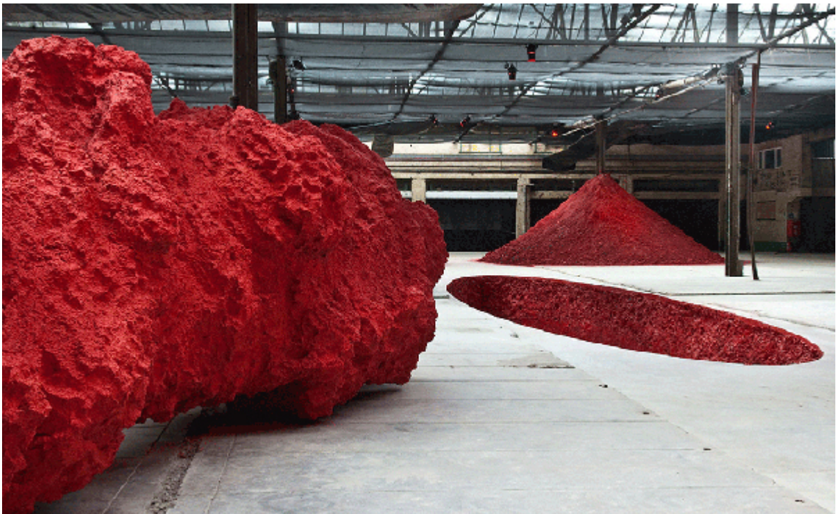
In Buenos Aires