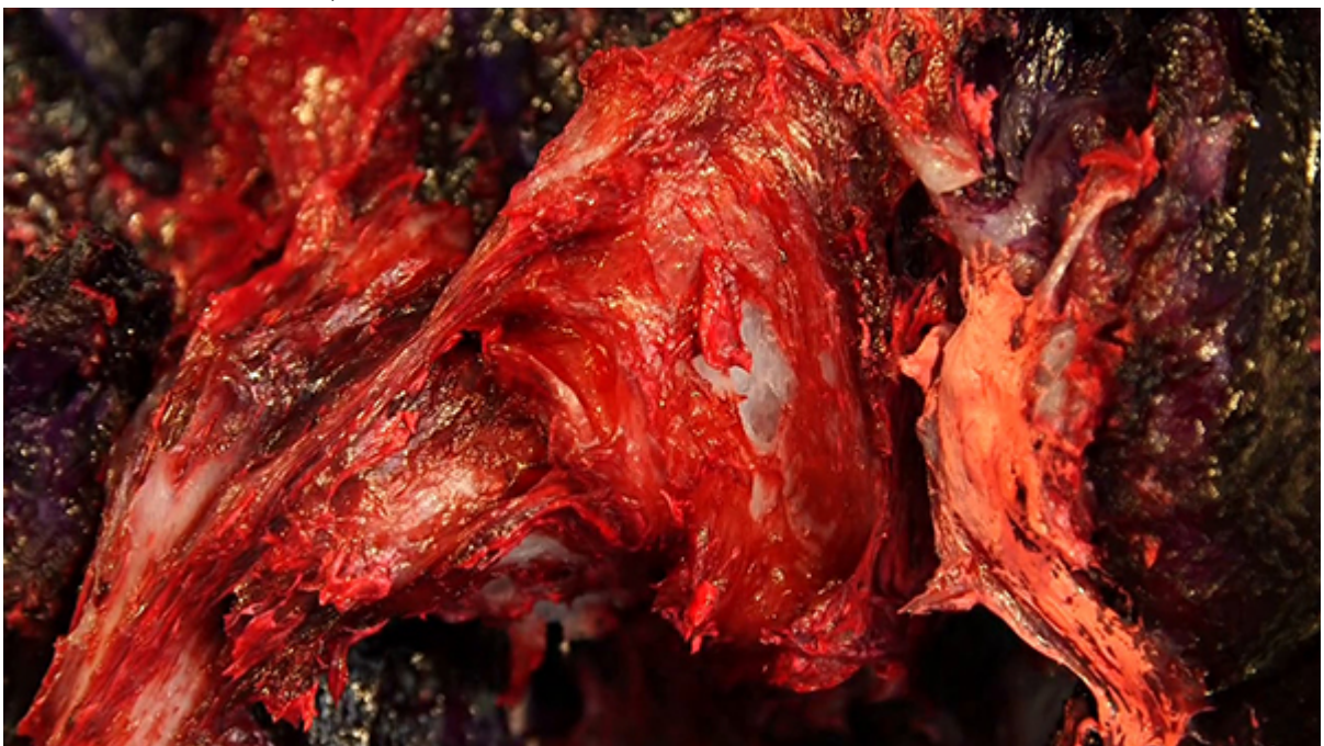
At the MACRO Museum, Rome – Detail