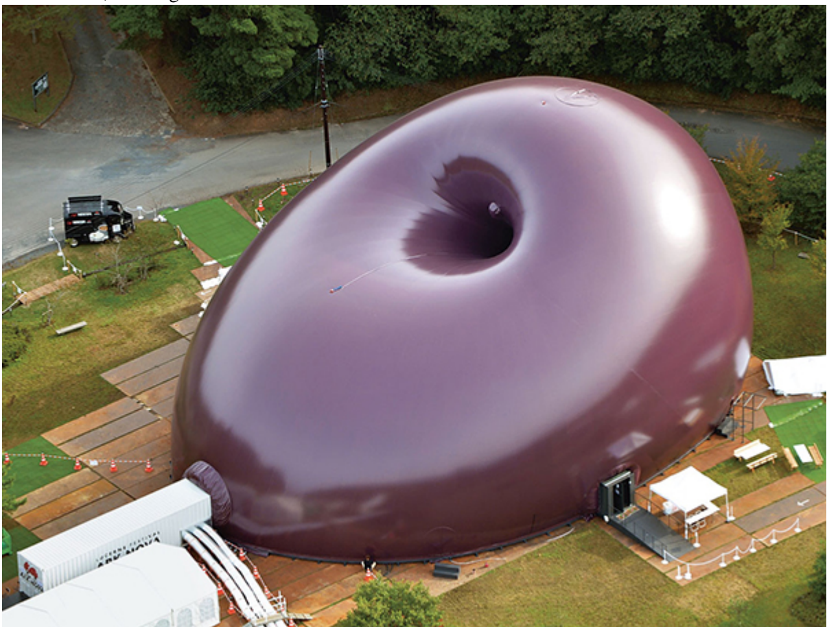
“Art Nova”Inflatable Concert Hall,” with Arata Isozaki, Japan