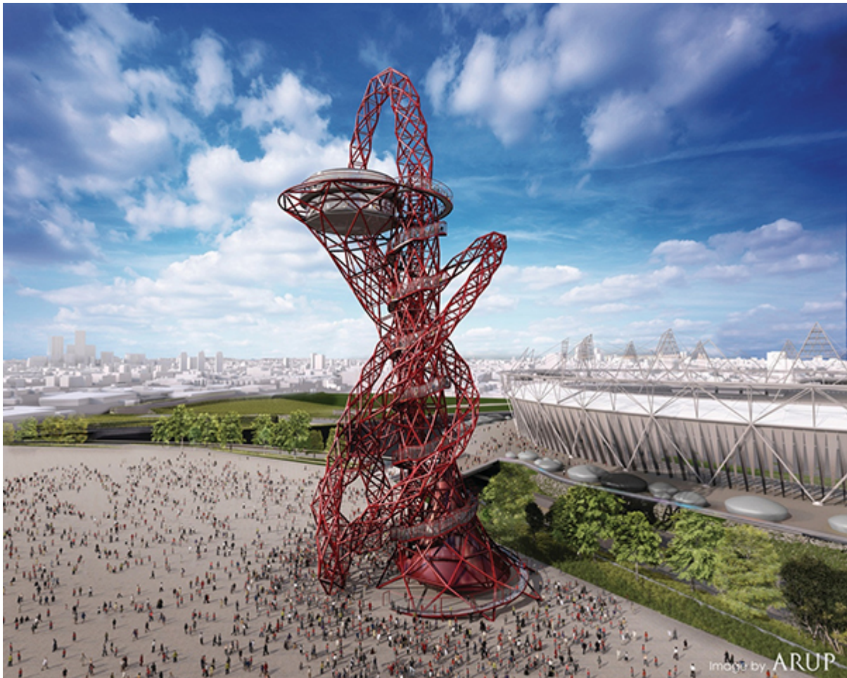
“ArcelorMittal Orbit” at London’s Olympic Park