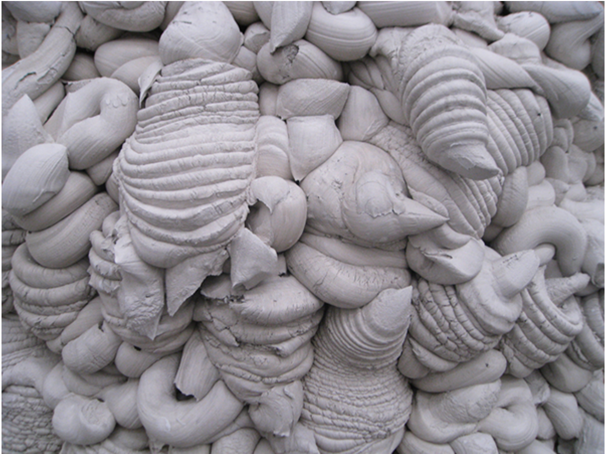
Printed Cement, Detail