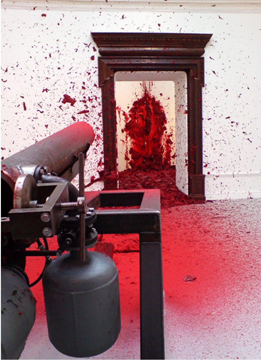
At the MACRO Museum, Rome