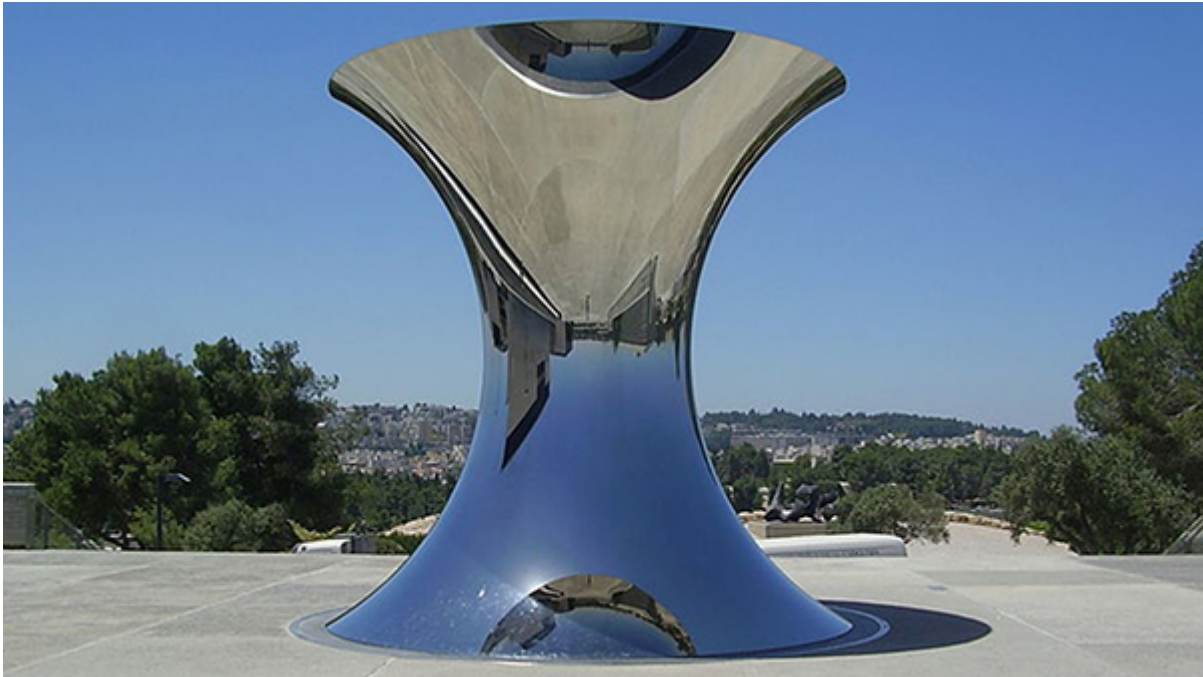
“Turning the World Upside Down,” Israel Museum, Jerusalem