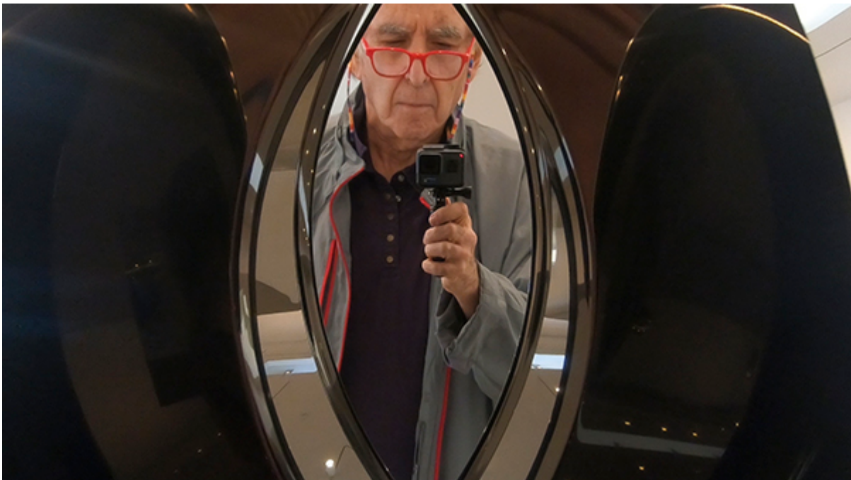
Shooting at the Mirror