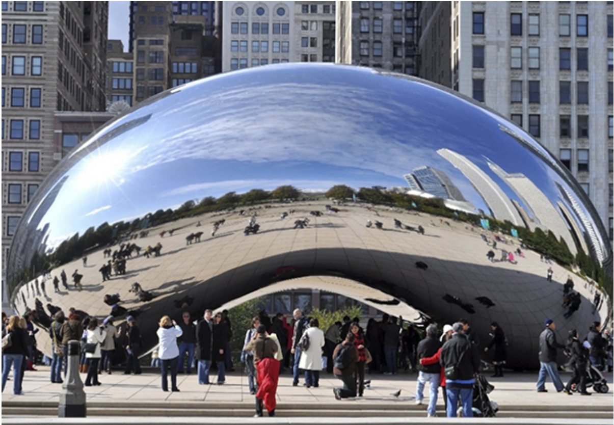
“Cloud Gate,” Chicago