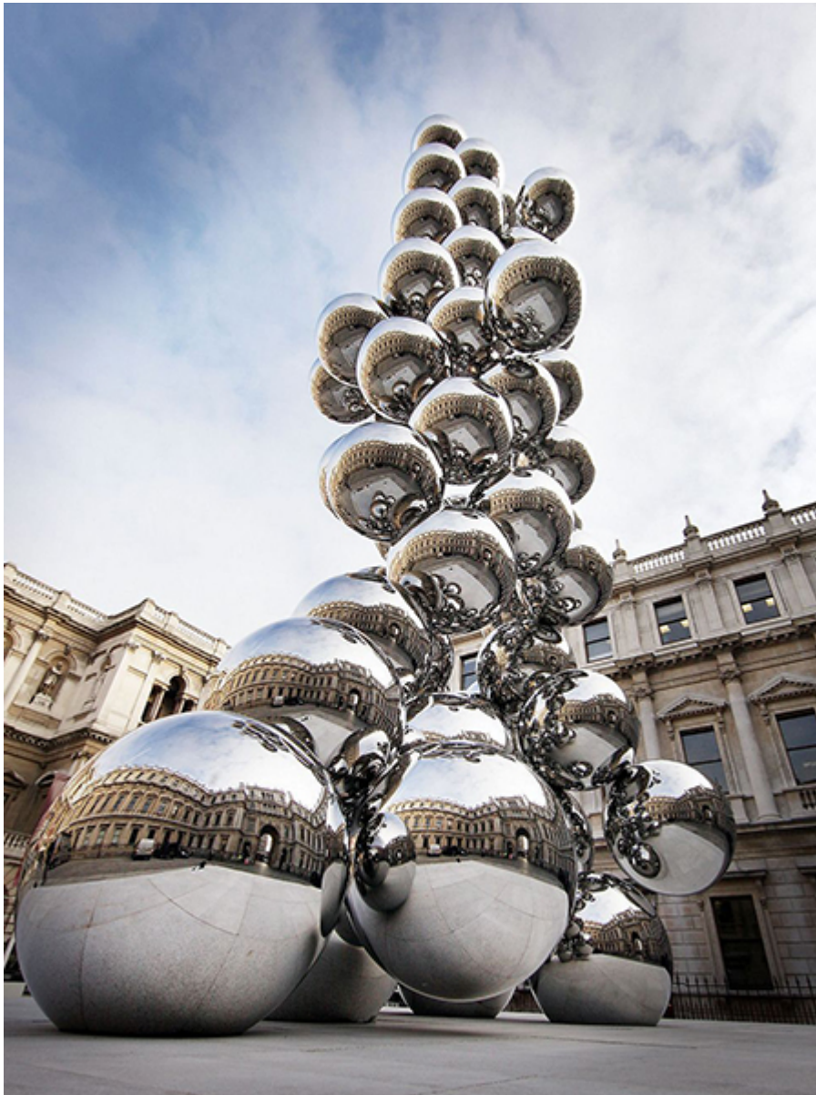
“Tall Tree and the Eye,” London

The exhibit of Kapoor's stainless-steel Double S-Curve at the Regen Projects gallery in Hollywood is good art news for Southern California.