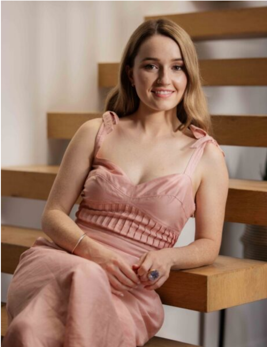
Kaitlyn Dever as Belle

Kaitlyn Dever plays Belle Gibson , an Australian social media influencer who falsely claimed to have cured a malignant brain tumor through a regimen of healthy recipes detailed in her app The Whole Pantry launched in 2013 and a cookbook published in 2014.