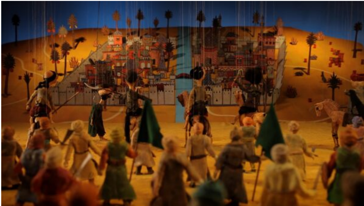
Wael Shawky.

Originally commissioned for the Egyptian Pavilion at the 2024 Venice Biennale, the film installation Drama 1882 from Wael Shawky considers the events that countered a revolt against European colonial influence, resulting in Britain cementing its control of Egypt for another seven decades. Adapting the storied events into the form of an opera and performed in classical Arabic, Shawky choreographed, wrote, scored, and directed. This event is the latest in the museum's Wonmi's WAREHOUSE Programs . WAREHOUSE, MOCA Geffen Contemporary, 152 N. Central Ave., Little Tokyo; Thurs. – Sun., thru March 16, 11 am, free w/reservation at Tickets .