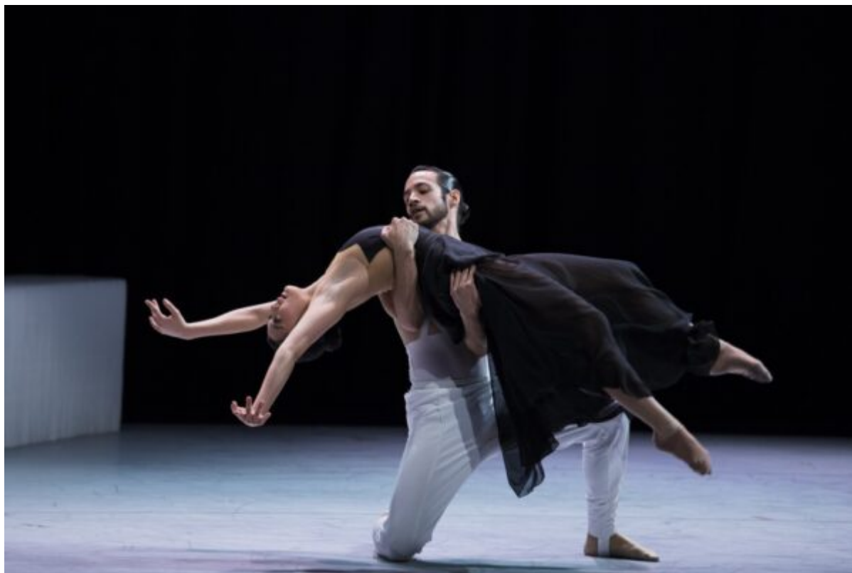
Ballet Hispánico.

6200 E. Atherton St., Long Beach; Sat., March 15, 8 pm, $55. Carpenter Center . Also at the McCallum Theatre, 7300 Fred Waring Dr., Palm Desert; Mon., March 17, 7 pm, $53-$98. McCallum Theatre . Also at the Fred Kavli Theatre, Bank of America Performing Arts Center, 2100 E. Thousand Oaks Blvd., Thousand Oaks, Thurs., March 20, 7:30 pm, $60.25 – $75.65. B of A PAC .