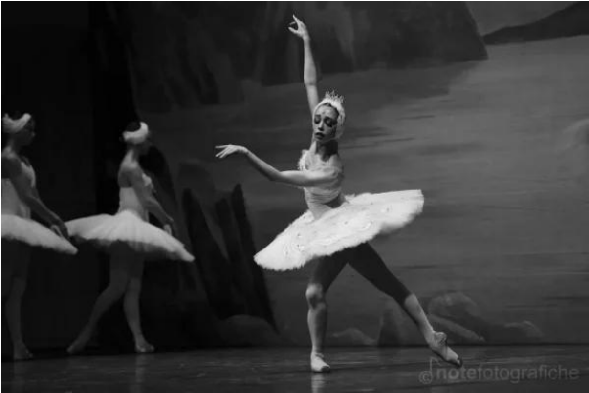
Grand Kyiv Ballet.