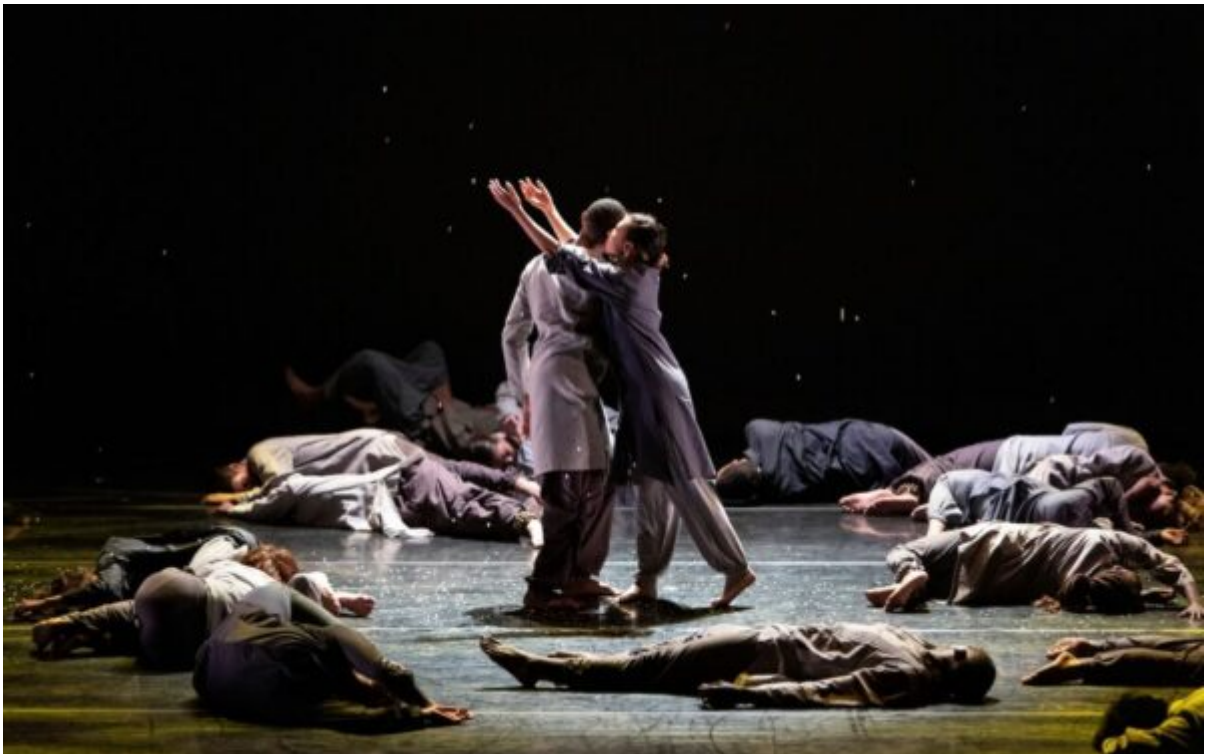
Blue13 Dance Company.

In the latest event affirming this venue's affinity for presenting LA dance, Blue 13 Dance Company shares Bollywood is Gay! . For two decades, the LA-based company has polished its blend of contemporary and Hindi film-inspired Bollywood dance. LA LGBT Center, 1118 McCadden Pl., Hollywood; Sat., March 15, 8 pm, $29-$60. Tickets .