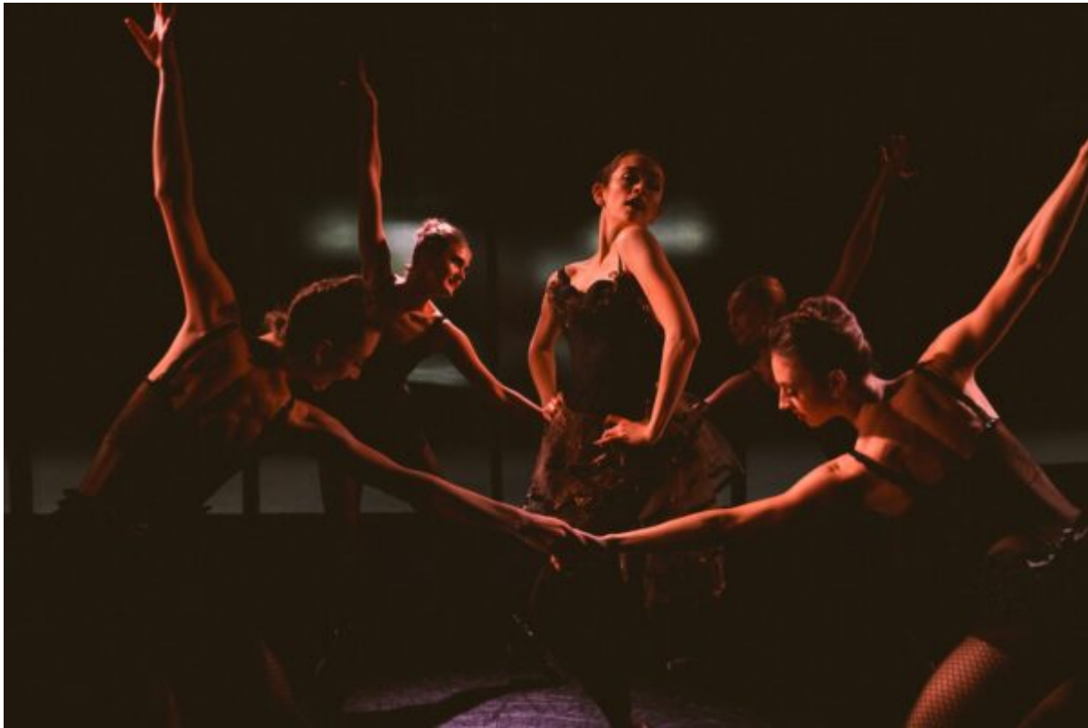
American Contemporary Ballet.

Over four weekends, American Contemporary Ballet alternates two works from its repertory. Jazz music and its world are the subject of Jazz , while Homecoming pays tribute to high school and marching bands. In addition to the choreography from artistic director Lincoln Jones, each evening involves refreshments and live music. ACB Studios, Bank of America Plaza, 333 S Hope St, Suite C-150, downtown; Jazz — Fri., March 14, 21, & Thurs., March 13 & 20, 8 pm, Homecoming — Sat., March 15, & Thurs.-Sat., March 27-29, 8 pm, $65-$140. American Contemporary Ballet .