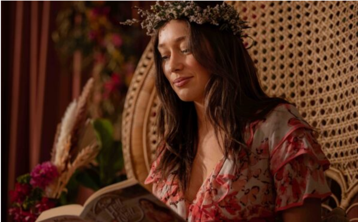
Alycia Debnam-Carey as Milla