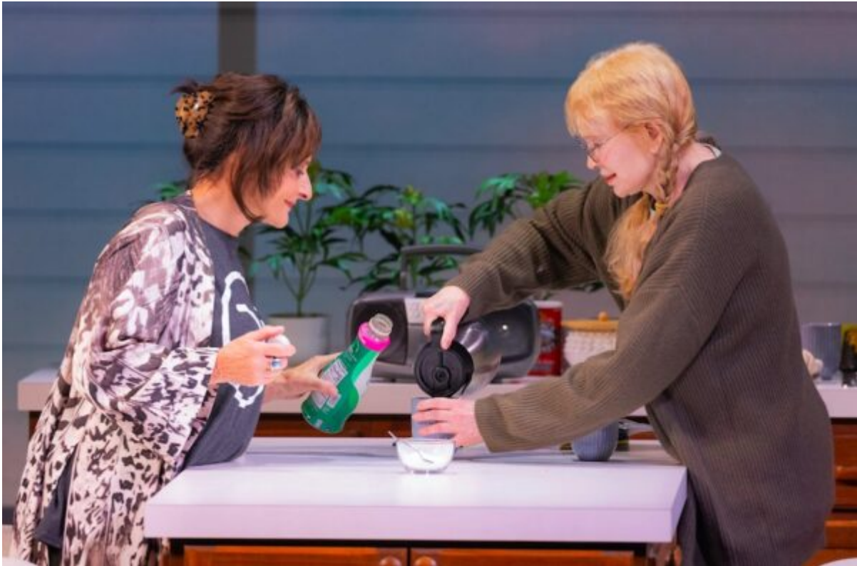
Patti LuPone and Mia Farrow in The Roommate .