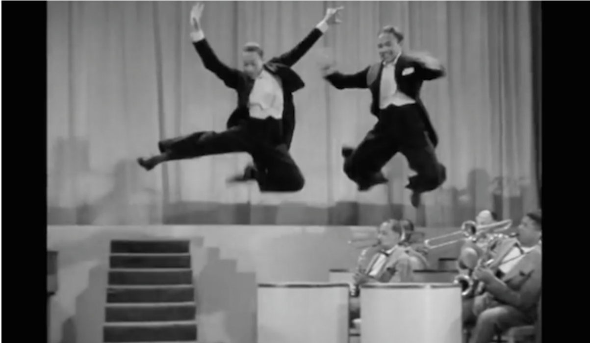
Fayard and Harold Nicholas, The Nicholas Brothers.