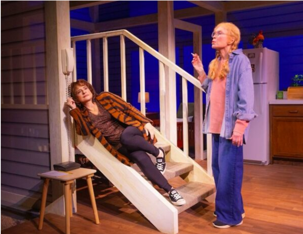
Patti LuPone and Mia Farrow in The Roommate .