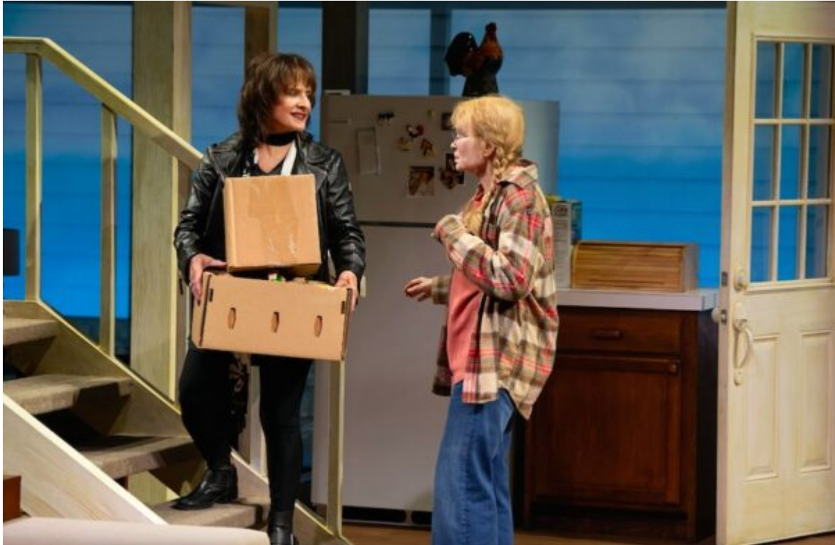
Patti LuPone and Mia Farrow in The Roommate .

tactic may just be a decision on director Jack O'Brien's part to get the star factor out of the way and allow us to concentrate on the play at hand, but this blatant celebrity intro is an inadvertent acknowledge of the production's raison d'être . We're here to see two big names in rare circumstances—this is one of Farrow's few stage appearances and an infrequent non-musical outing for LuPone, particularly after she very publicly renounced her Equity membership. Silverman's play is a secondary consideration.