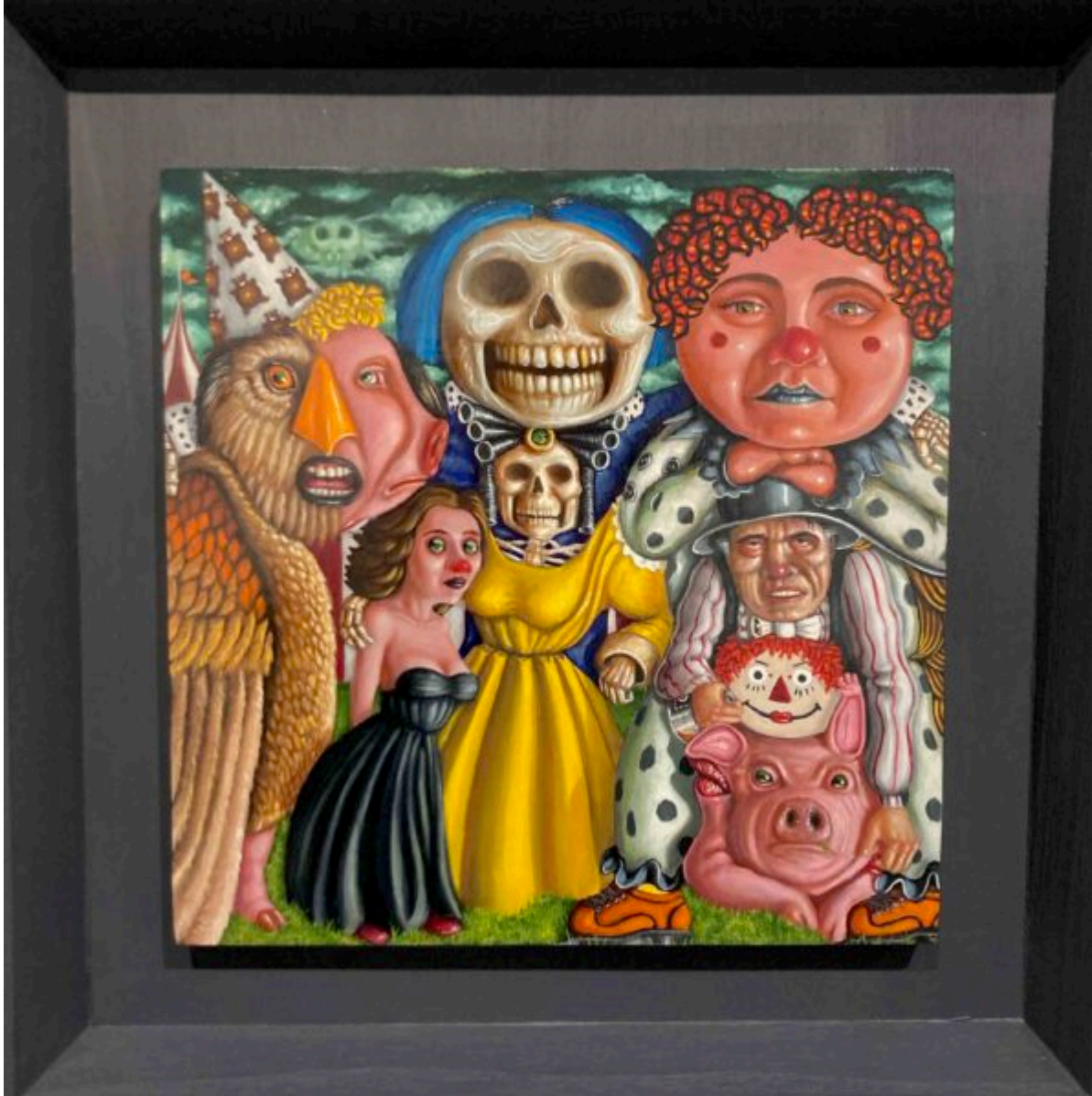
Circus Family Photo

I only include a taste of the elaborate captions, that you may read by clicking on the titles. This will give you some idea of what is depicted and the artist’s ironic intentions.