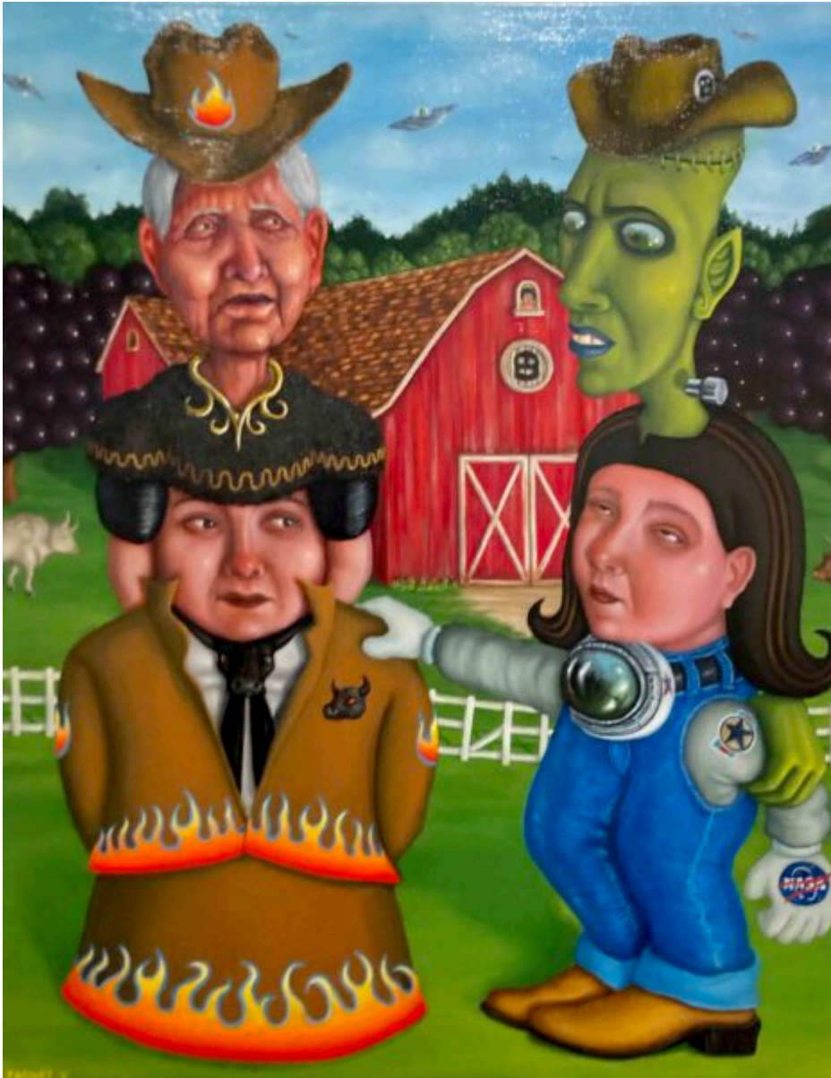
Mischievous MaddyMatador © FADNUT 2023

Mischievous MaddyMatador: Welcome to El FADNAT Ranch! It's run by an OldCowGal named,"El Fuego!"