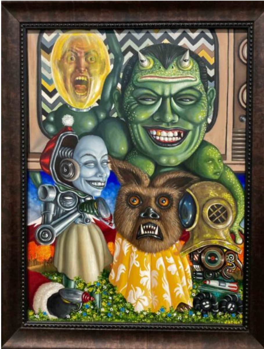
Green Devil & Peace Frog © FADNUT 2022

GreenDevil & PeaceFrog: The Horney Toad of Peace is a Cult leading SexGuru, that believes Elvis has been reincarnated in him