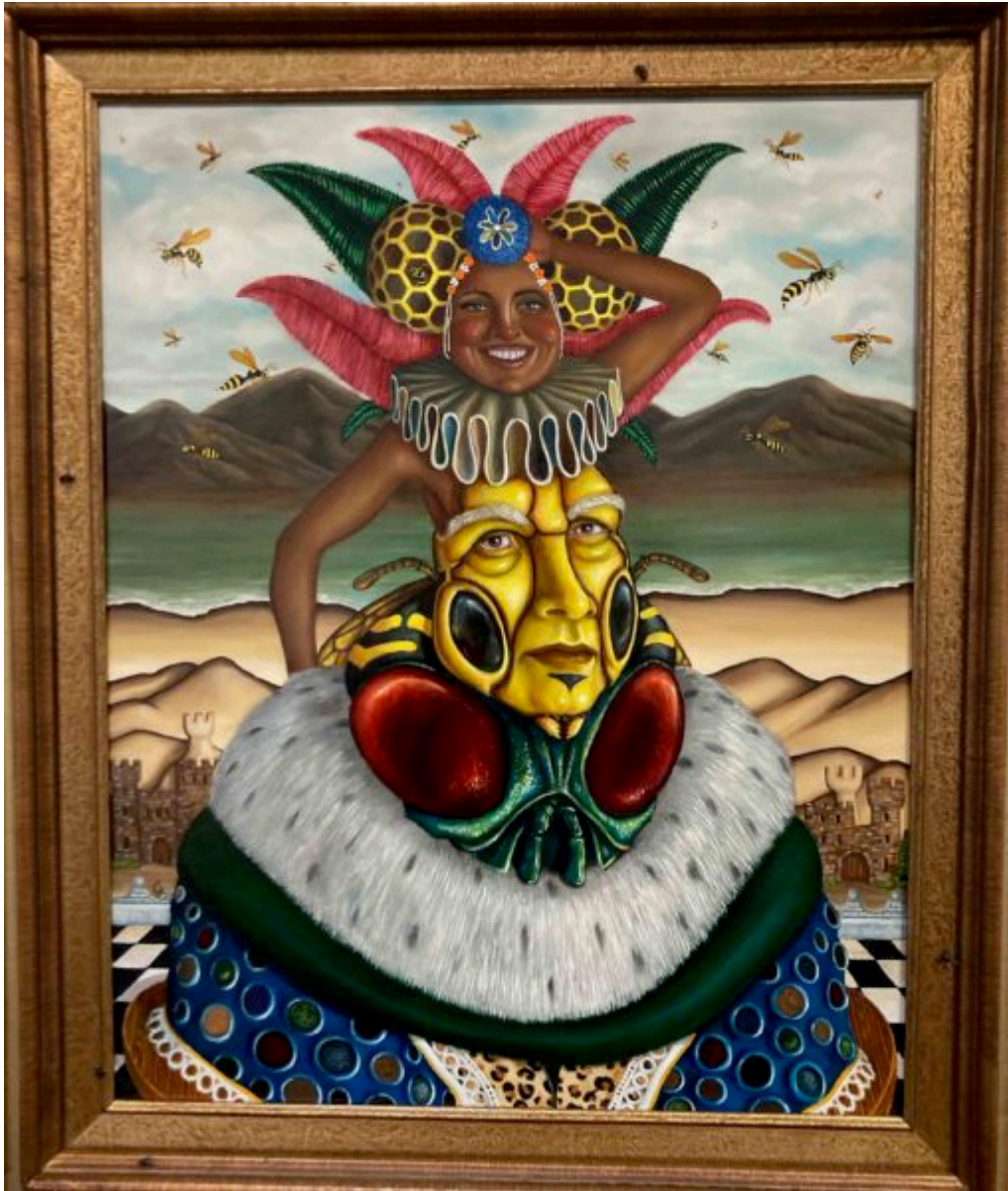
WaspKing's Dilemma

WaspKing's Dilemma: He is mostly human, but has yellow skin & a wasp coming out of his face. He married the Queen of Flies. She's 100% Fly & human size