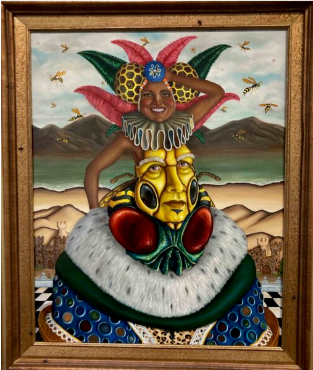
WaspKing's Dilemma

WaspKing's Dilemma: He is mostly human, but has yellow skin & a wasp coming out of his face. He married the Queen of Flies. She's 100% Fly & human size