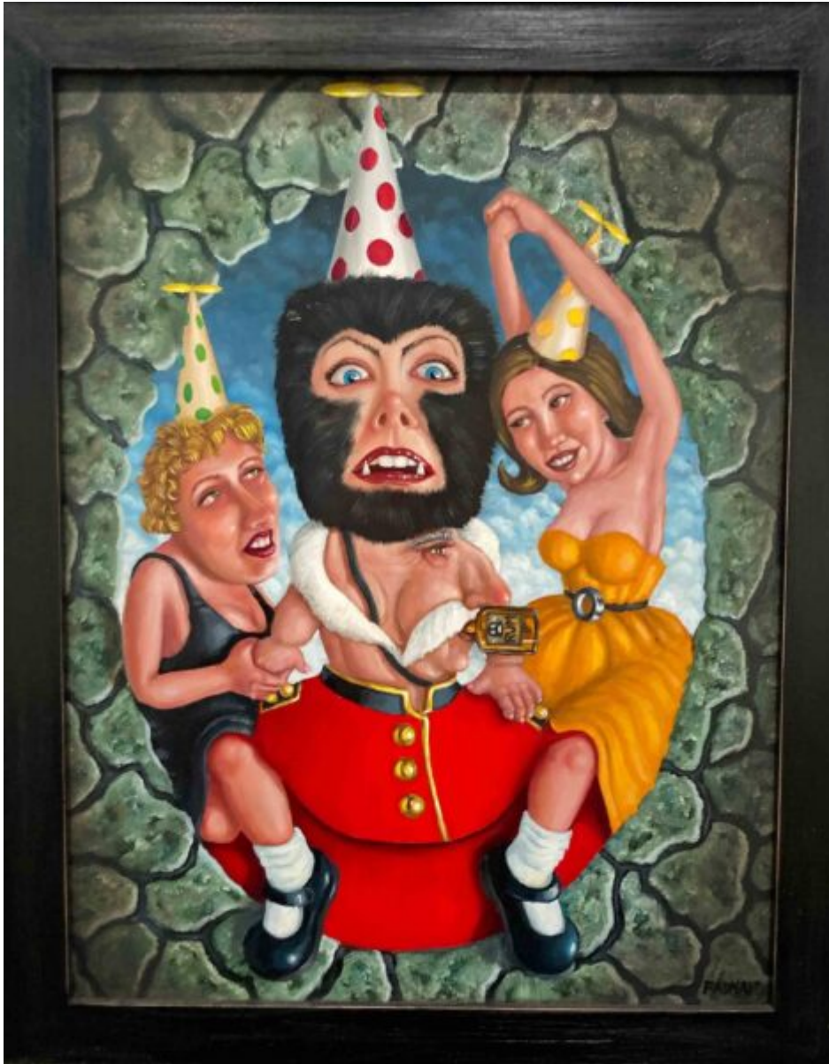
WolfGirl BeefeaterStripper © FADNUT 2021

WolfGirl BeefeaterStripper: The doors were violently kicked in to find a naked Sasha Baron Cohen