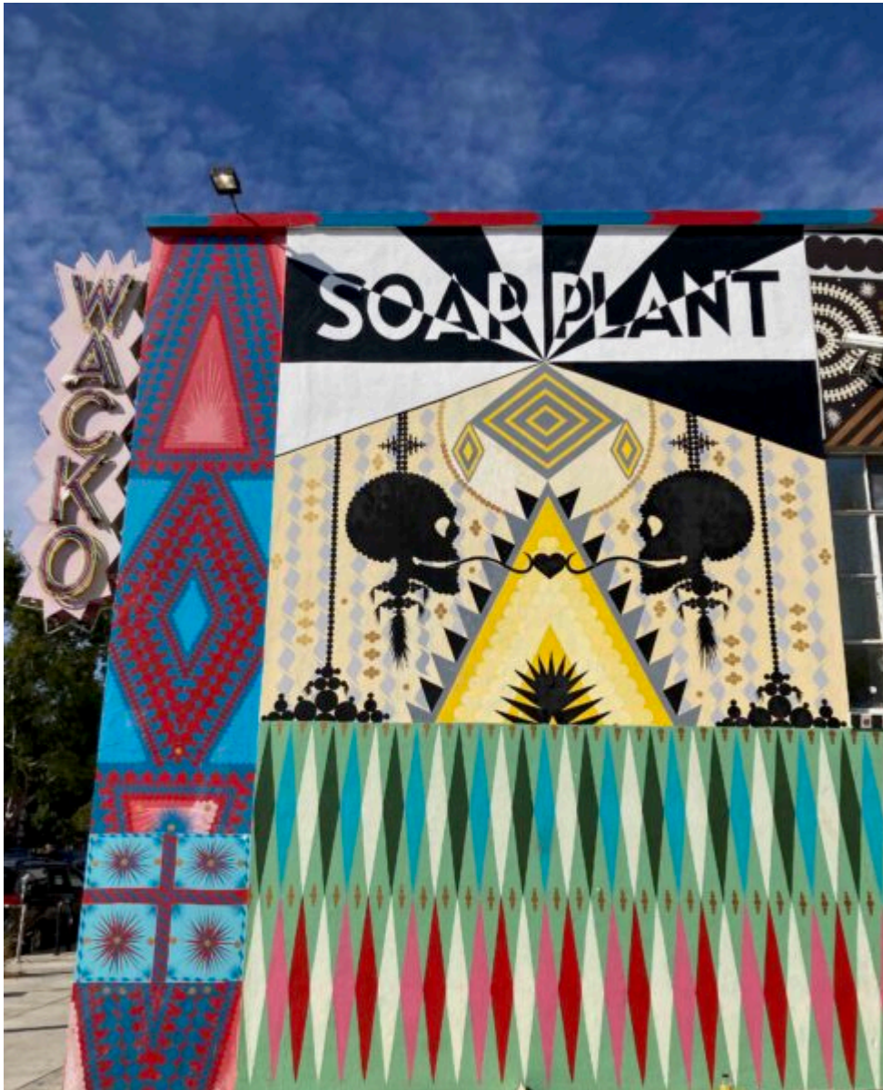
Wacko Soap Plant. Mural by Shrine © 2016

Inspired by an LA Times article about the Los Feliz neighborhood, I went to check out the latest art at the Luz de Jesus gallery inside the Wacko Soap Plant , on Hollywood Blvd East of Vermont.