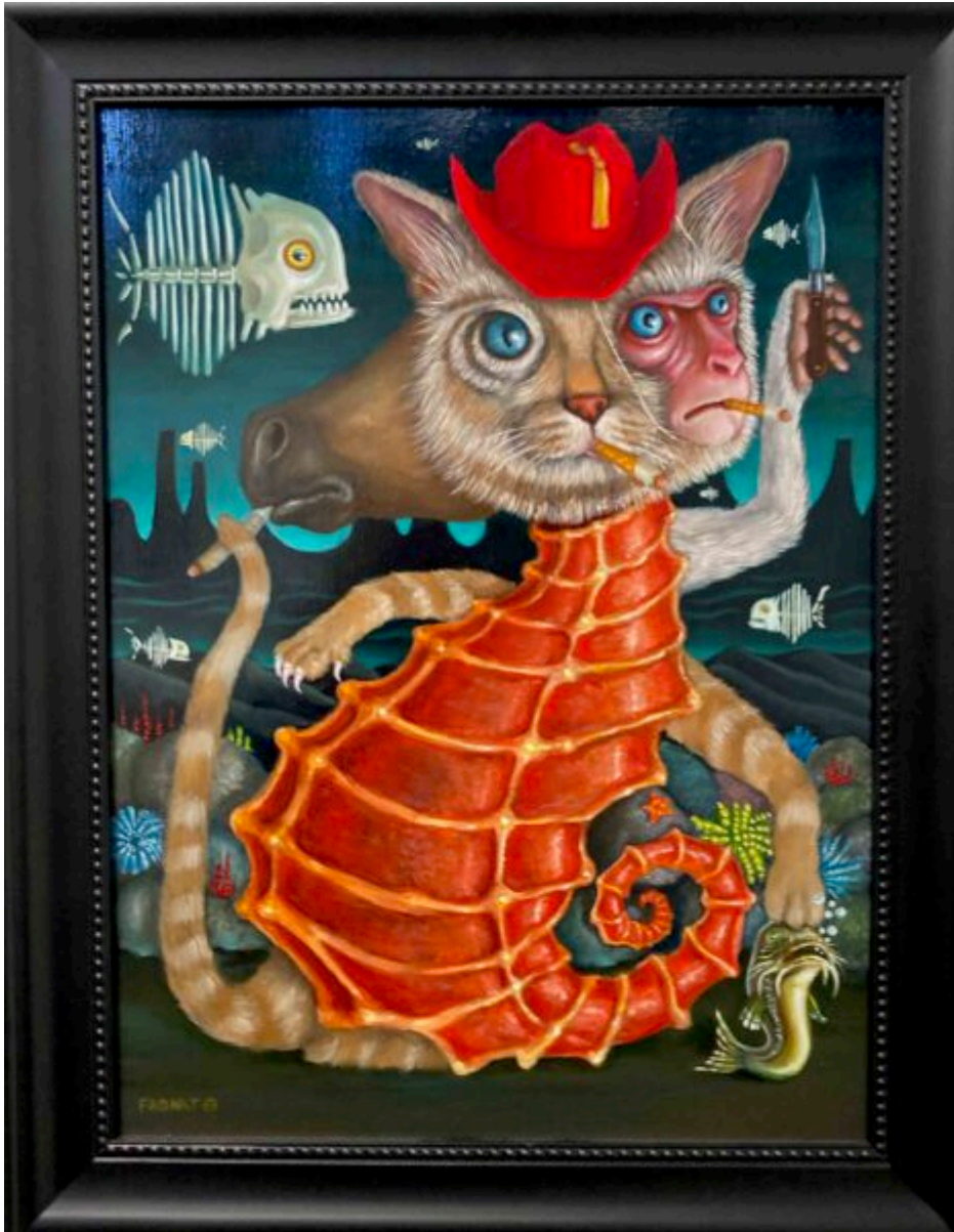
Seahorse MonkeyCat

The Seahorse MonkeyCat: Smoky was conceived in the 80's when Dr. Frankenstein was hired to create a fun sidekick for the MarlboroMan