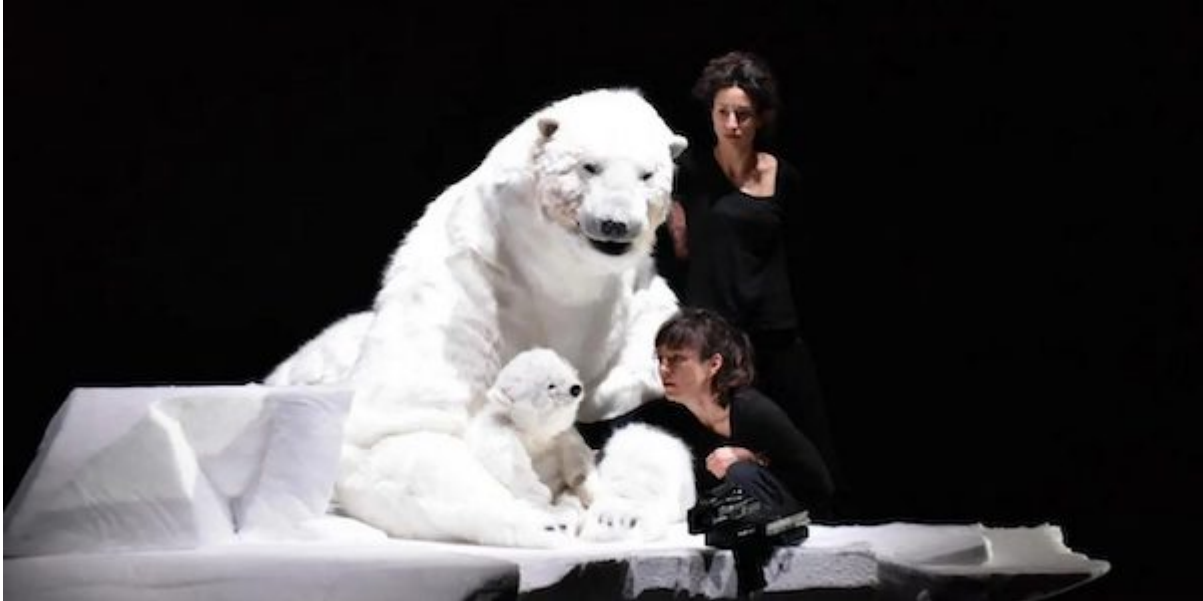
Chaliwaté Company & Focus Company.