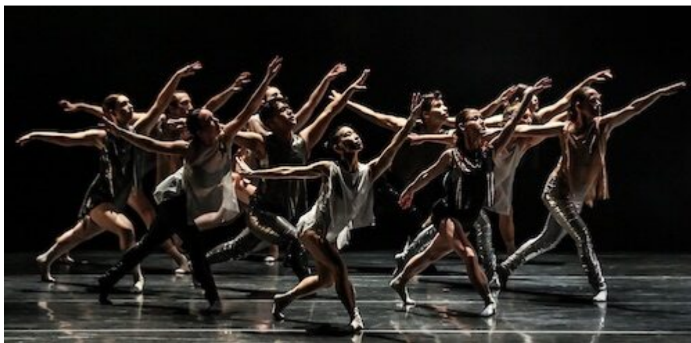
Backhausdance.

Backhausdance at L.A. Dance Project Studios, 2245 E. Washington Blvd., Arts District; Sat. April 15, 8 pm, $30, $20 students Backhausdance .