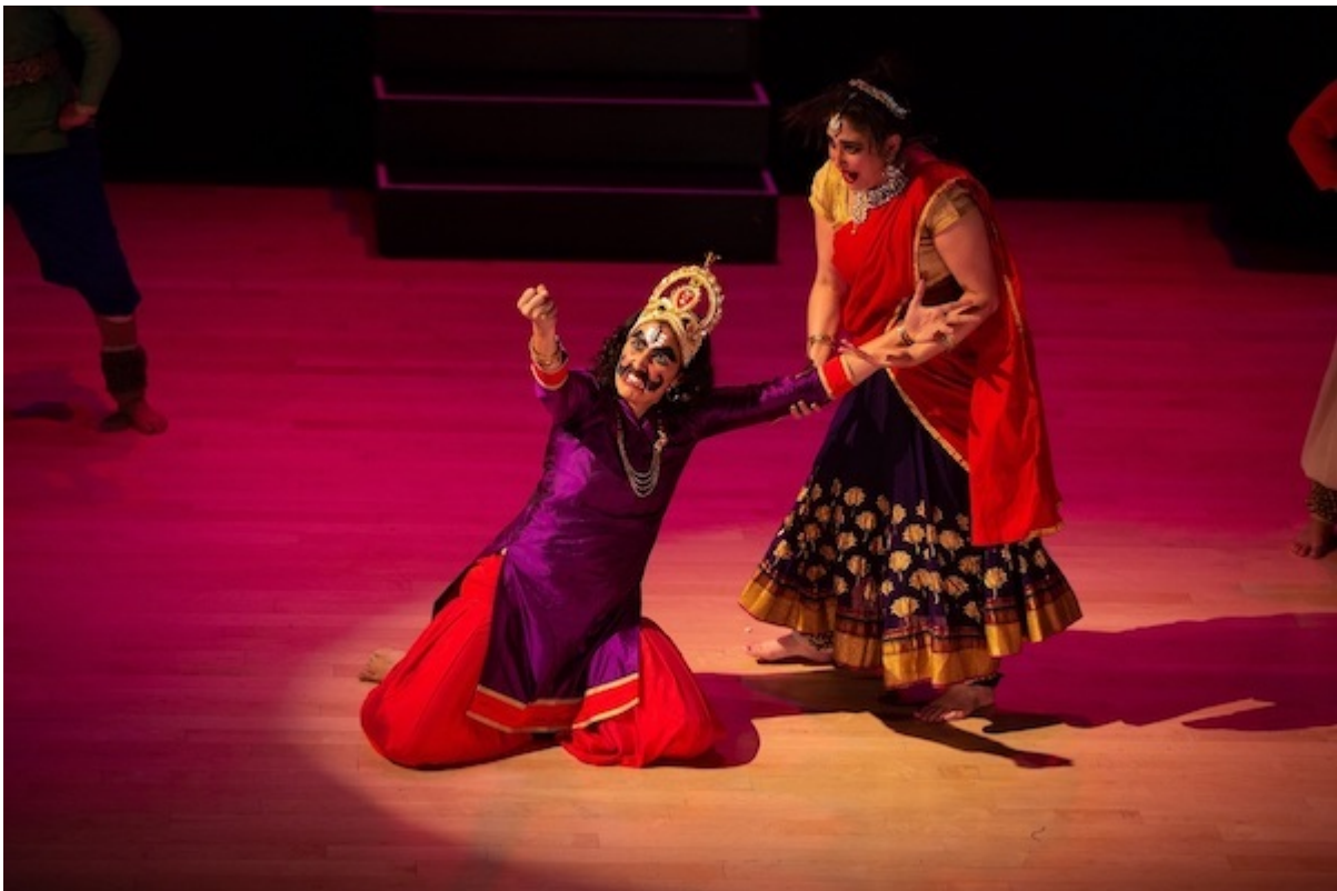
Leela Dance Collective.

Set in a beautiful, circular chamber concert venue, Leela Dance brings classical South Asian dance to this concert with music ensemble Salastina. This concert initiates a planned, ongoing collaboration of the two organizations. There also is a livestreamed option. Doheny Mansion, Pompeian Room, 10 Chester Pl., University Park; Sat., April 8, 11 am, $20, $10 students, $10 livestream. Salastina .