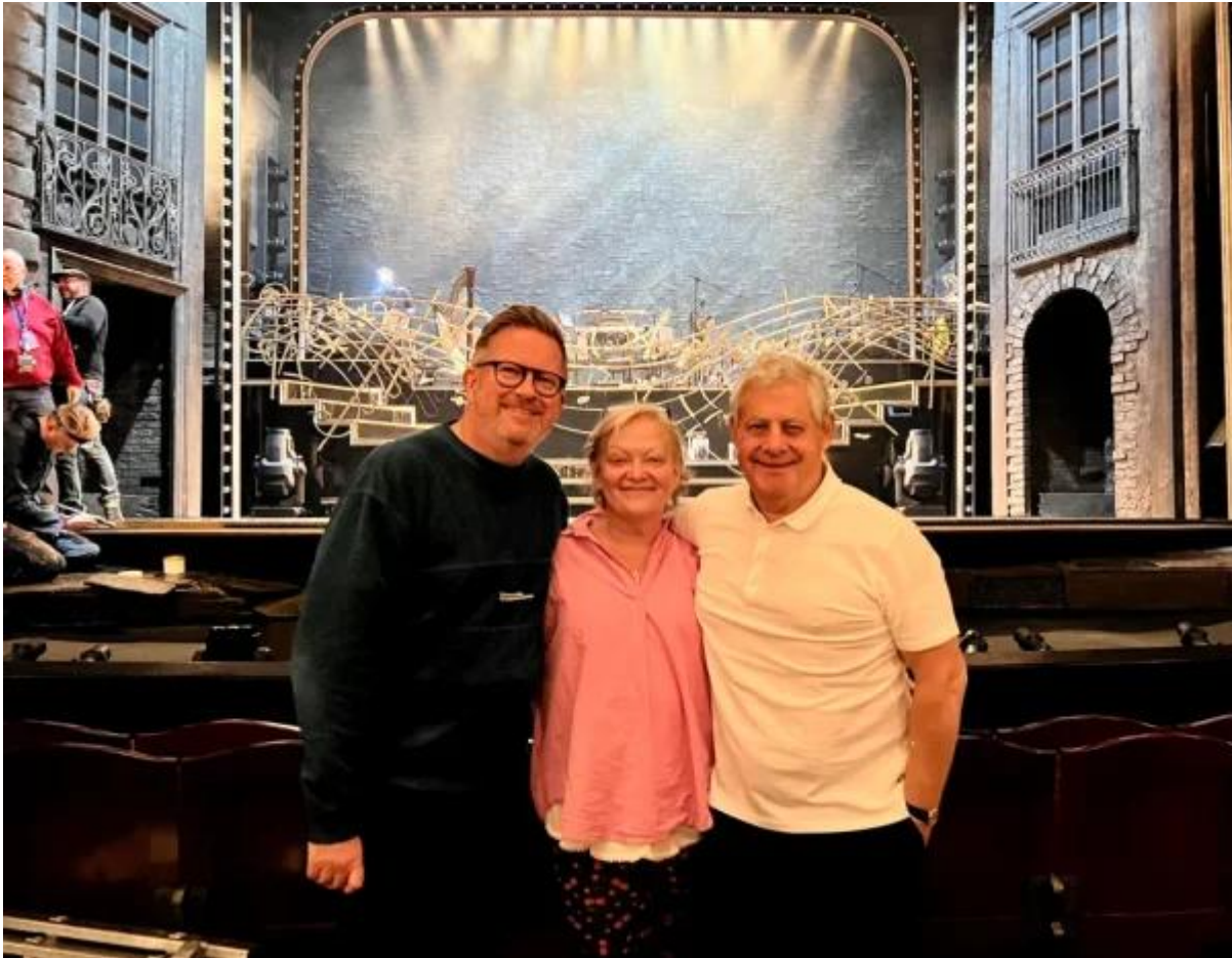
Matthew Bourne, Julia McKenzie and Cameron Mackintosh.