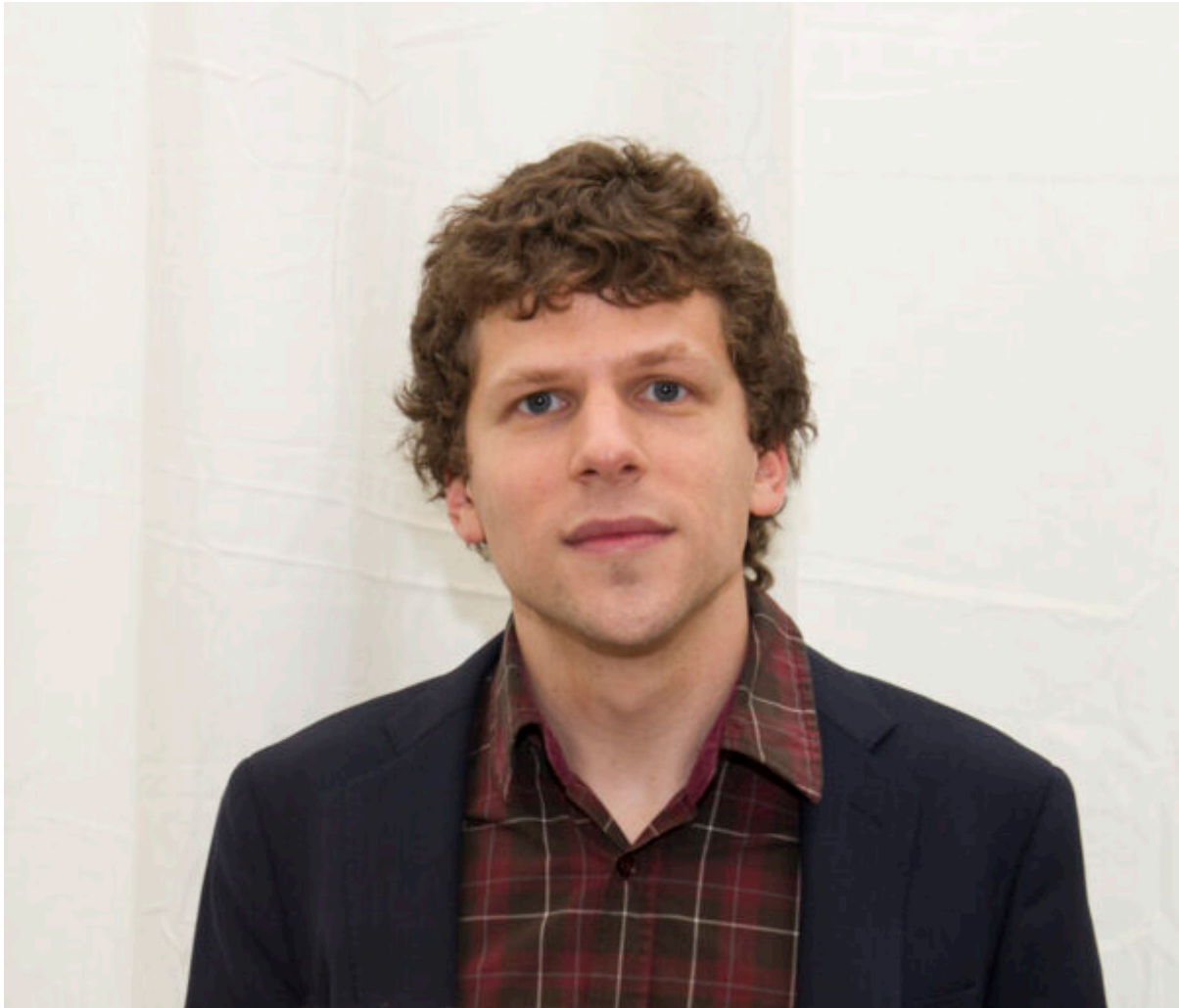
Jesse Eisenberg

As a journalist I met and interviewed Jesse Eisenberg in person several times during the past 20 years, and last October via Zoom at a press conference exclusive for Golden Globe international voters about A Real Pain , a movie that he wrote and directed, co-starring with Kieran Culkin .