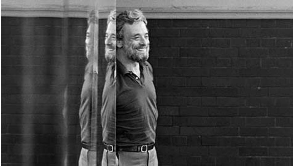
Stephen Sondheim.