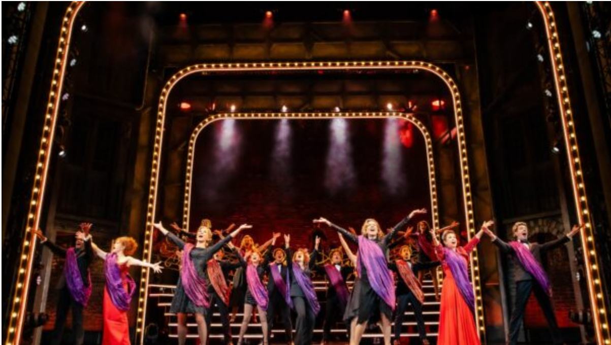
The company of Stephen Sondheim's Old Friends.