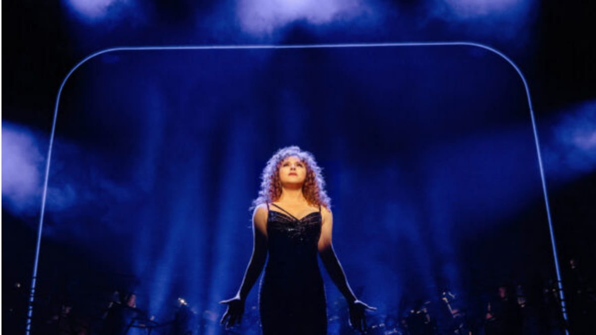
Bernadette Peters in Stephen Sondheim's Old Friends.