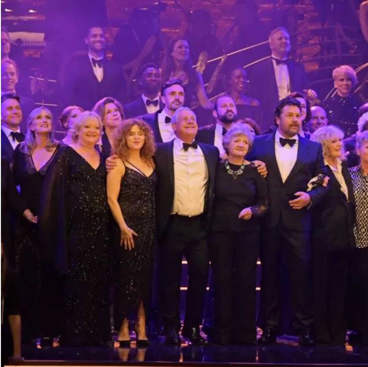
Gala cast of Stephen Sondheim's Old Friends

Haskins: How did the one-night gala turn into a show with an extended run?