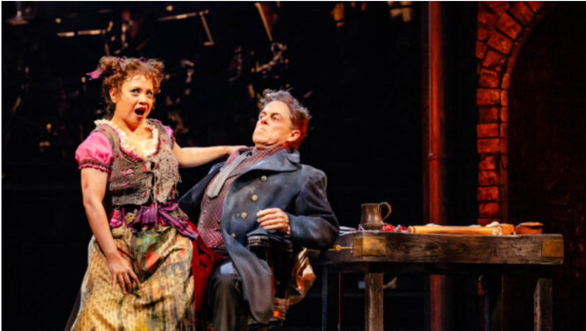
Lea Salonga and Jeremy Secomb in Stephen Sondheim's Old Friends.