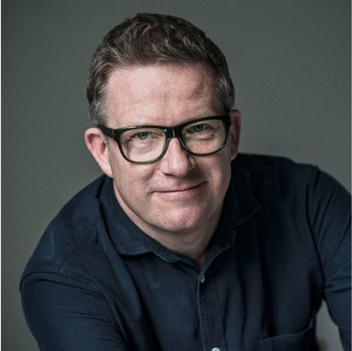
Matthew Bourne.