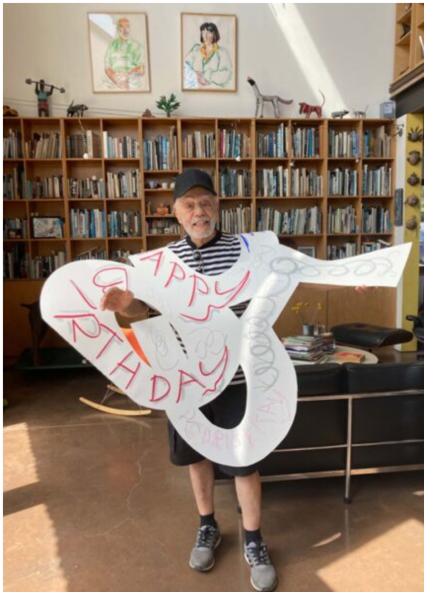
Ave Pildas (c) Elisa Leonelli 2024