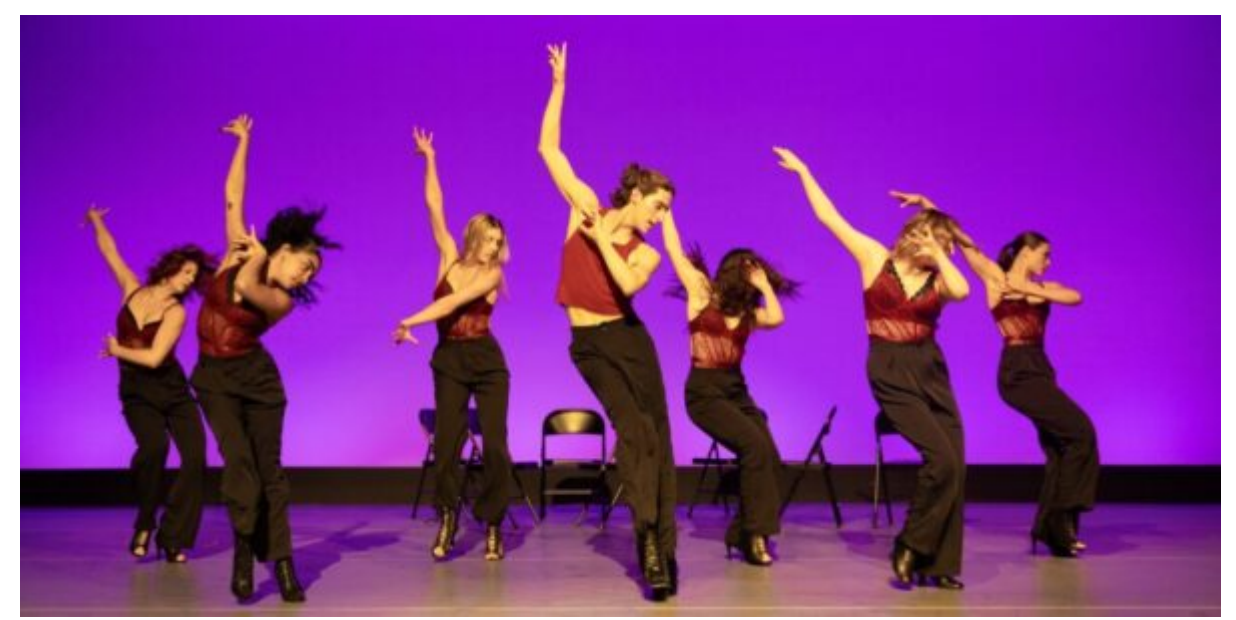
LA Jazz Dance Company.