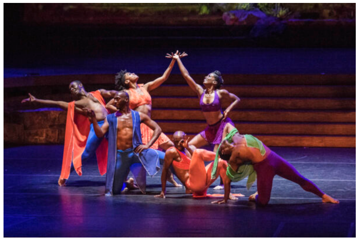
Lula Washington Dance Theatre. Photo courtesy of the artists