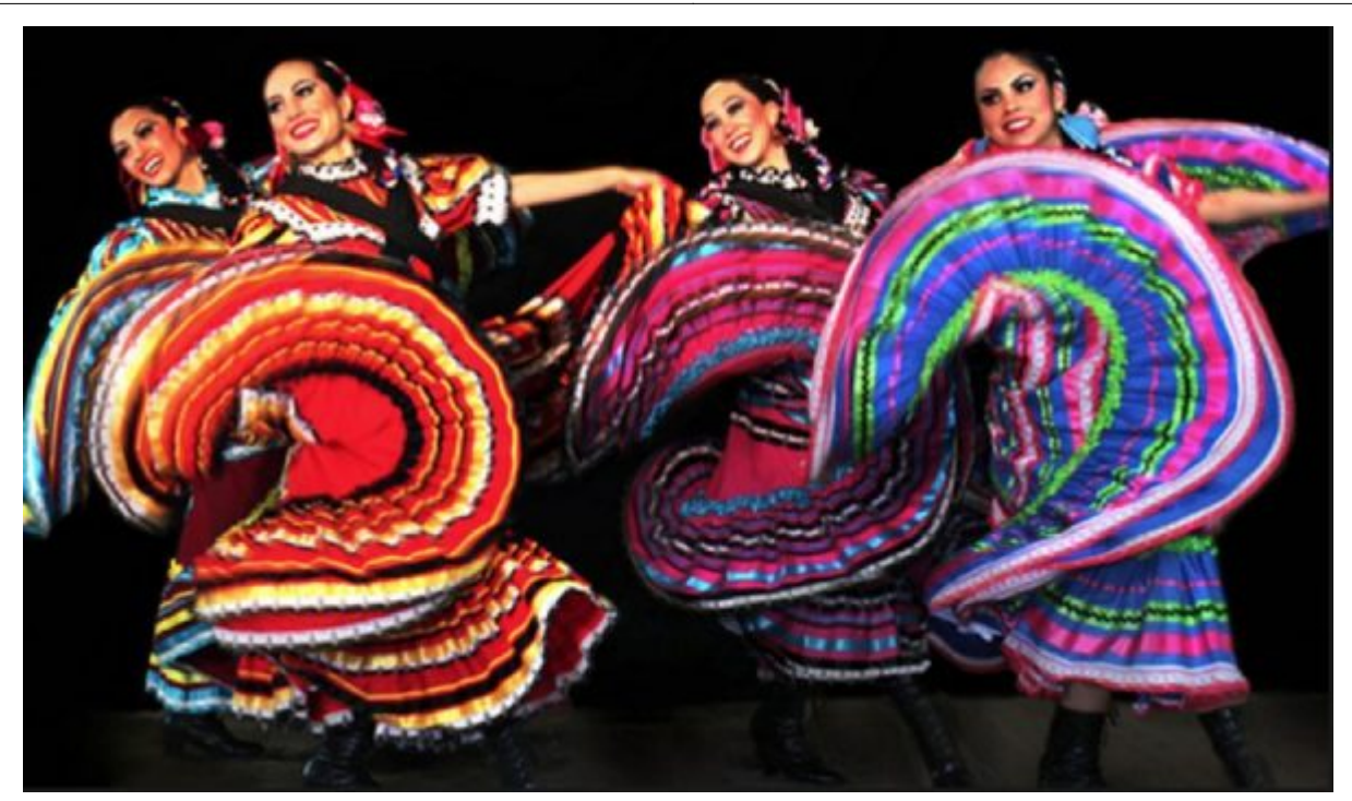
Ballet Folklorico Ollín.

San Pedro ? Festival of the Arts 2022 – A Dance Only Event at Peck Park (Next to Community Center), 560 N. Western Ave., San Pedro; Sat., Sept. 24, 1-4:15 pm, free. San Pedro Festival of the Arts.