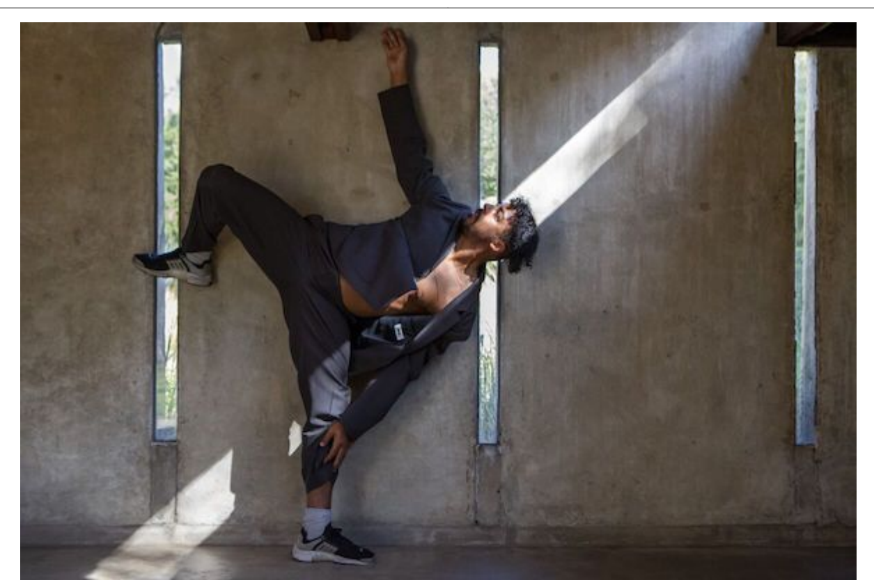
Chris Emile.