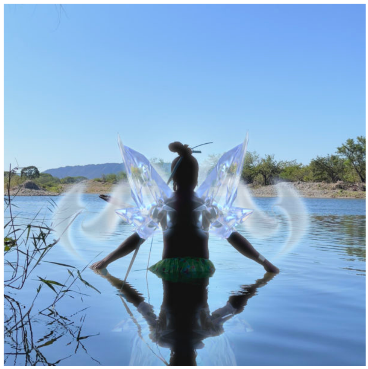
MUXX Project.