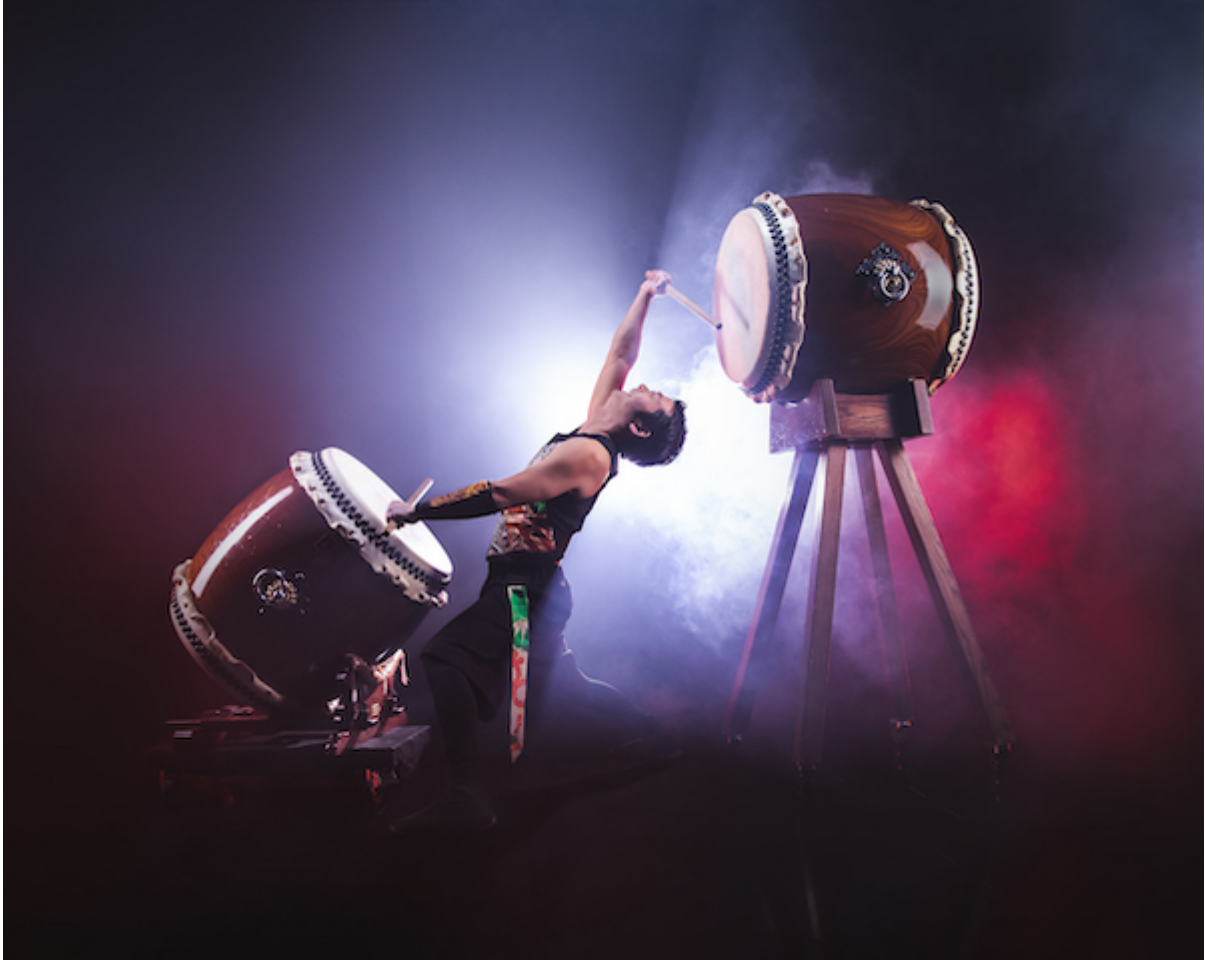
TAIKOPROJECT. Photo courtesy of the artist