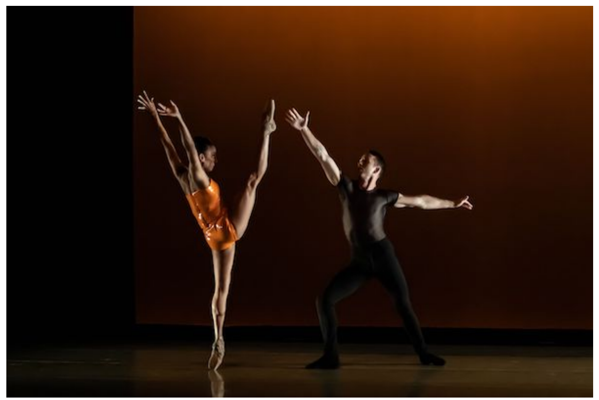
Cincinnati Ballet.