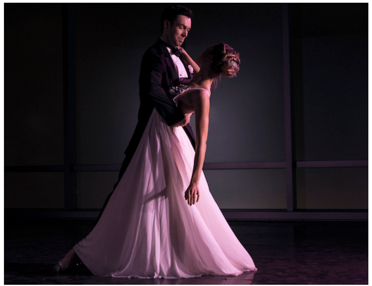
American Contemporary Ballet.