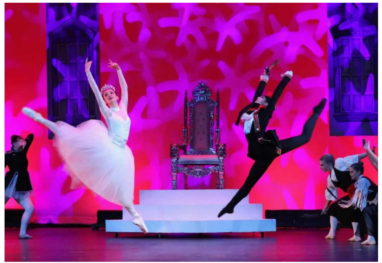
Redondo Beach Ballet.