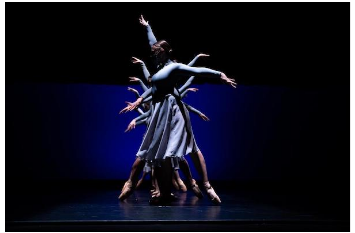
UCI Dance.