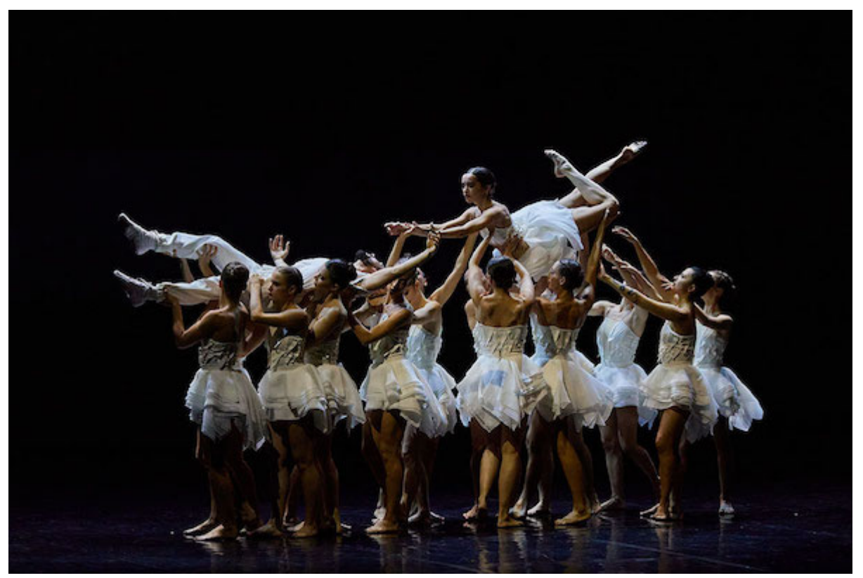
Ballet Preljocaj.

CalArts Dance – Coded: Art Enters the Computer Age, 1952–1982. LA County Museum of Art, BCam Level 2, 5905 Wilshire Blvd., mid-Wilshire; Sat., Feb. 25, 7:30 pm, $25. Event Info.