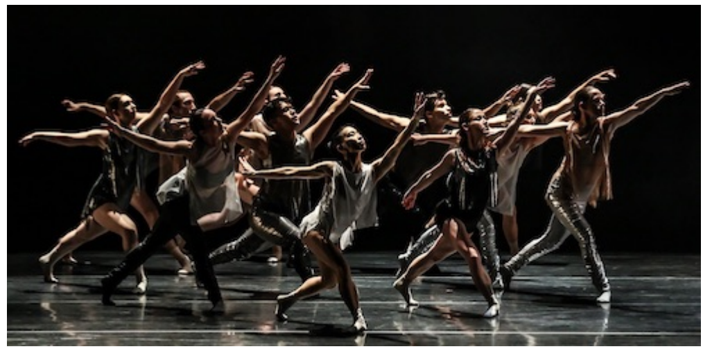
Backhausdance.

Backhausdance at Martha B. Knoebel Dance Theater, Cal State University Long Beach, 6200 Atherton St., Long Beach; Sat., Feb. 25, 8 pm, $45-$65, $25 students. Backhausdance.