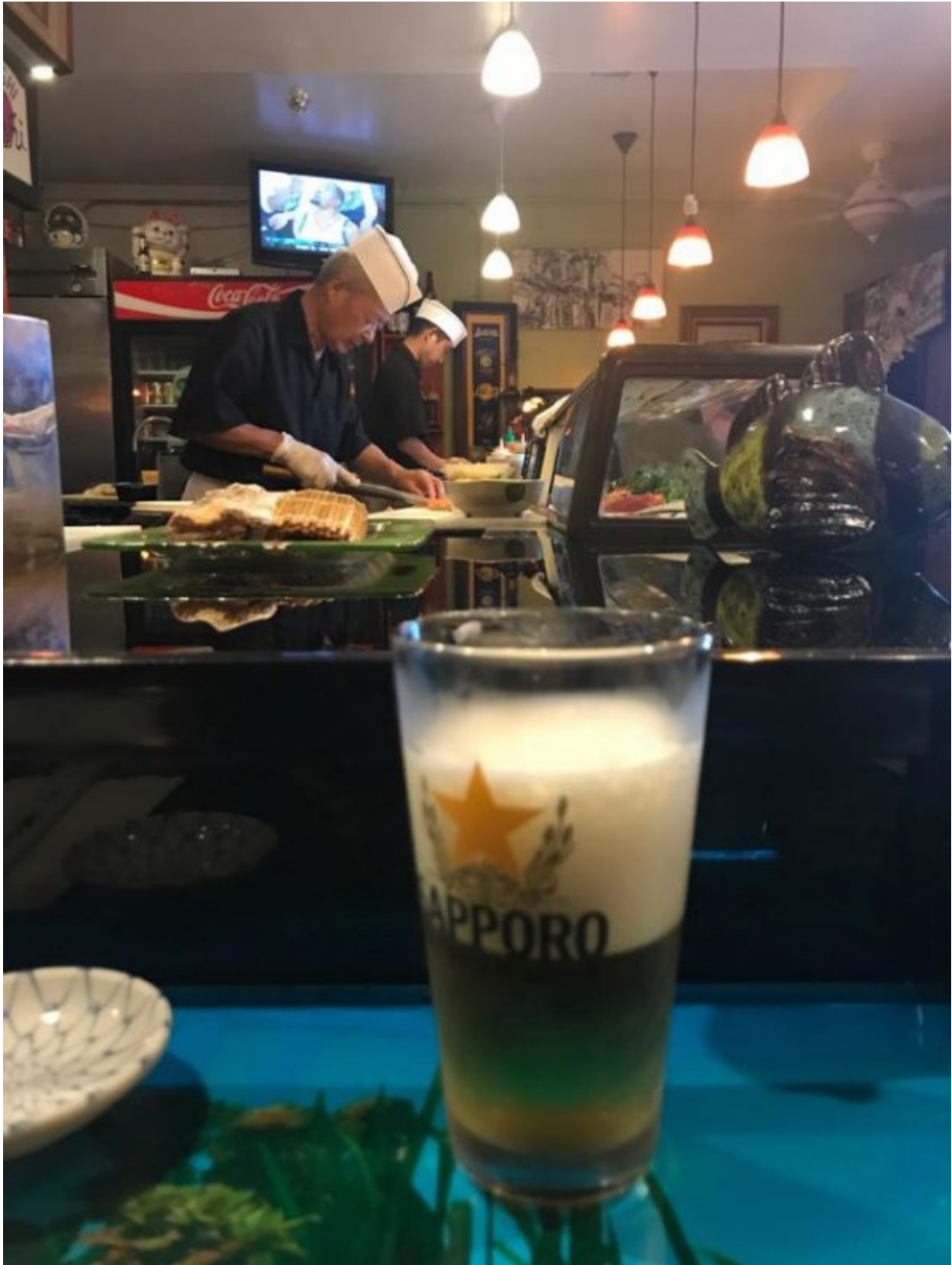
Sushi At Senfuku