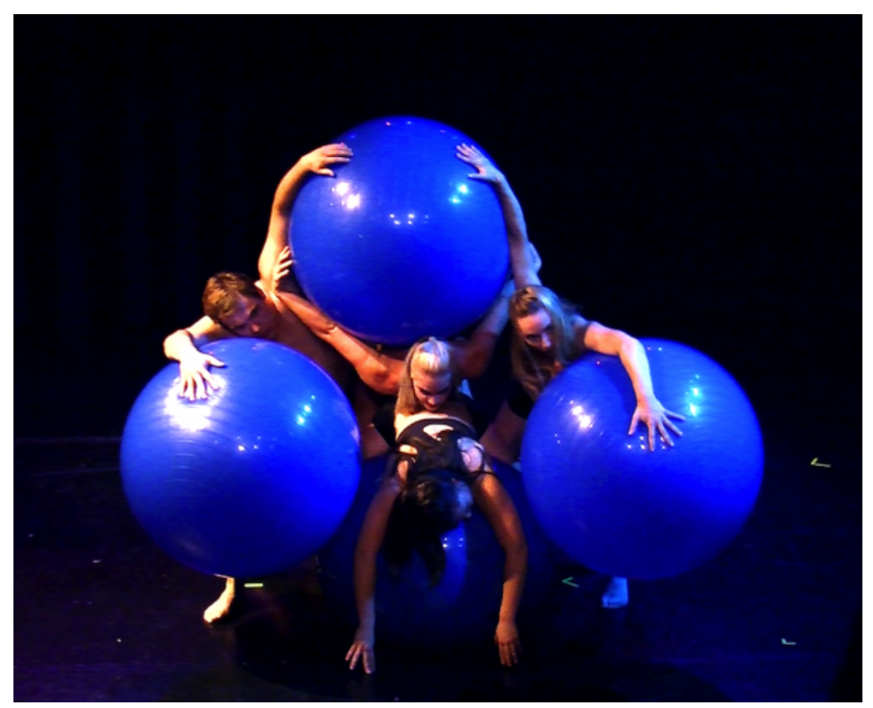
Max 10.