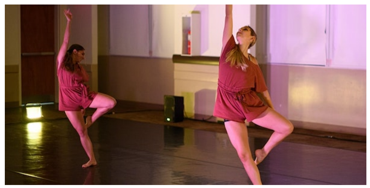
Loyola Marymount University Dance Department.

Dancers from the contemporary company Lineage Dance join actors in Curiosity Tales , a family-friendly retelling of familiar storybook characters and their adventures. At Lineage, 920 E. Mountain St., Glendale; Sat., Feb. 6 & 13, March 6 & 13, 4 p.m., $40, $20 students & seniors. Info, tickets, & Covid protocols at Lineage Dance.