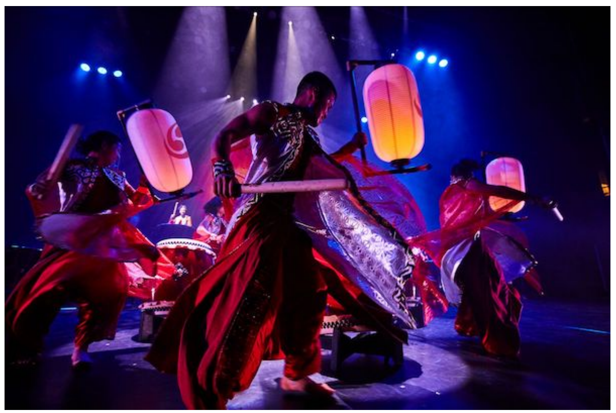
Yamato-the Drummers of Japan.

Flamenco is on the menu with Esencia Flamenco Dance Company at Warner Grand Theatre, 478 W. 6th St., San Pedro; Sun., Feb. 6, 2pm, $25-$50. Info, tickets, & Covid protocols at Grand Vision Foundation.