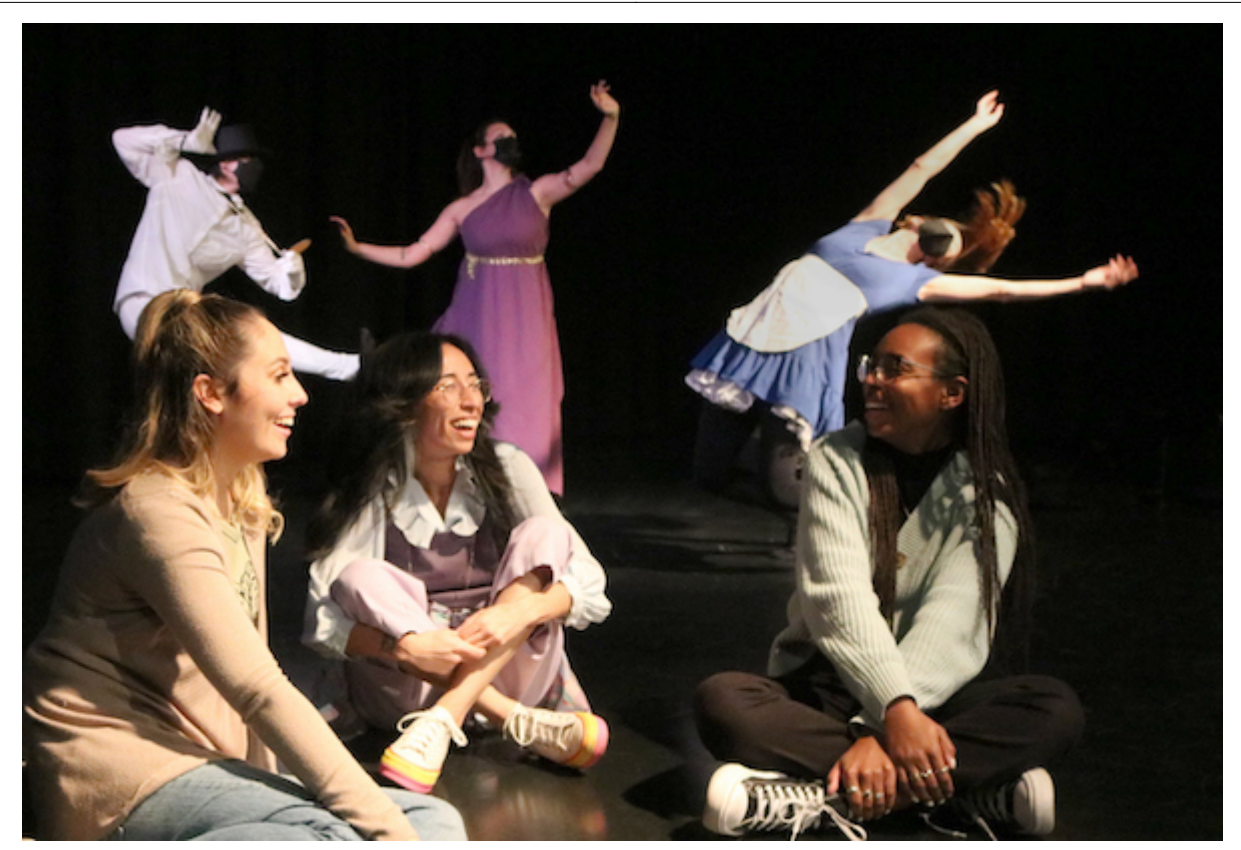
Lineage Dance's "Curiosity Tales."