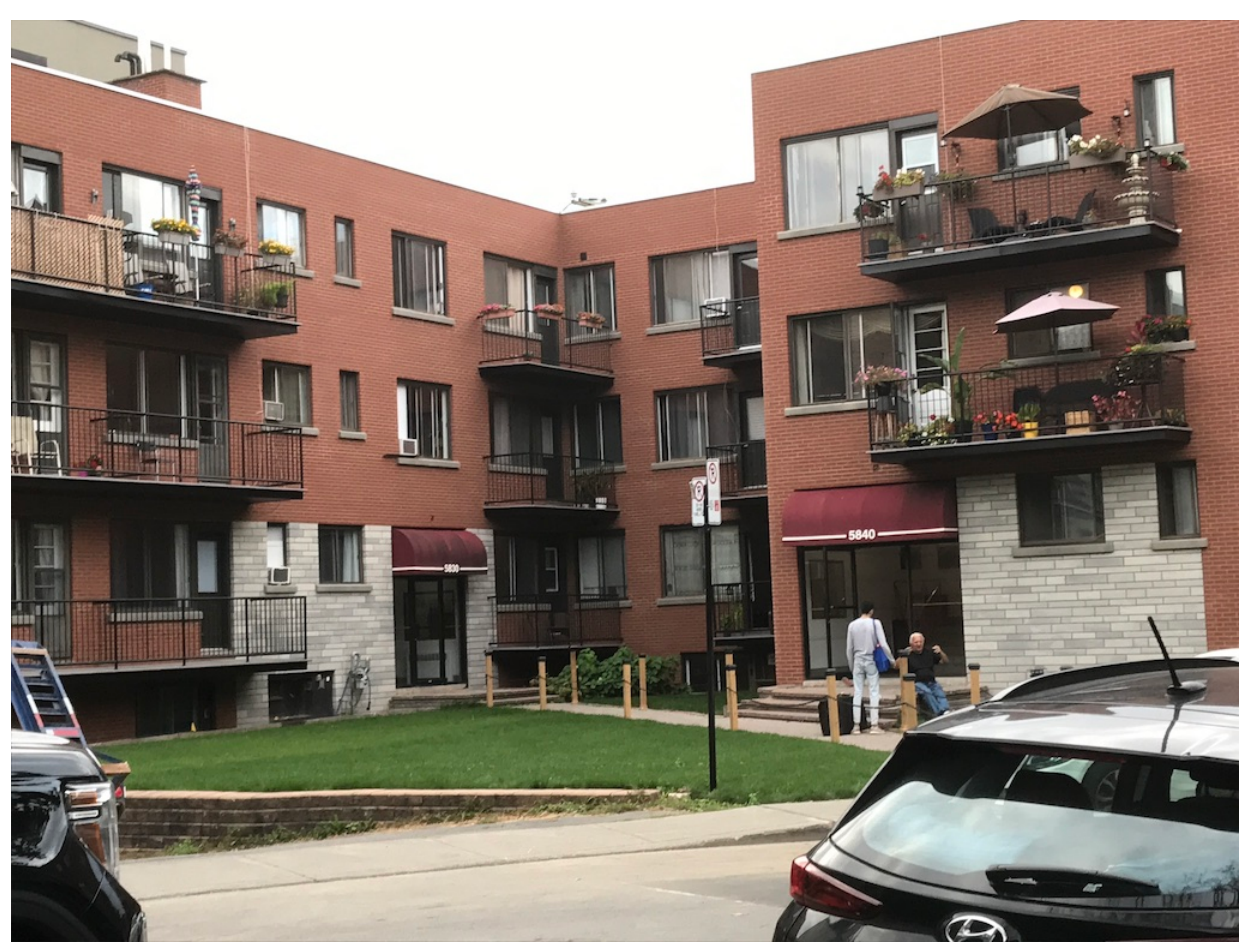
Most complete entryway treatment involving façade and front yard treatment elements