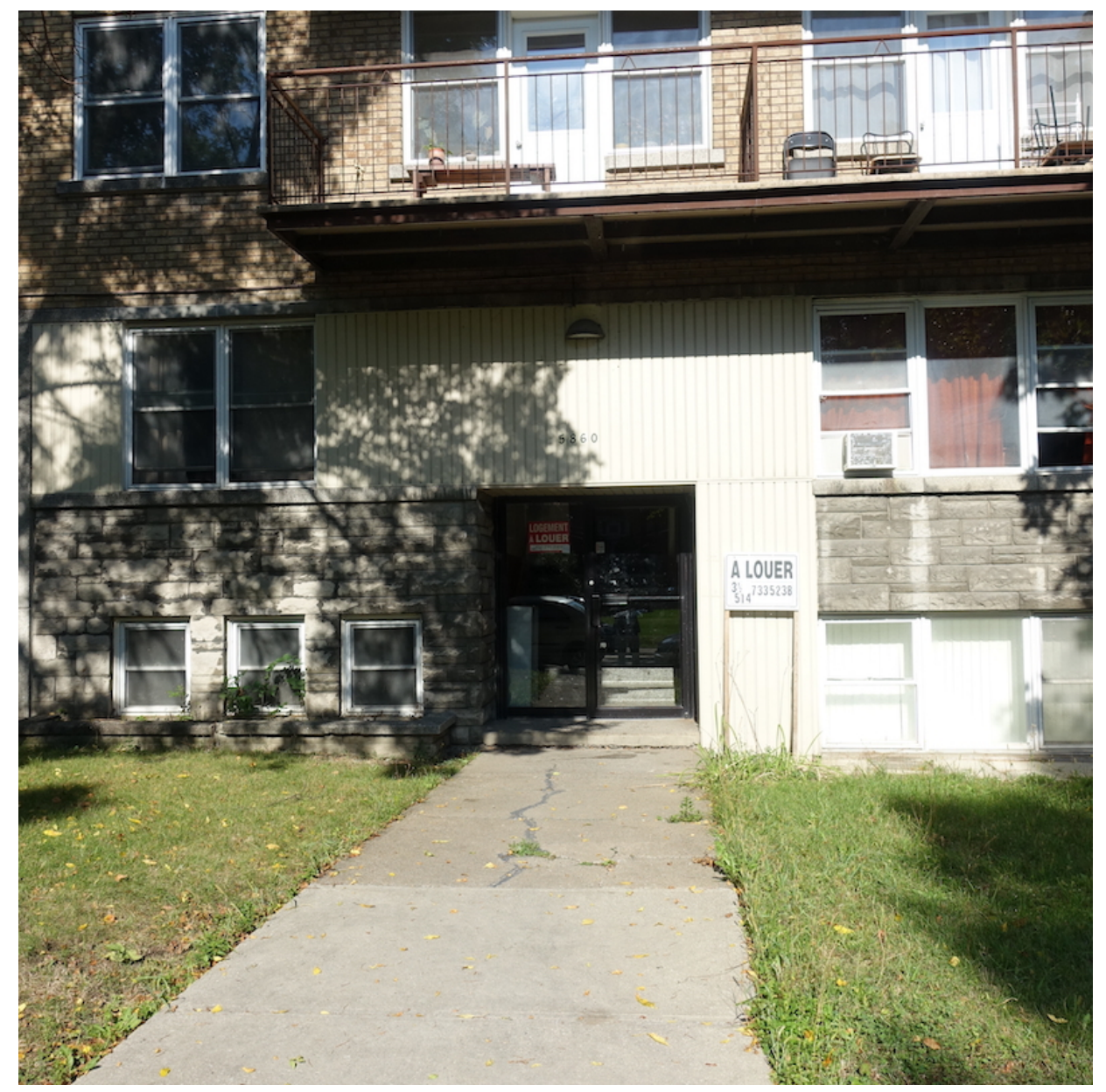
Minimum treatment of entryway as marker of location on building and in the city

The façade bound decorated scheme whereby the entryway is not only framed with a reminder of a classic frontal colonnade, but is also located atop a series of steps which, with handrail, night lights and creeping ivy, clearly identify THE entry doorway.