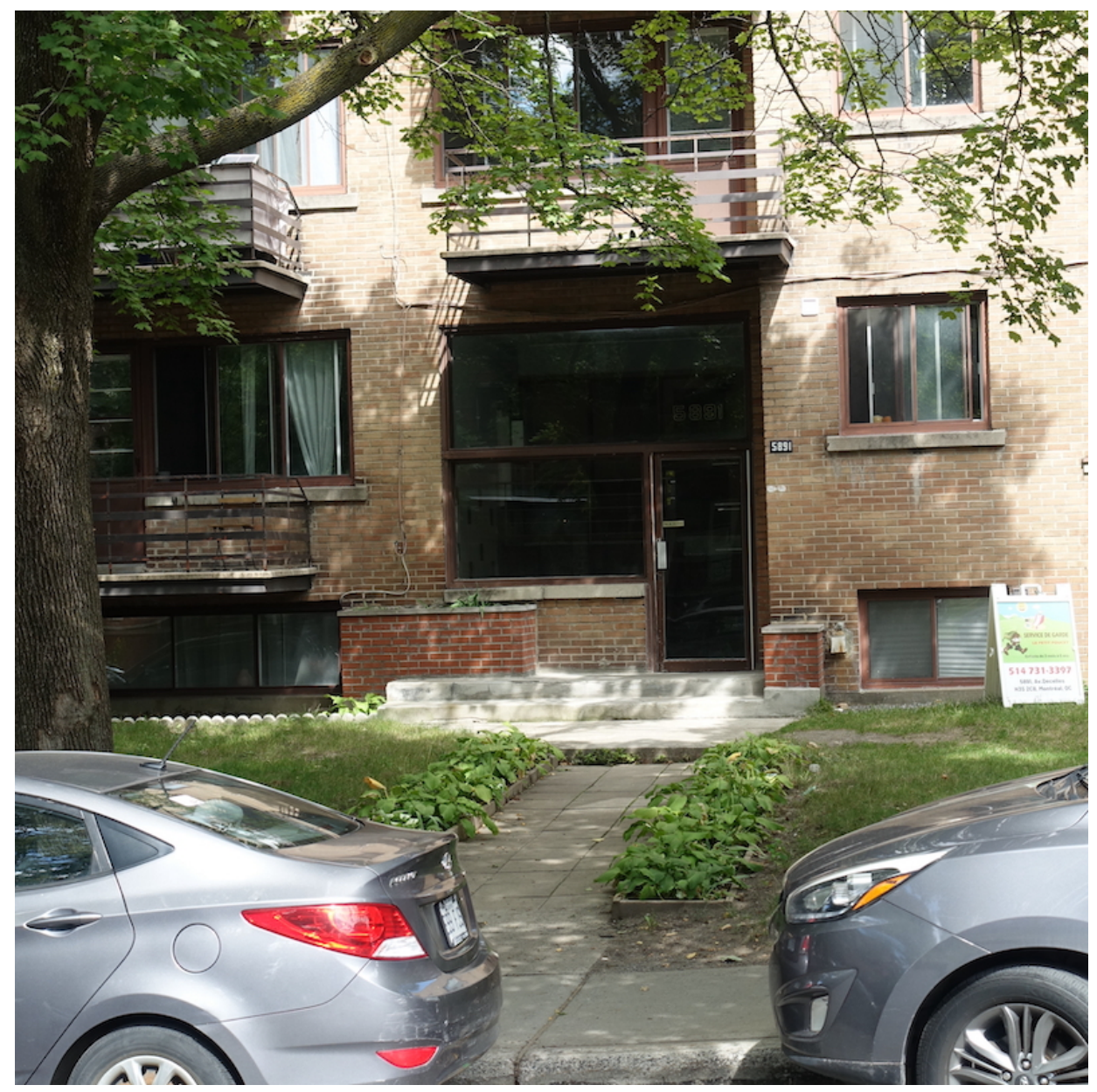
Improved entryway treatment with extended landing and landscape elements

The façade bound scheme with a projecting cylindrical awning, whereby the sides of the entryway are treated with concrete block finish, helping one to locate it at a distance.