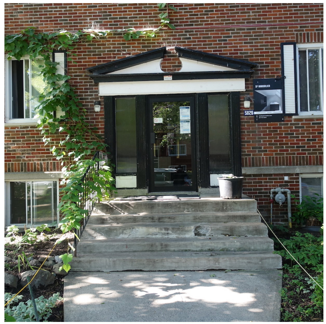
Improved entryway treatment with decorative elements, raised landing and landscape elements

The improved façade bound scheme with transition providing extension, whereby the entryway, is made noticeable by the addition of projecting planters delimiting two small landings two steps apart extending to the sidewalk with a noticeable landscaped walkway.