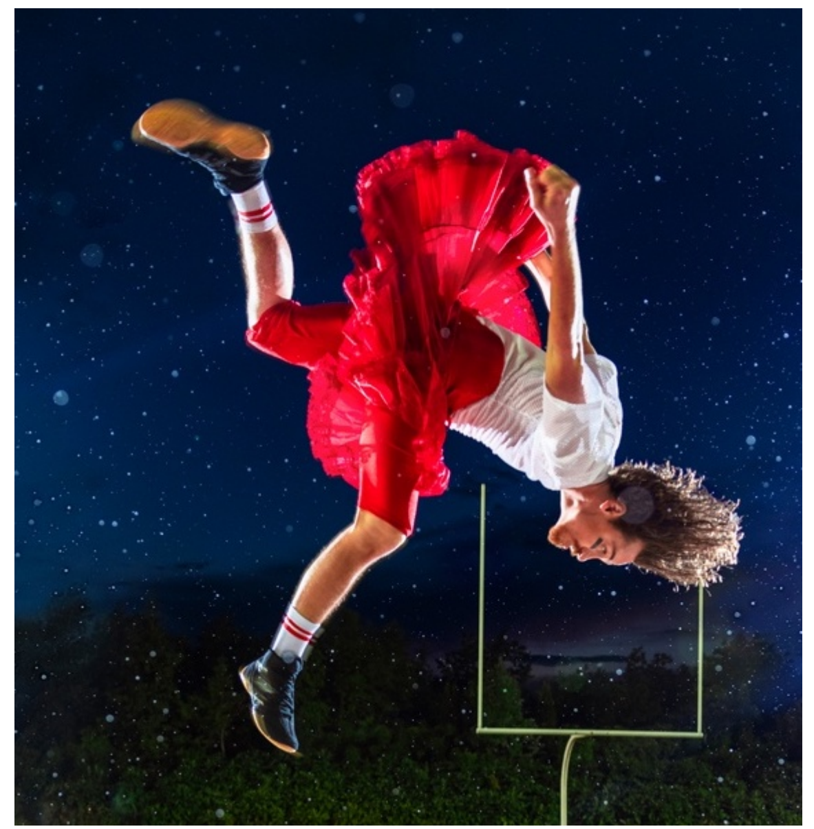
Cirque FLIP Fabrique