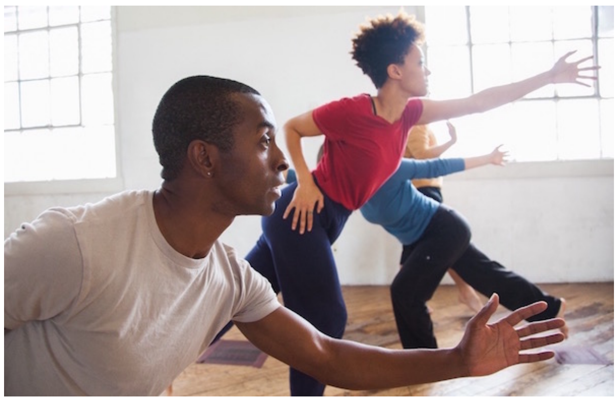
Suarez Dance Theater.

American Contemporary Ballet — Astaire Dances . At ACB Studios, Two California Plaza, 350 S. Grand Ave., 28<sup>th</sup> Flr., downtown; Fri., Feb 10, 17 & 24 8pm, Sat., Feb. 11, 18 & 25, 5 & 8 pm, Sun.,12, 19 & 26, 2 & 5pm, Tues., Feb. 14, 8 pm, $60-$130. American Contemporary Ballet.