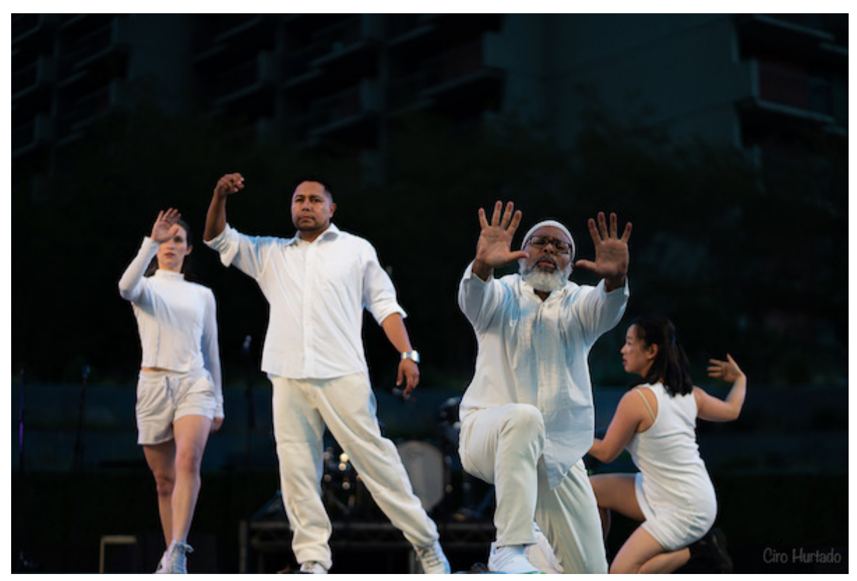
DATA or 7 ways to dance a dance through prison walls.