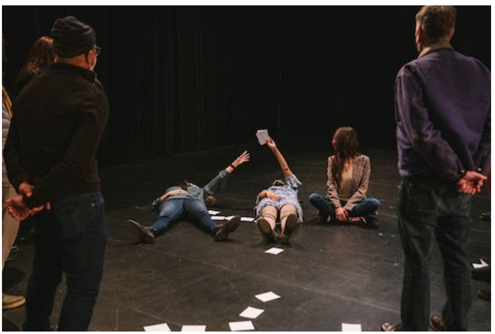
600 Highwaymen.

Highwaymen bring the final two weekends of immersive performance under the distinctively unwieldy title A Thousand Ways (Part Three): An Assembly. Described as experimental theater creations, each roughly one hour event draws on elements of dance, performance, and civic engagement as each audience of 16 people read from assigned cards before being drawn in further, becoming part of each singular performance. UCLA Royce Hall Rehearsal Room, Royce Hall, Sat.-Sun., Feb. 4-5 & 11-12, noon, 1:30, 3pm, 4:30, 6 & 7:30pm. $29.97. CAP UCLA.