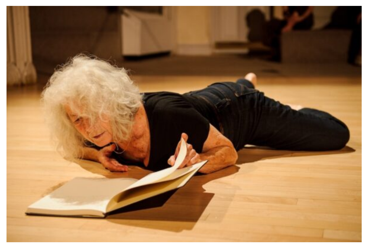
Simone Forti.