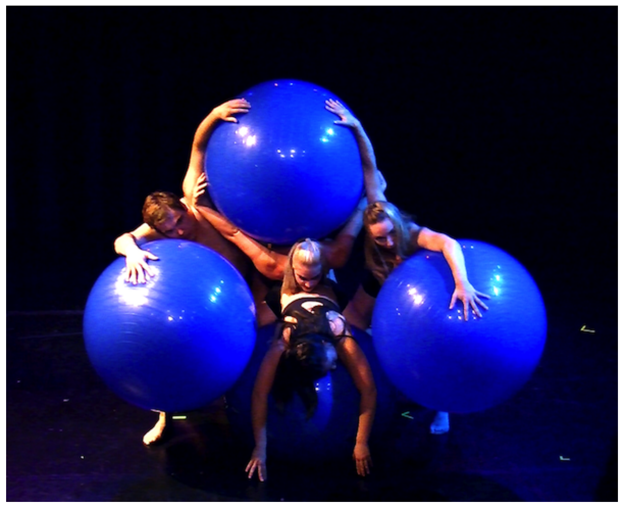
Max 10.