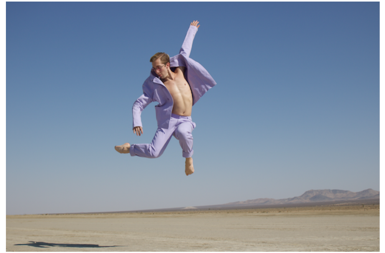
FUSE Dance. Photo courtesy of the artist