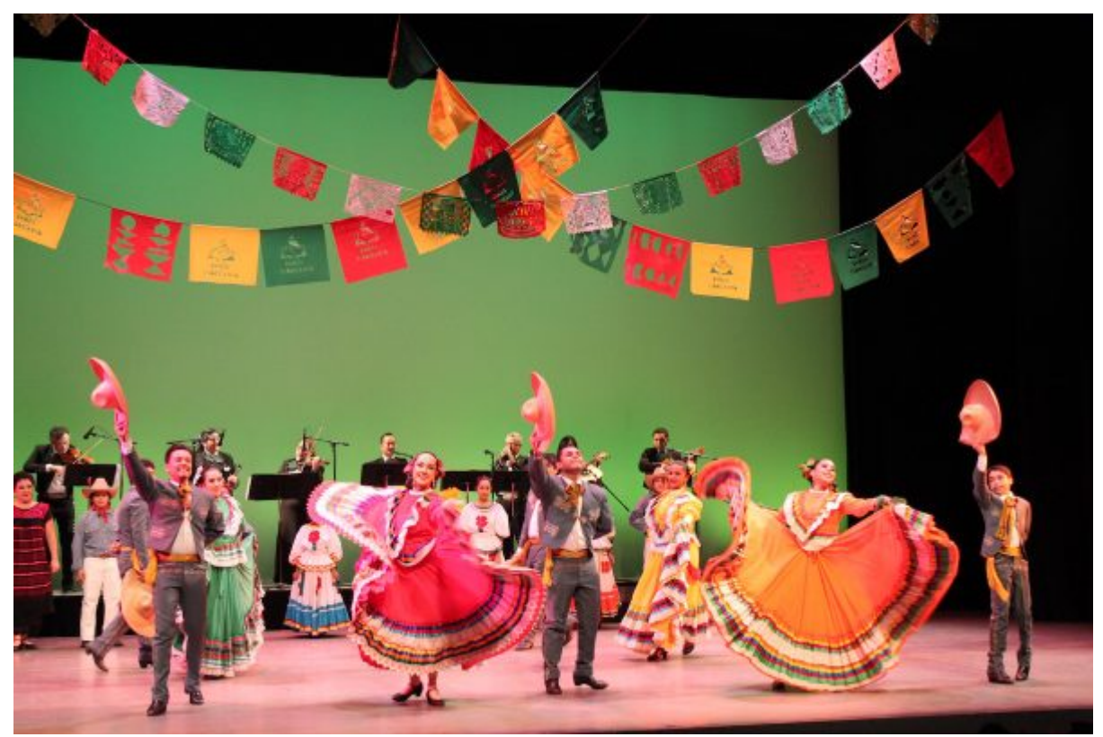
Danza Floricanto/USA's "5 de Mayo".