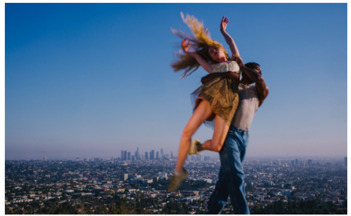
LA Dance Project in "Romeo & Juliet."