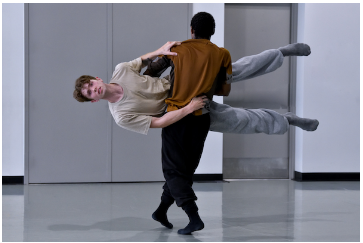
Ballet BC.