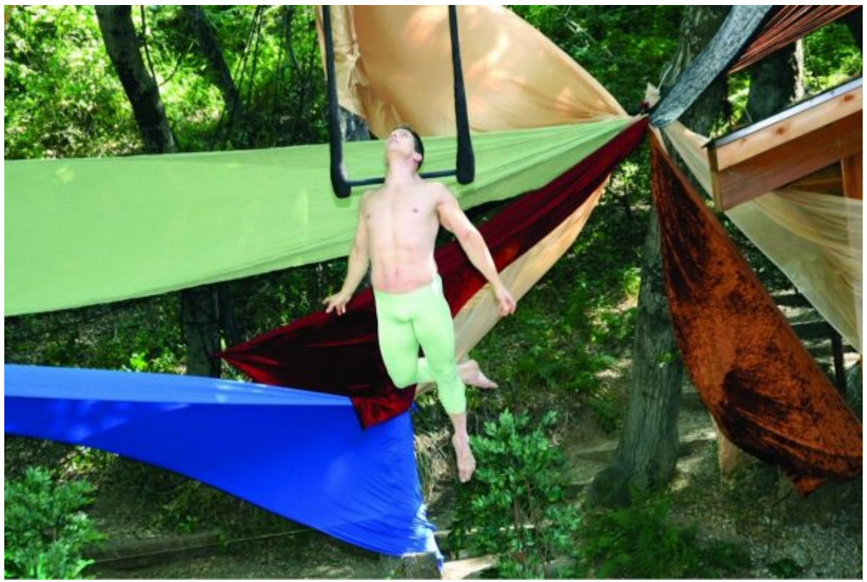
MOMentum Place

LA Unbound at AGBU Performing Arts Center, 2495 E Mountain St., Pasadena; Sat., May 13, 1:30 pm, $22-$32 AGBU.