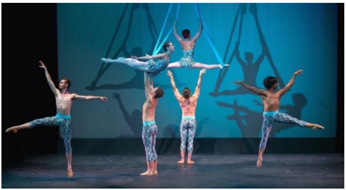
Luminario Ballet.