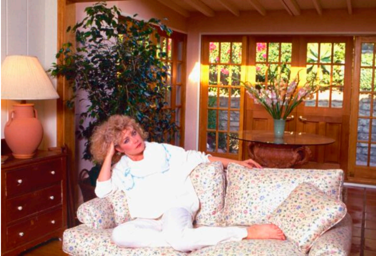
Cassie Yates

The actress mentioned some of her other movies and costars: “I did F. I .S.T. by Norman Jewison with Sylvester Stallone. My latest film was Unfaithfully Yours with Dudley Moore and Nastassja Kinski. Dudley is such a pleasure to work with, he constantly keeps it cool and going, in between set-ups and lighting there are touchy waiting periods and he would always entertain us either on the piano or making sure the morale was high and the humor was up, because it was a comedy.”