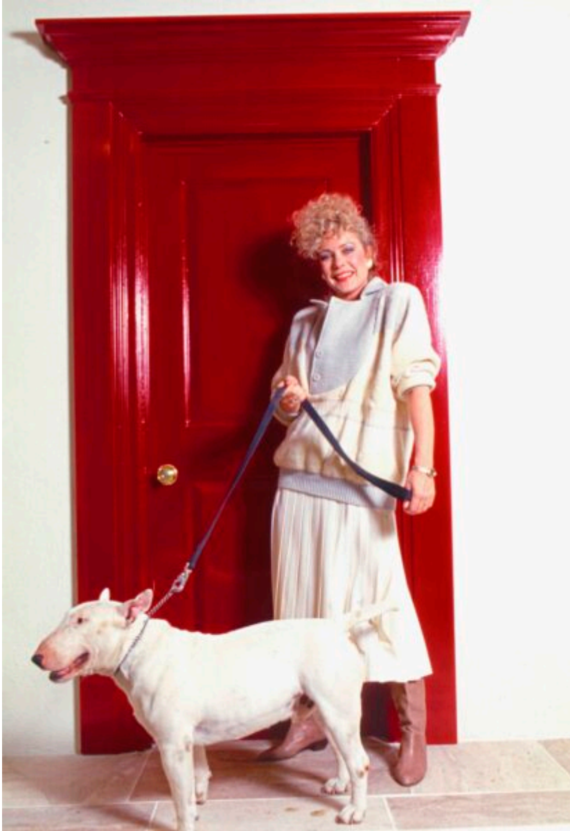
Cassie Yates