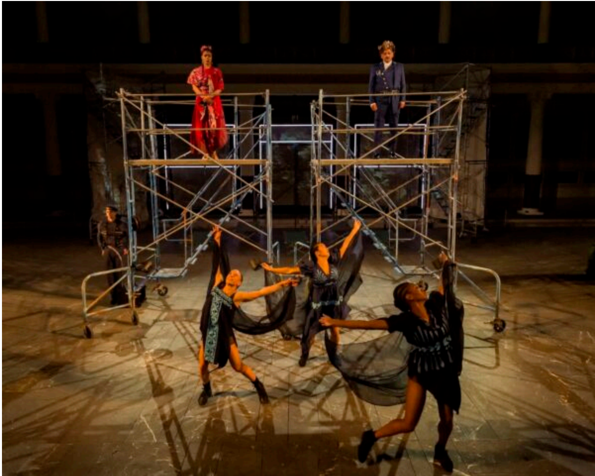
The cast of Classical Theatre of Harlem's "Memnon."

LADC: The Getty Theater is a very distinctive venue. What do you think now that you are rehearsing here?