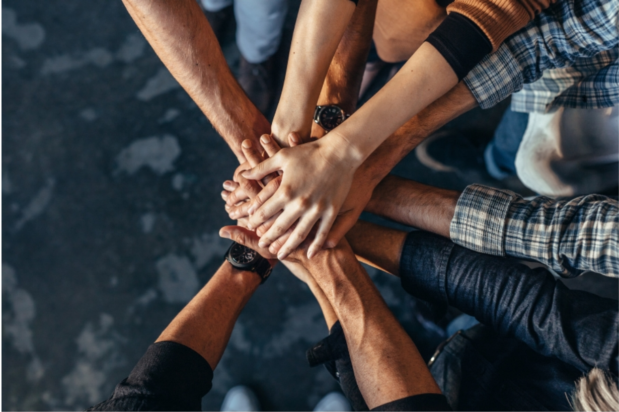
The bonds of teamwork.

Recovery from injury marks the commencement of a new chapter, where the individual must adapt to altered personal landscapes and reconstructed daily routines. Amidst these changes, a dependable support system becomes indispensable. Peers, family, and healthcare professionals merge to create a network that assists with practical needs and provides emotional sustenance.