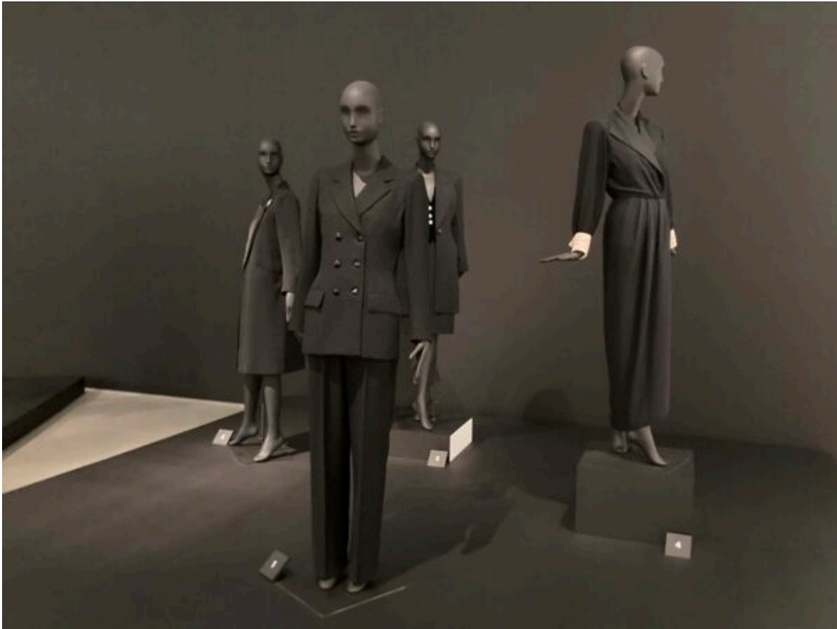
Yves Saint Laurent at OCMA. Costa Mesa, California. August 18, 2024

In Becoming Karl Lagerfeld , a French series starring Daniel Brühl as German fashion designer Lagerfeld, covering the years 1972 to 1983, Saint Laurent plays a prominent role, as the two rival designers share the love of one young gigolò, Jacques de Bascher. You may read about their love triangle in this TIME magazine article .