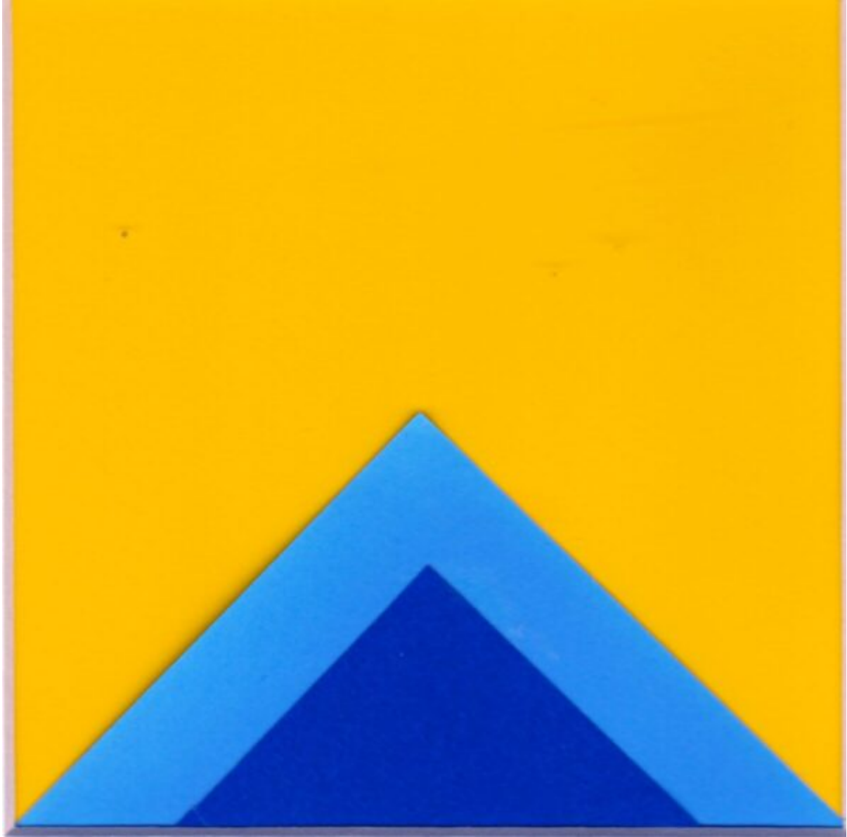
flag of peacefulness