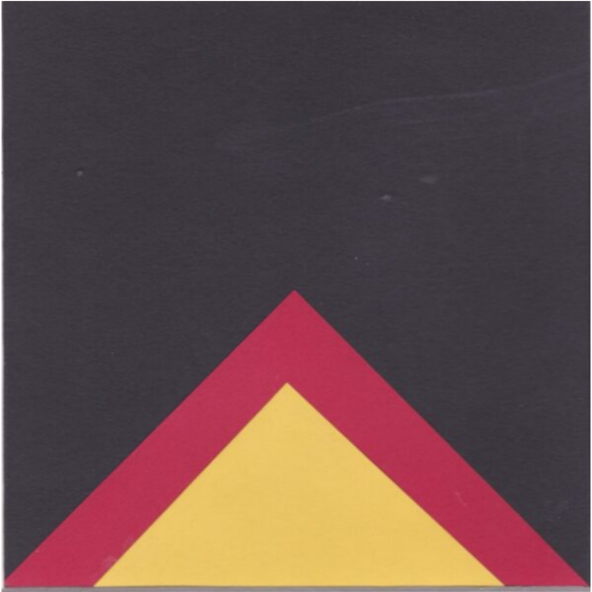
flag of warmongering