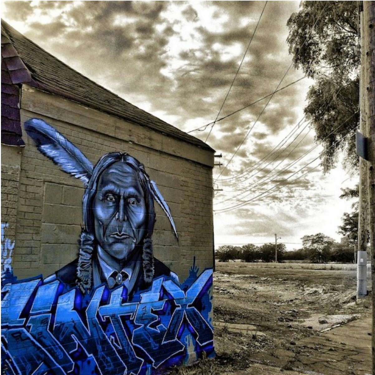
Street Art from Sintex