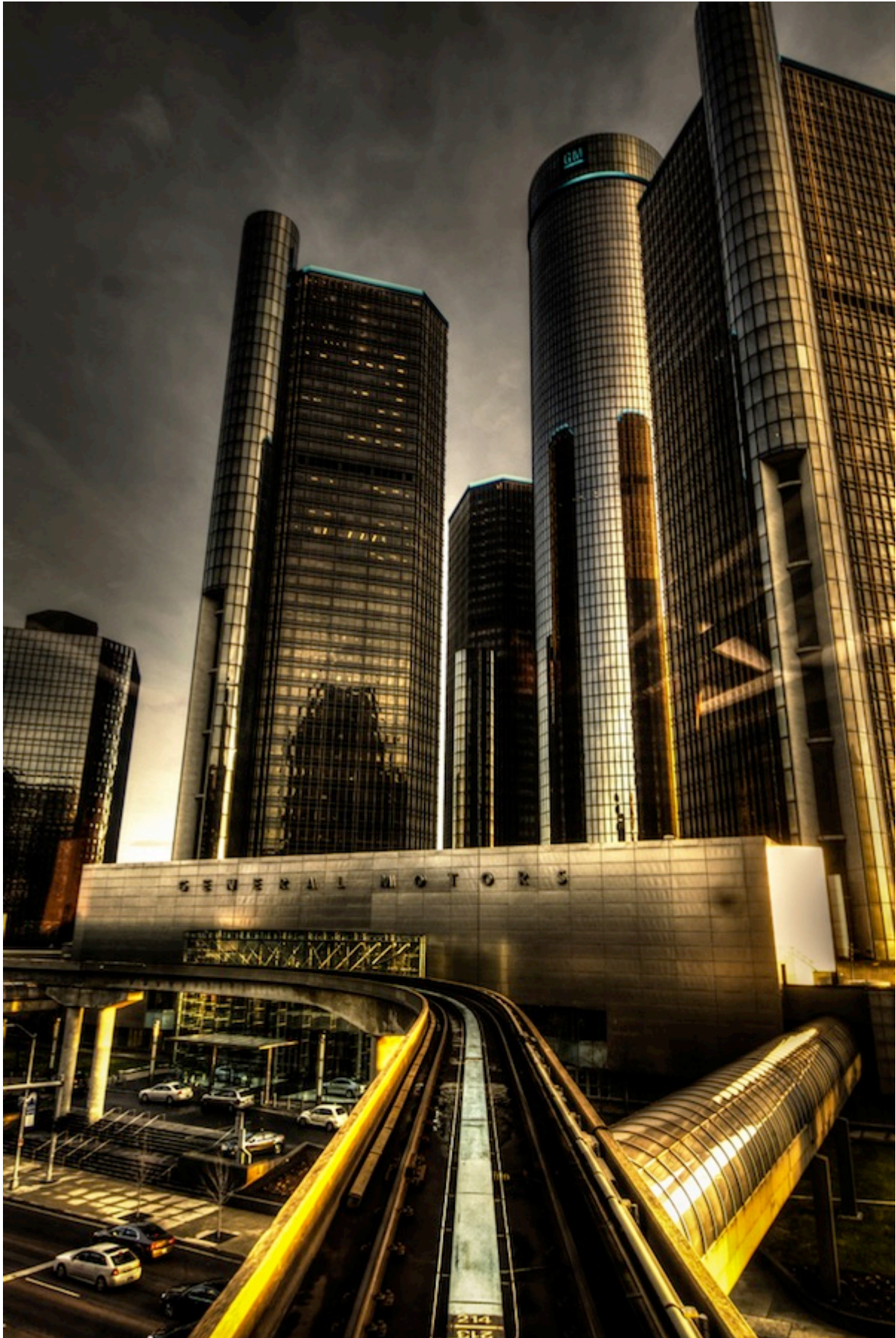
Renaissance Center in downtown Detroit