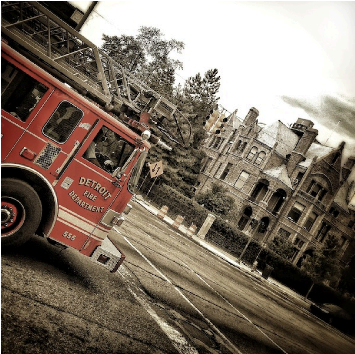
Engine 556 on the Move