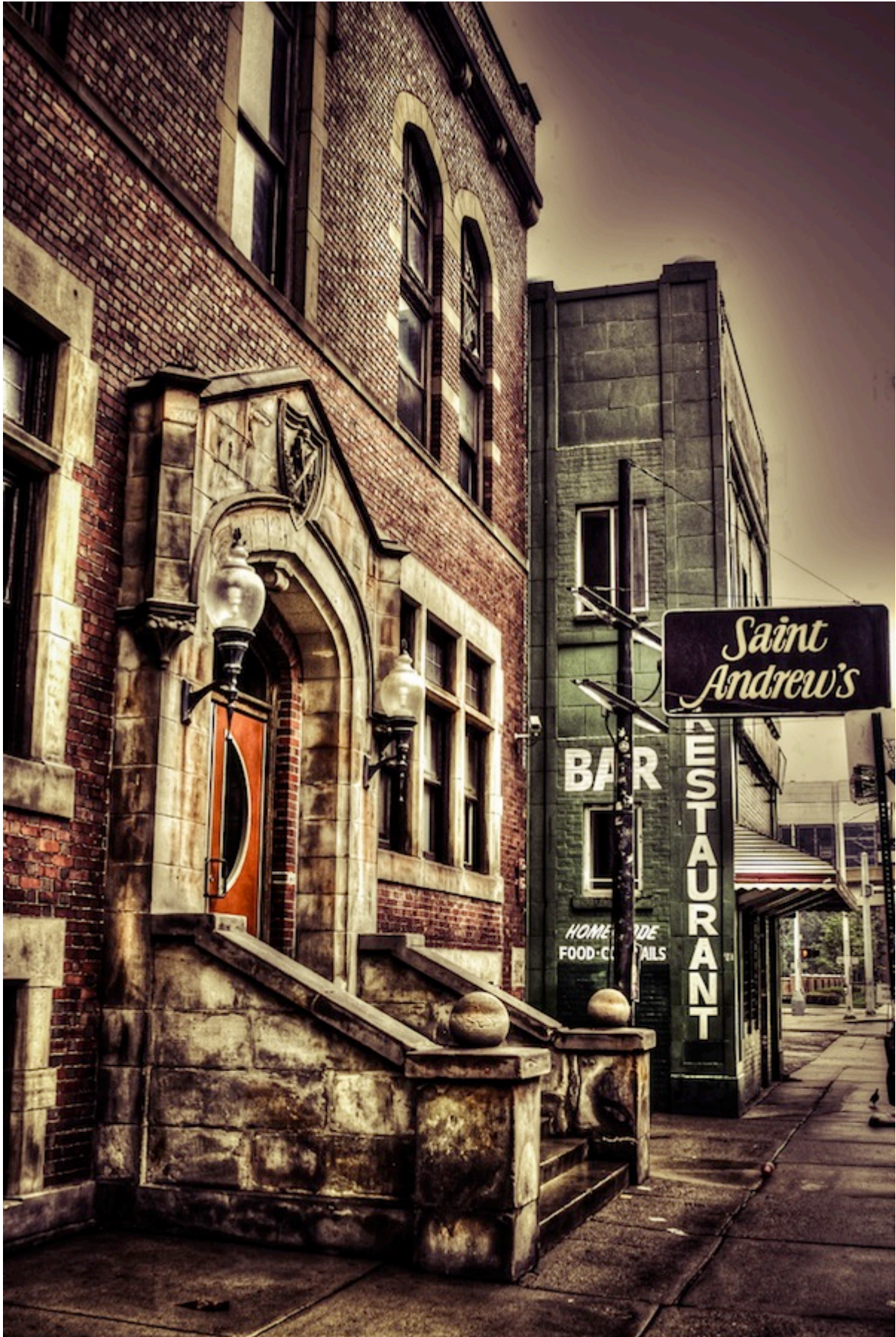
St. Andrews Hall