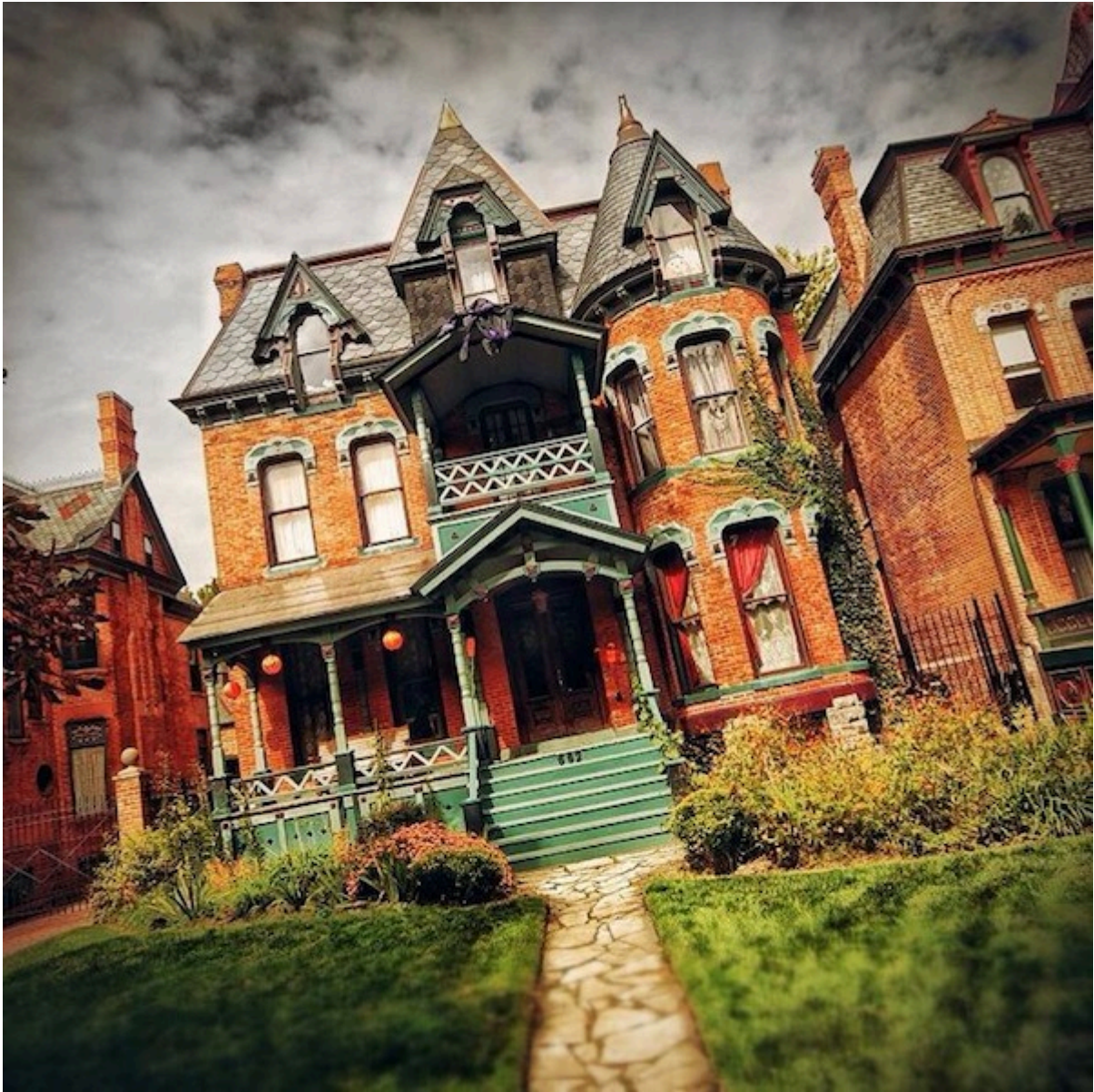
The Beauty of Preservation