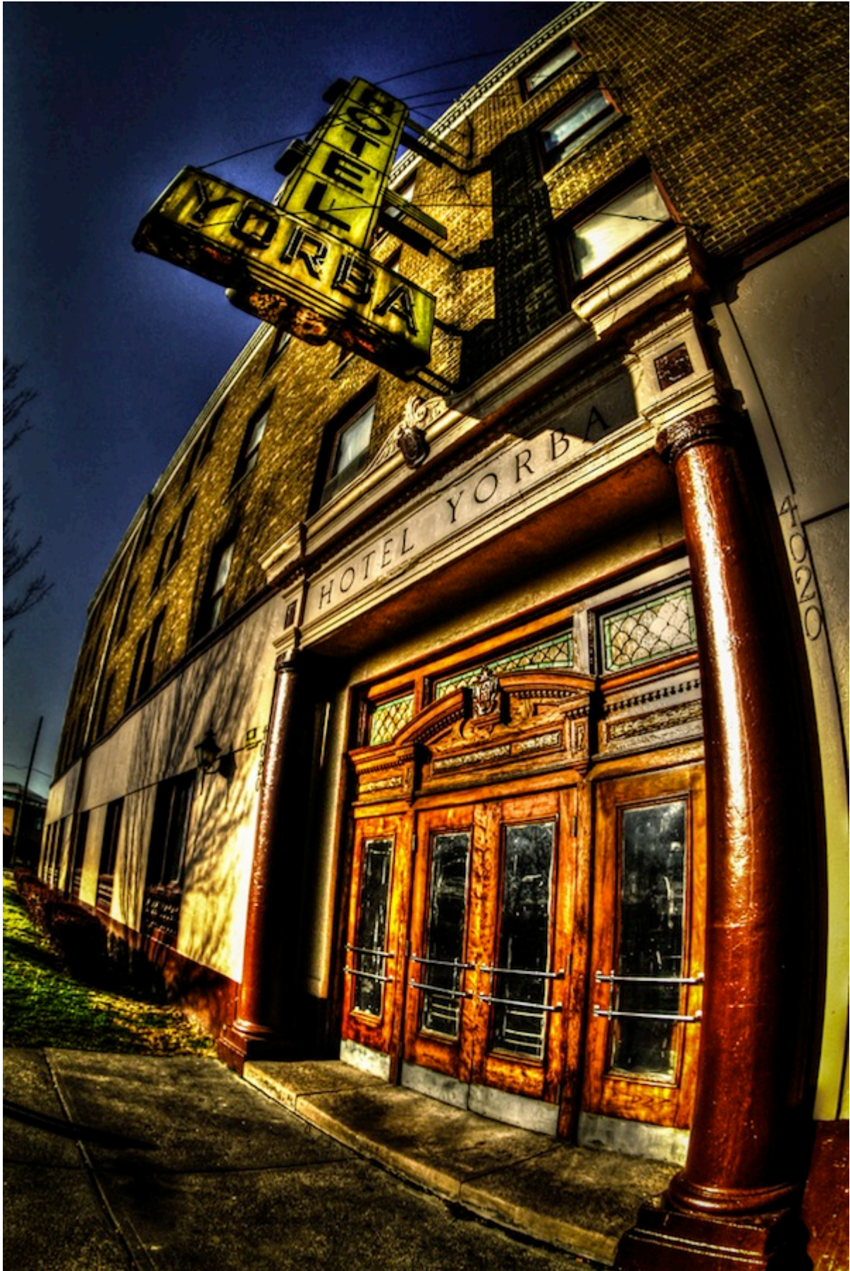
Hotel Yorba (from the infamous White Stripes song)