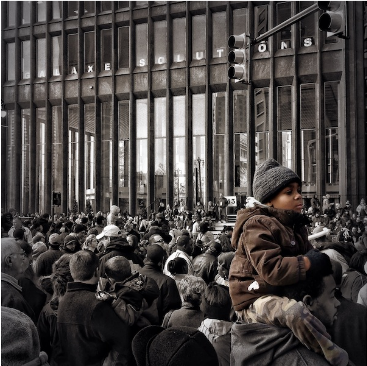
Watching the Thanksgiving Day Parade