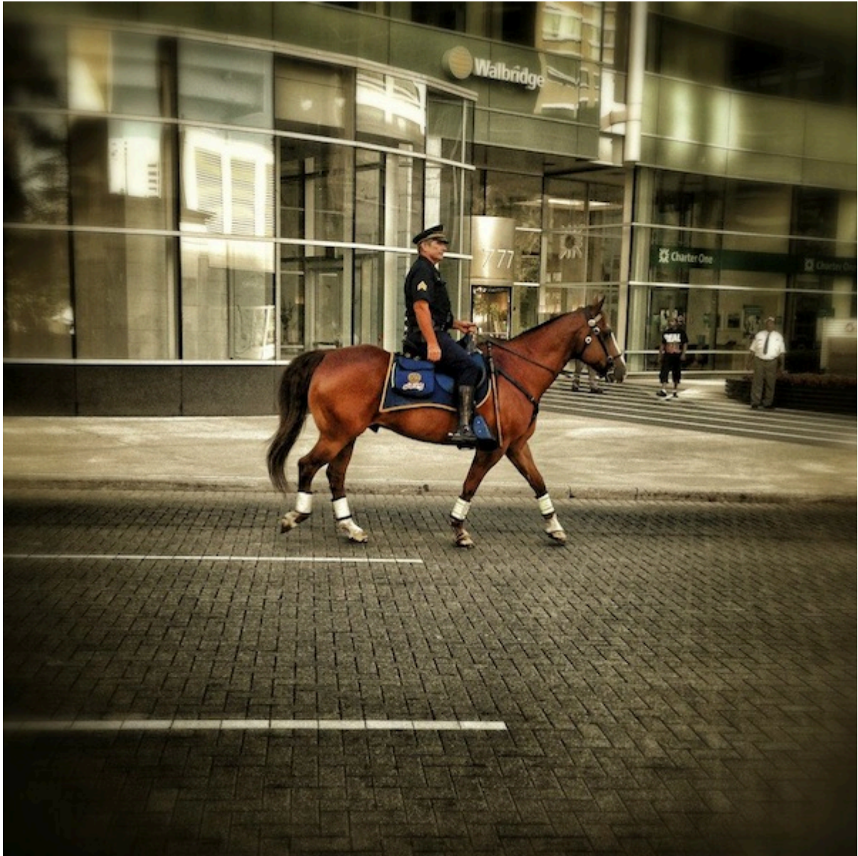
Detroit Mounted Police