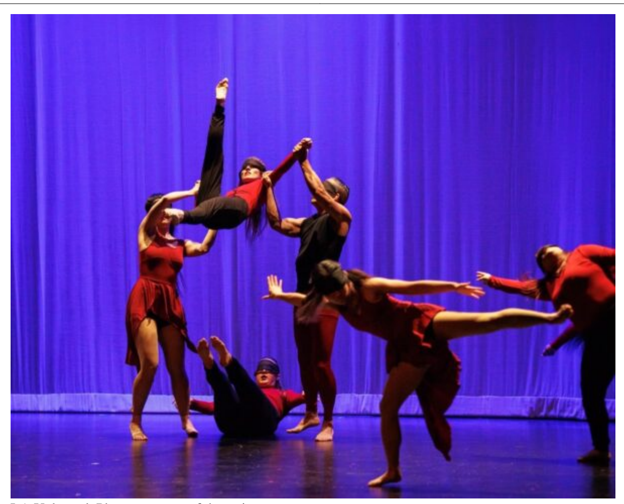
LA Unbound. Photo courtesy of the artists