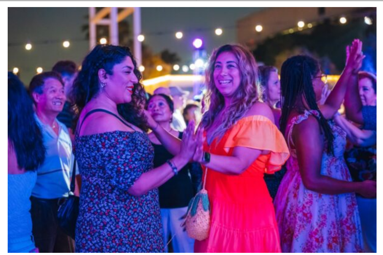
Dance DTLA Salsa Night.