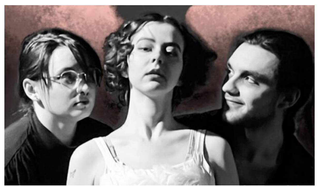
Death of a Swan.

Ave., Hollywood; Sat., June 29, 5:15 pm. Tickets.