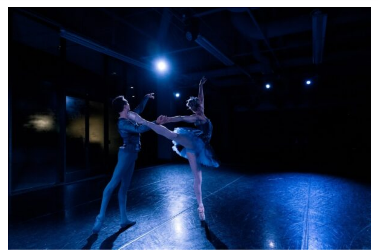
American Contemporary Ballet.