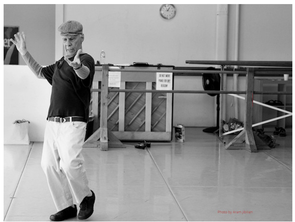
Rudy Perez.