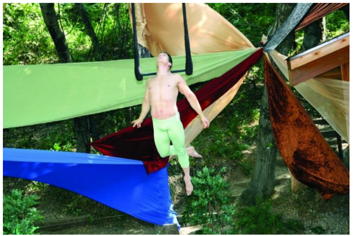
MOMentum Place. Photo courtesy of the artist

Expect a diverse array of dances styles when LA Unbound takes the stage. This spring edition promises 20 performances spanning the dance spectrum. AGBU Performing Arts Center, 2495 E Mountain St., Pasadena; Sat., May 13, 1:30 pm, $22-$32 AGBU.