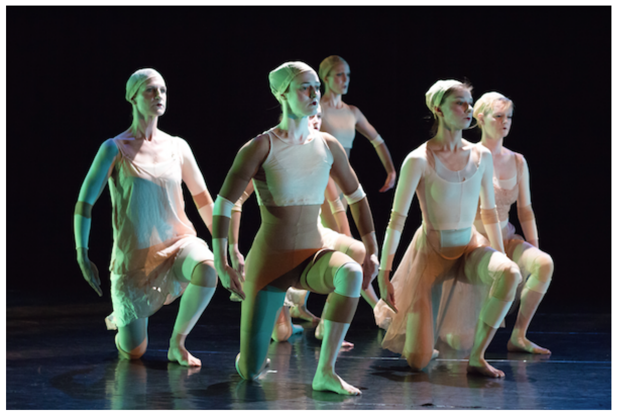
Nancy Evans Dance Theatre.