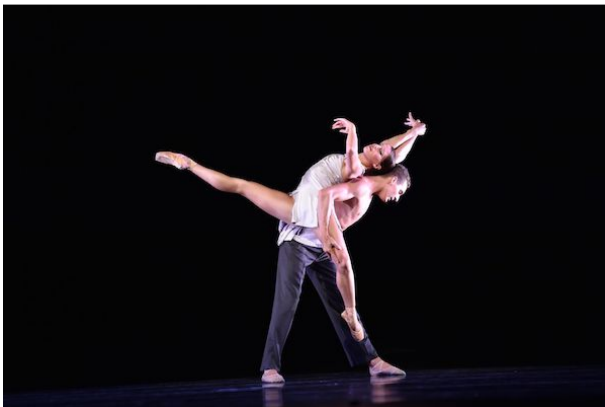
National Choreographers Institute.