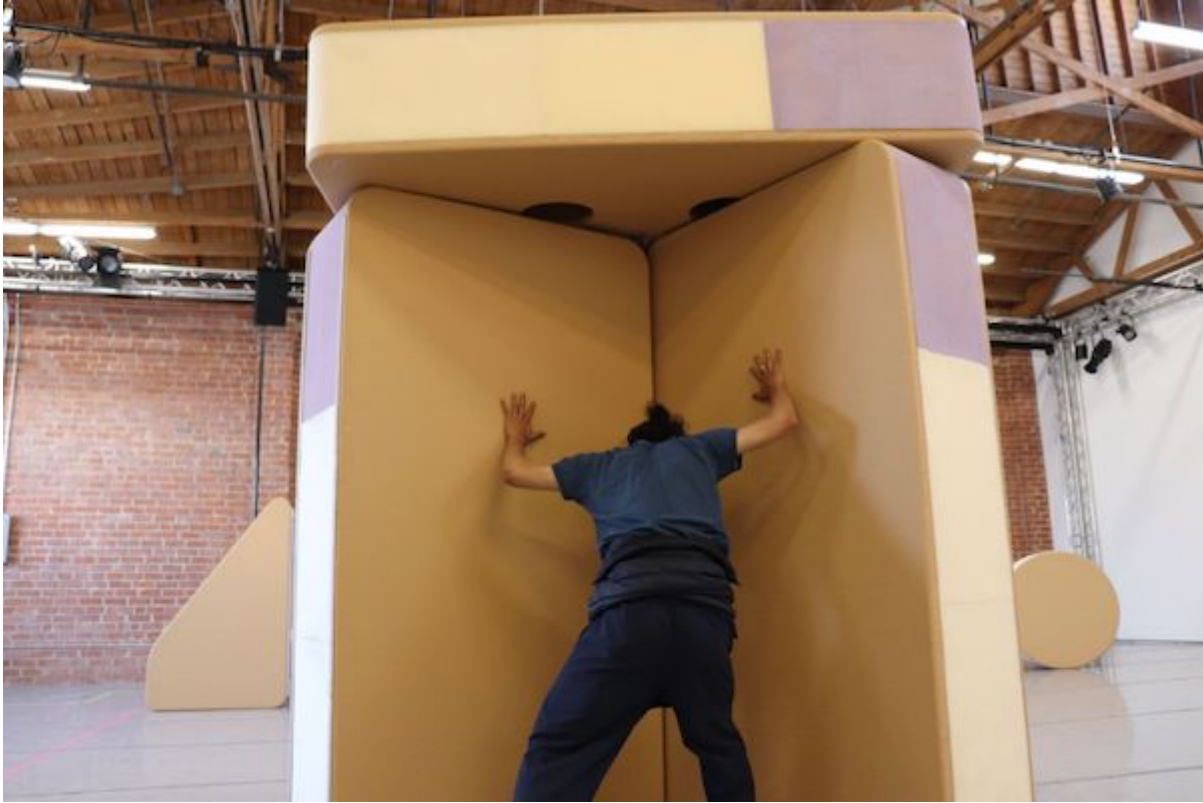
LA Dance Project.