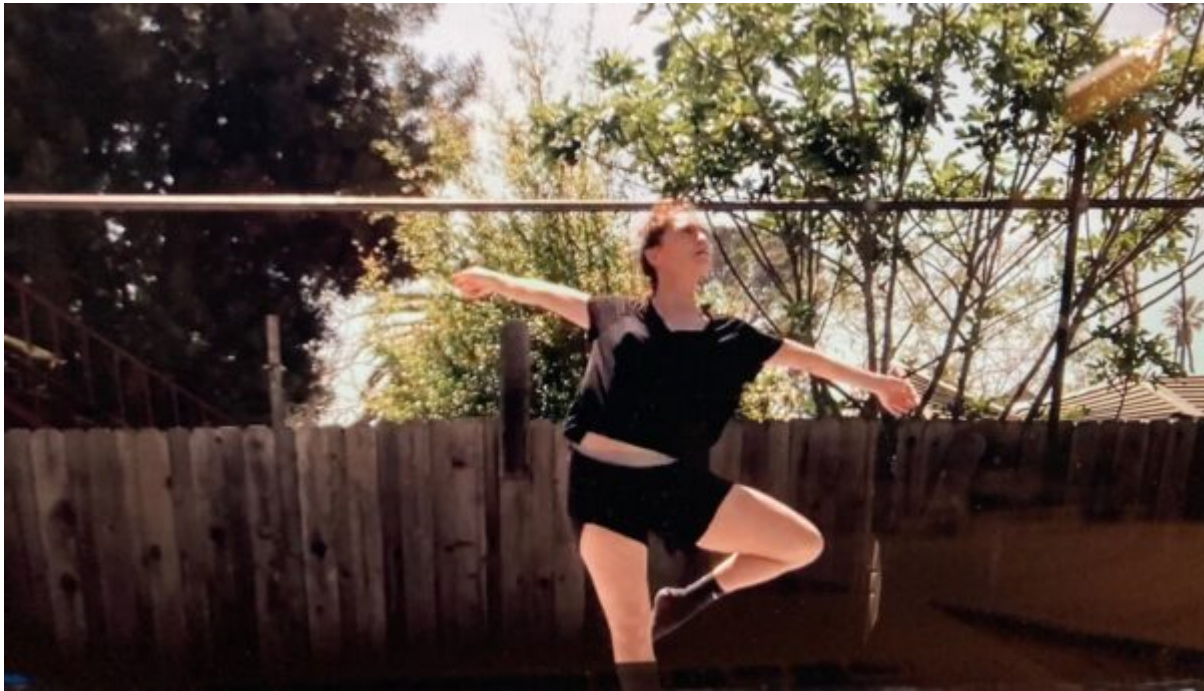
Rosanna Gamson/World Wide.

the tales of the ten travelers unfold one at a time, Gamson's The Decameron Project rolls out ten films, each made by a different artist. All ten episodes are now live and viewable for free on RGWW and on Instagram .