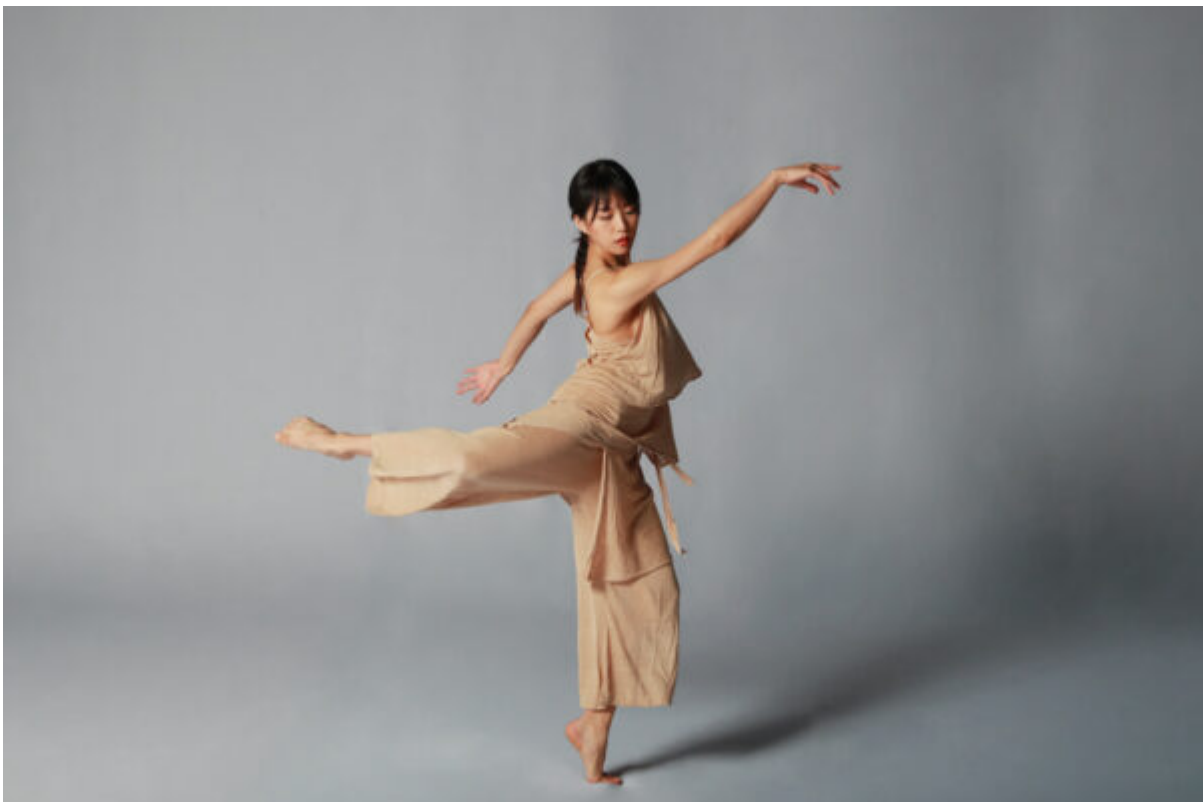
Films.Dance.