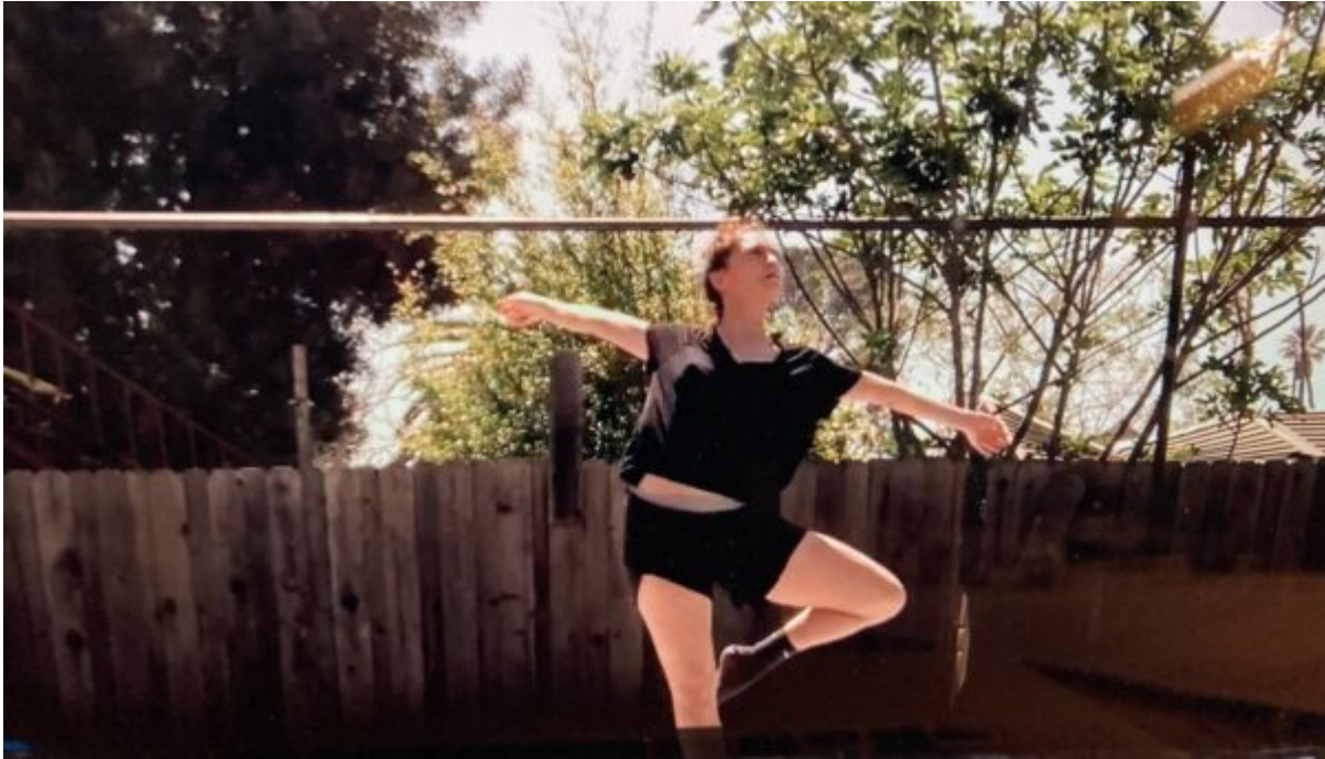
Rosanna Gamson/World Wide.

the tales of the ten travelers unfold one at a time, Gamson's The Decameron Project rolls out ten films, each made by a different artist. All ten episodes are now live and viewable for free on RGWW and on Instagram .