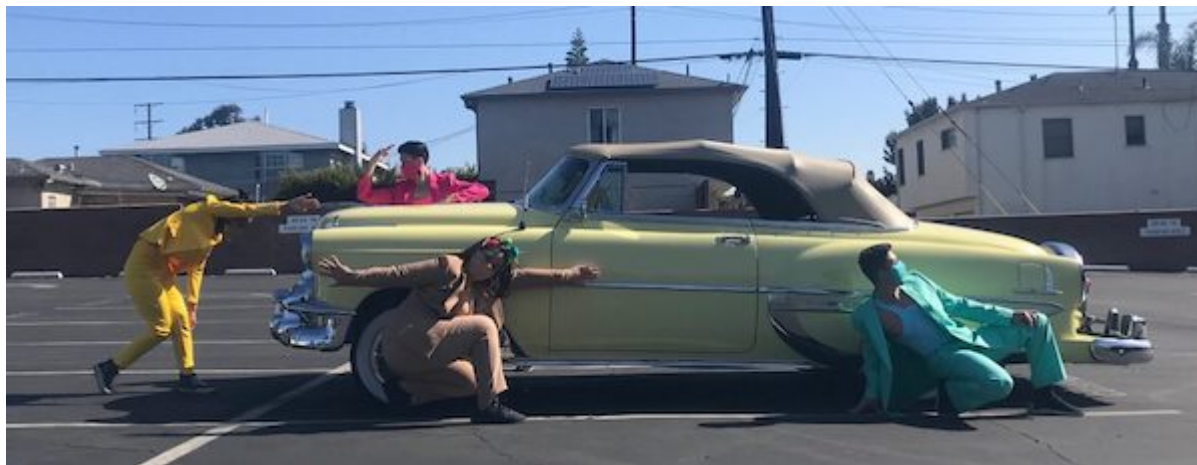
Primera Generación Dance Collective's "low riting"