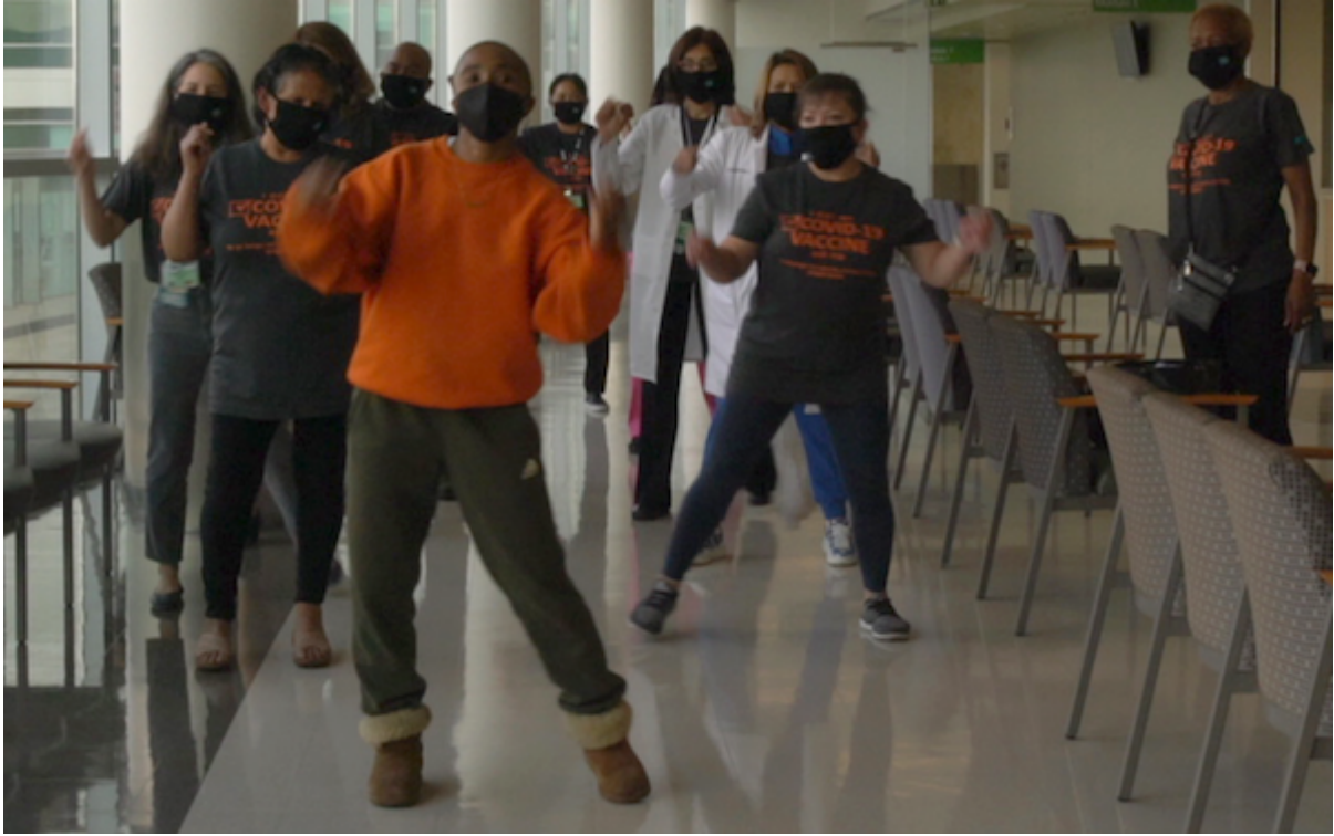
Heidi Duckler Dance.