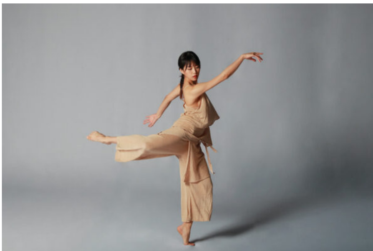
Films.Dance.