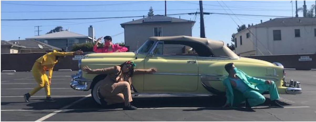
Primera Generación Dance Collective's "low riting"