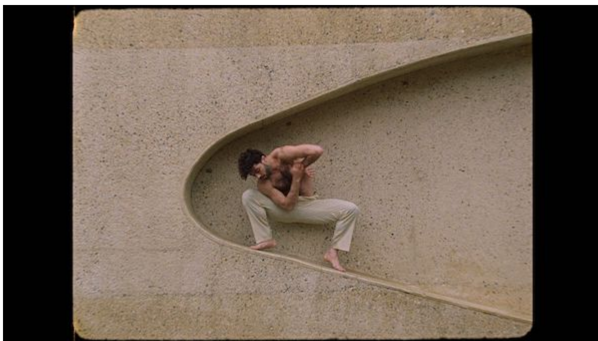
“Films.Dance Round 2.”