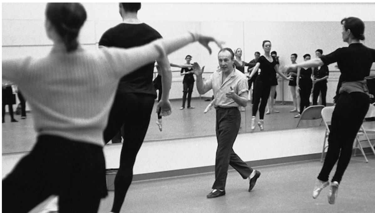
George Balanchine teaching class circa 1964.

America pre-Balanchine. Those quibbles aside, the film has a wealth of insight into how Balanchine taught and how he molded his dancers that defined his ballets. At the Laemmle Royal Theater, 11523 Santa Monica Blvd., West L.A.; Fri., Sept. 24, tickets, showtimes and other venues at Laemmle Theaters .