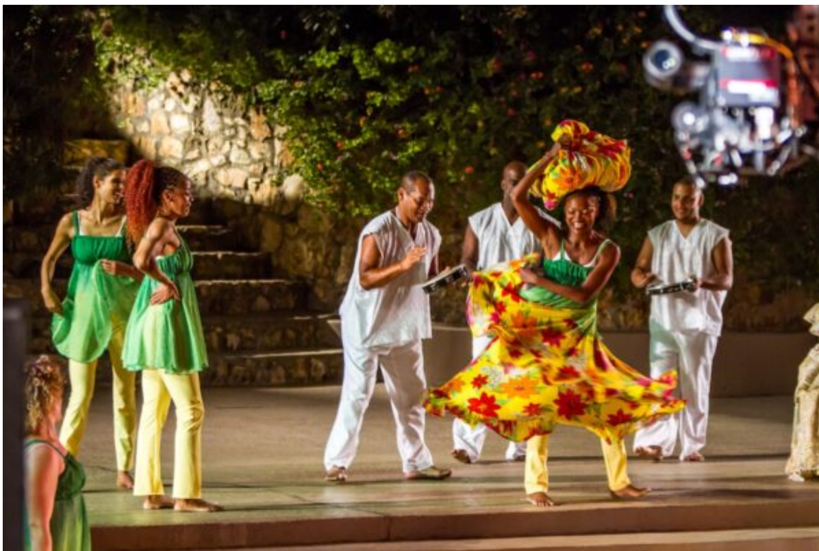
Viver Brasil.

music. Free at Viver Brasil . The ensemble also is part of KCET's Southland Sessions streaming at KCET .