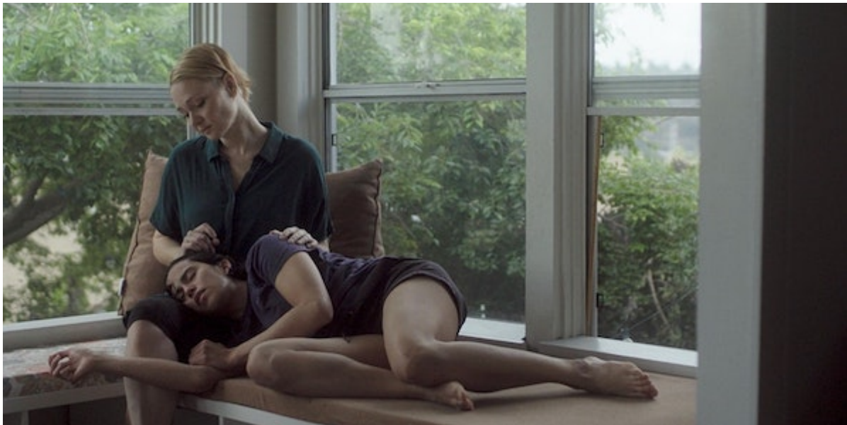
“Dear Mom: A Movement Film Premiere.”