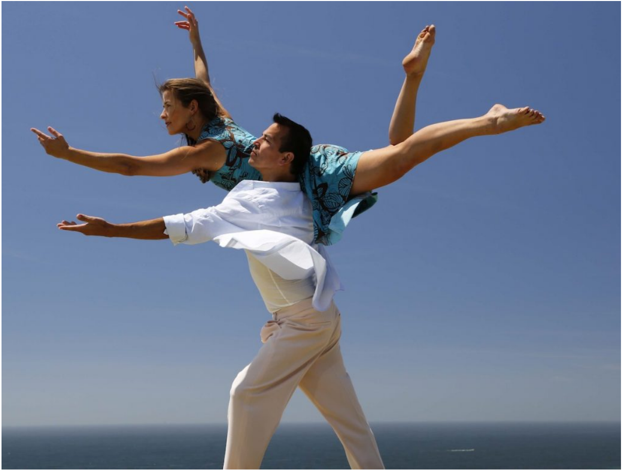
Nannette Brodie Dance Theatre. Photo courtesy of the artists