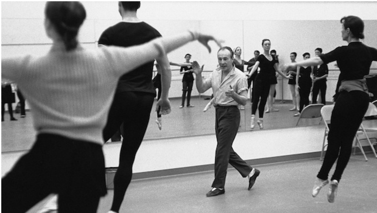
George Balanchine teaching class circa 1964.

America pre-Balanchine. Those quibbles aside, the film has a wealth of insight into how Balanchine taught and how he molded his dancers that defined his ballets. At the Laemmle Royal Theater, 11523 Santa Monica Blvd., West L.A.; Fri., Sept. 24, tickets, showtimes and other venues at Laemmle Theaters .