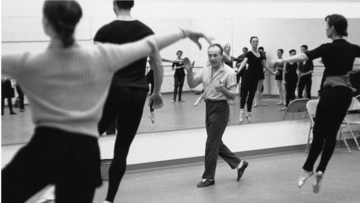
George Balanchine teaching class circa 1964.

America pre-Balanchine. Those quibbles aside, the film has a wealth of insight into how Balanchine taught and how he molded his dancers that defined his ballets. At the Laemmle Royal Theater, 11523 Santa Monica Blvd., West L.A.; Fri., Sept. 24, tickets, showtimes and other venues at Laemmle Theaters .