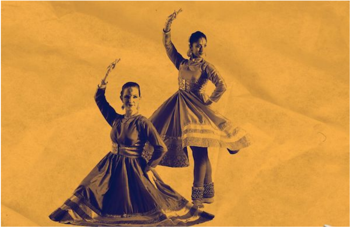
Leela Dance Collective.