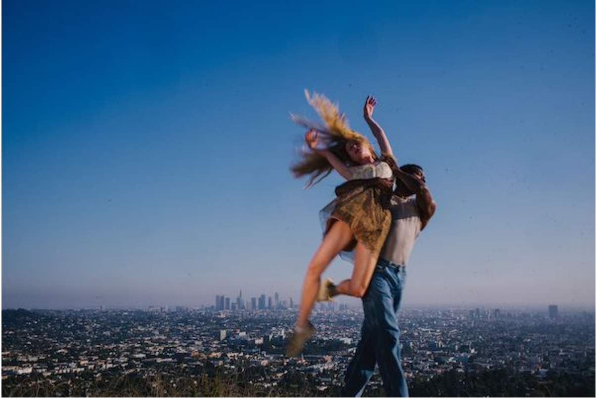
LA Dance Project.