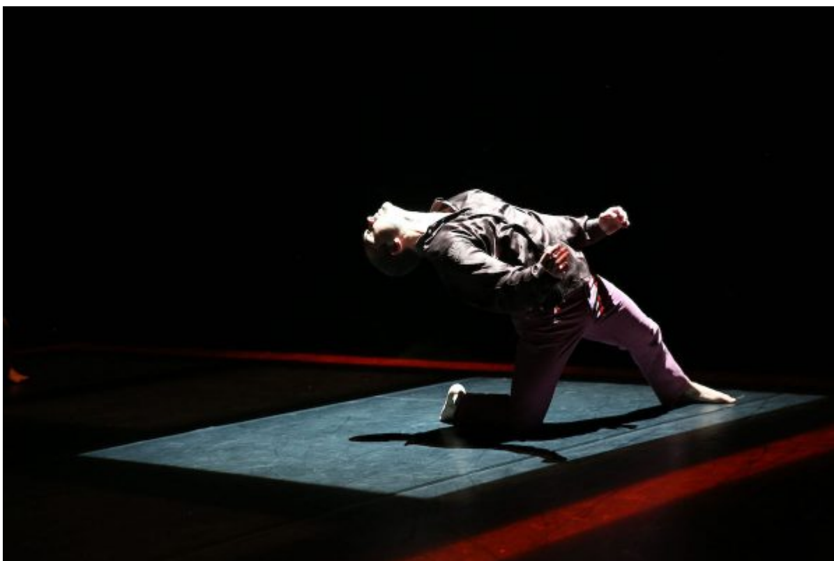
Rosanna Gamson/World Wide.

Under the banner Speakeasy-Orange Dog Review , the ever-insightful choreographer Rosanna Gamson and the dancers of Rosanna Gamson/WorldWide offer contemporary dance in an intimate setting. Residence, 2757 Clyde Ave., West Adams; Sat., Oct. 5, 7 pm, $25-$100. Eventbrite .