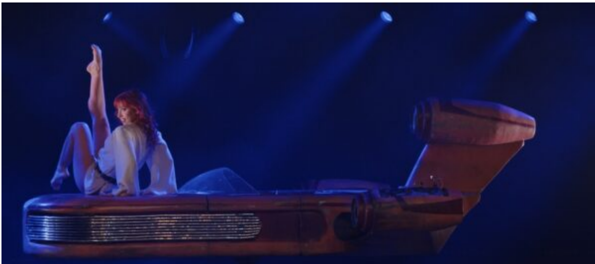
The Empire Strips Back.

The mostly monthly program Max 10 gives ten performers ten minutes each onstage. Hosted by venue director Joel Shapiro and curated by the staff, dance is a mainstay in the line up of performances. A post-show reception gives a chance to chat with the artists. Electric Lodge, 1416 Electric Ave., Venice; Mon., Oct. 7, 7:30 pm, $10. Electric Lodge .