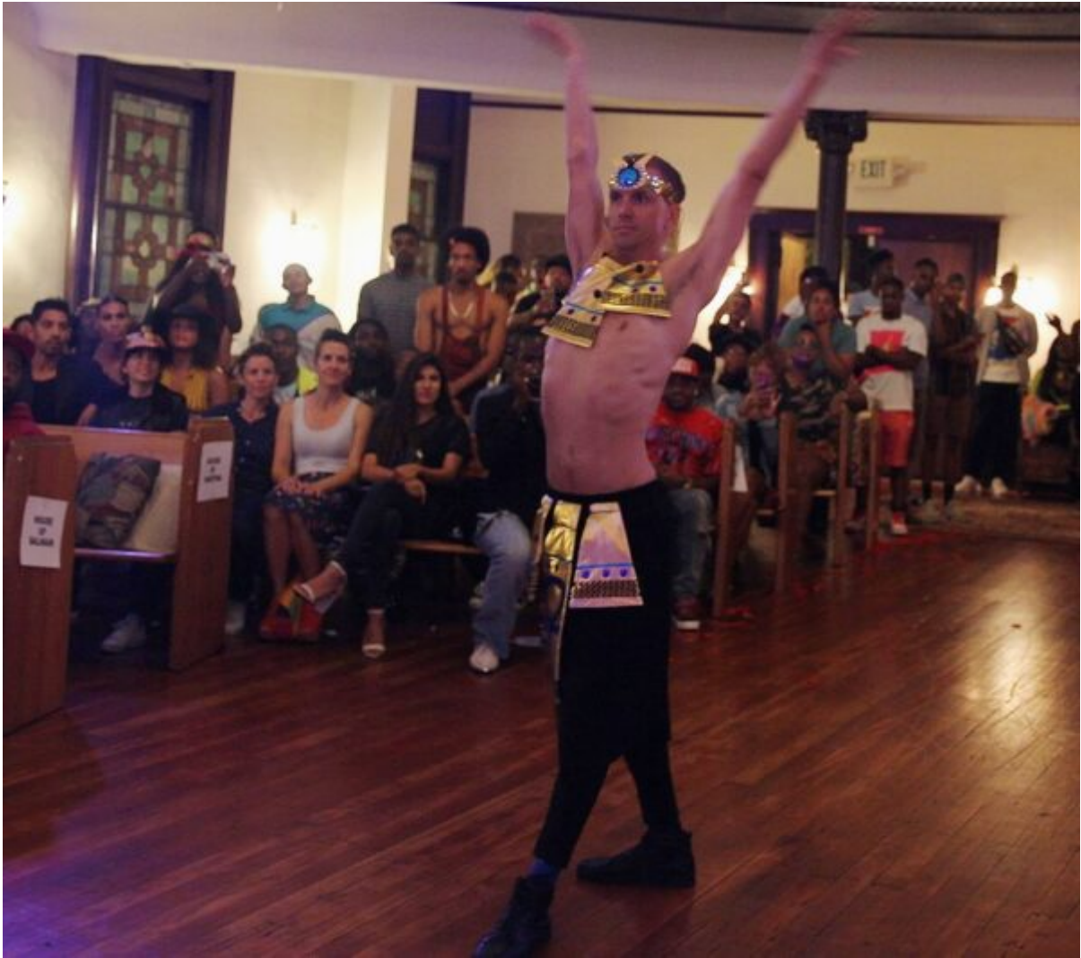
Banjee Ball.