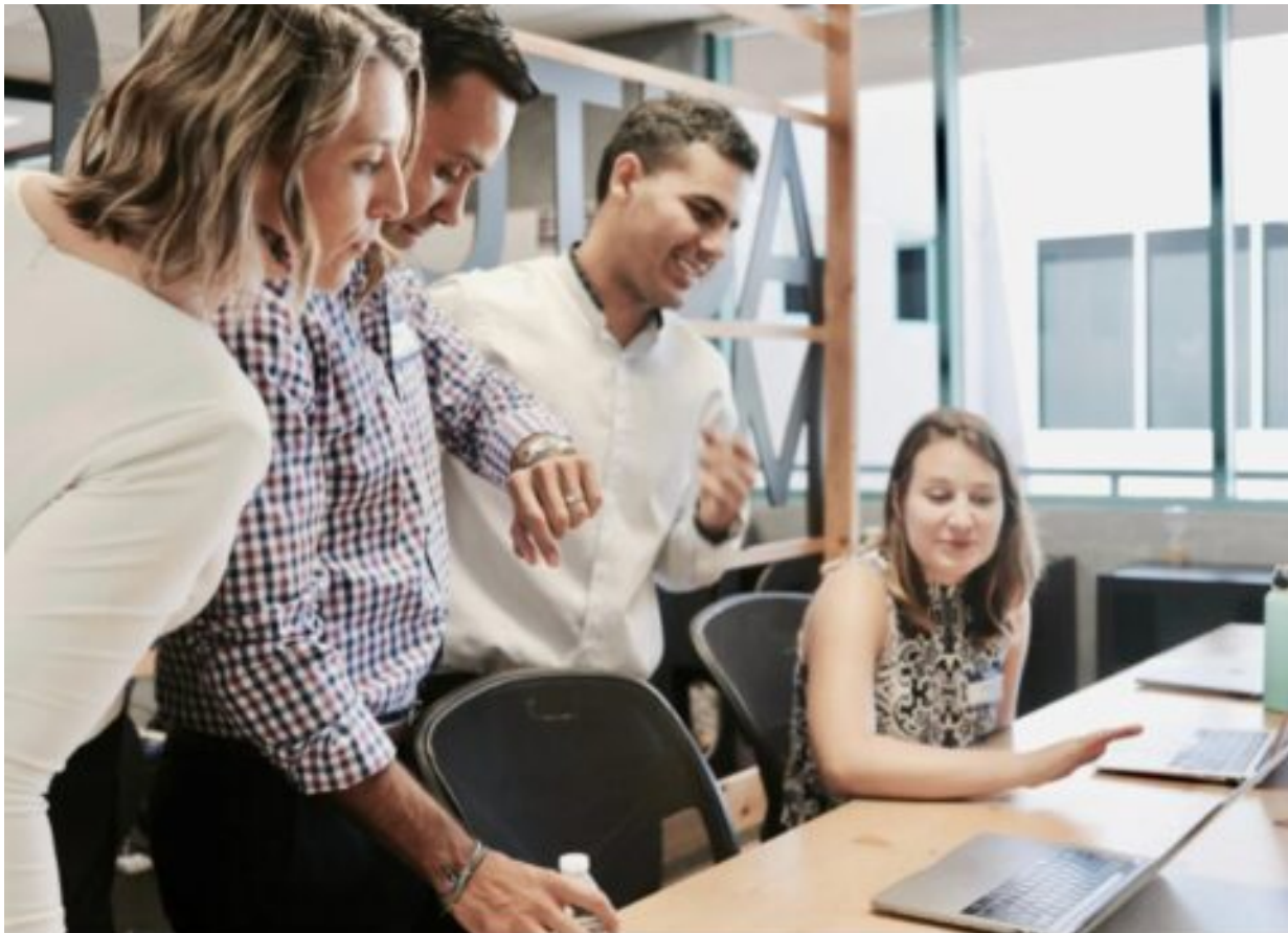
Coworkers gathering around work station.

To be more precise, by tracking these indicators frequently, you can detect what aspects need further optimization and adjust your approach to content creation for the preferable outcomes.