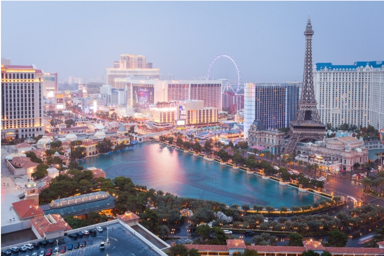
The era of the Las Vegas mega resorts.