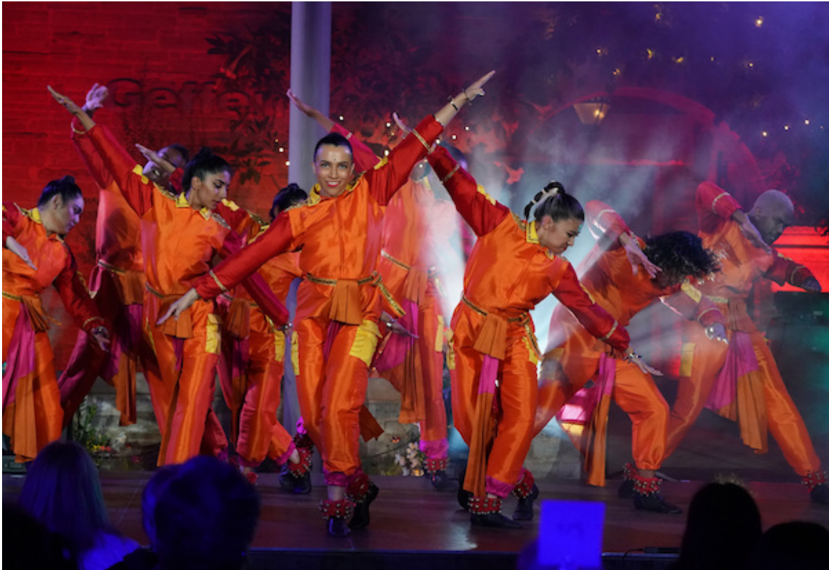
Blue13 Dance Company.

Viver Brasil at Sierra Madre Playhouse, 87 West Sierra Madre Blvd., Sierra Madre; Sat., Sept. 28, 11 am, $12. Sierra Madre Playhouse .