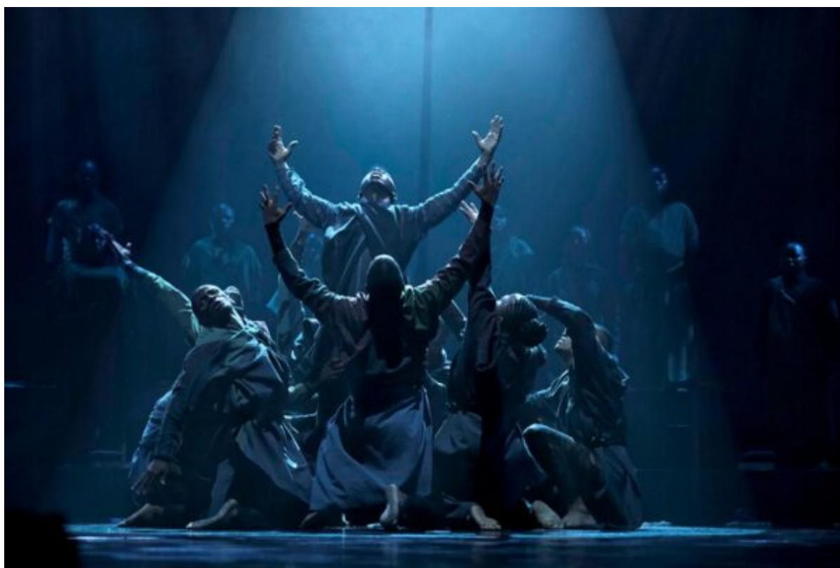
Vuyani Dance Theatre in Gregory Maqoma's "Cion."

Strains of Ravel's Bolero recognizably and intermittently emerge then fade, interwoven with African chant and song in Nhlanhla Mahlangu score for choreographer Gregory Maqoma's Cion: Requiem of Ravel's Boléro . Performances in New York City and Washington D.C. drew rave reviews for Maqoma's concept and his capture of individual and collective grief and resilience. Also, reviews heaped praise on the powerful dancers of Vuyani Dance Theatre , seamlessly shifting from traditional African dance to contemporary moves. Sadly there's only one show on a very busy dance weekend. UCLA Royce Hall, 10745 Dickson Ct., Westwood; Sat., Sept. 21, 8 pm, $42.08 – $63.37. CAP UCLA .