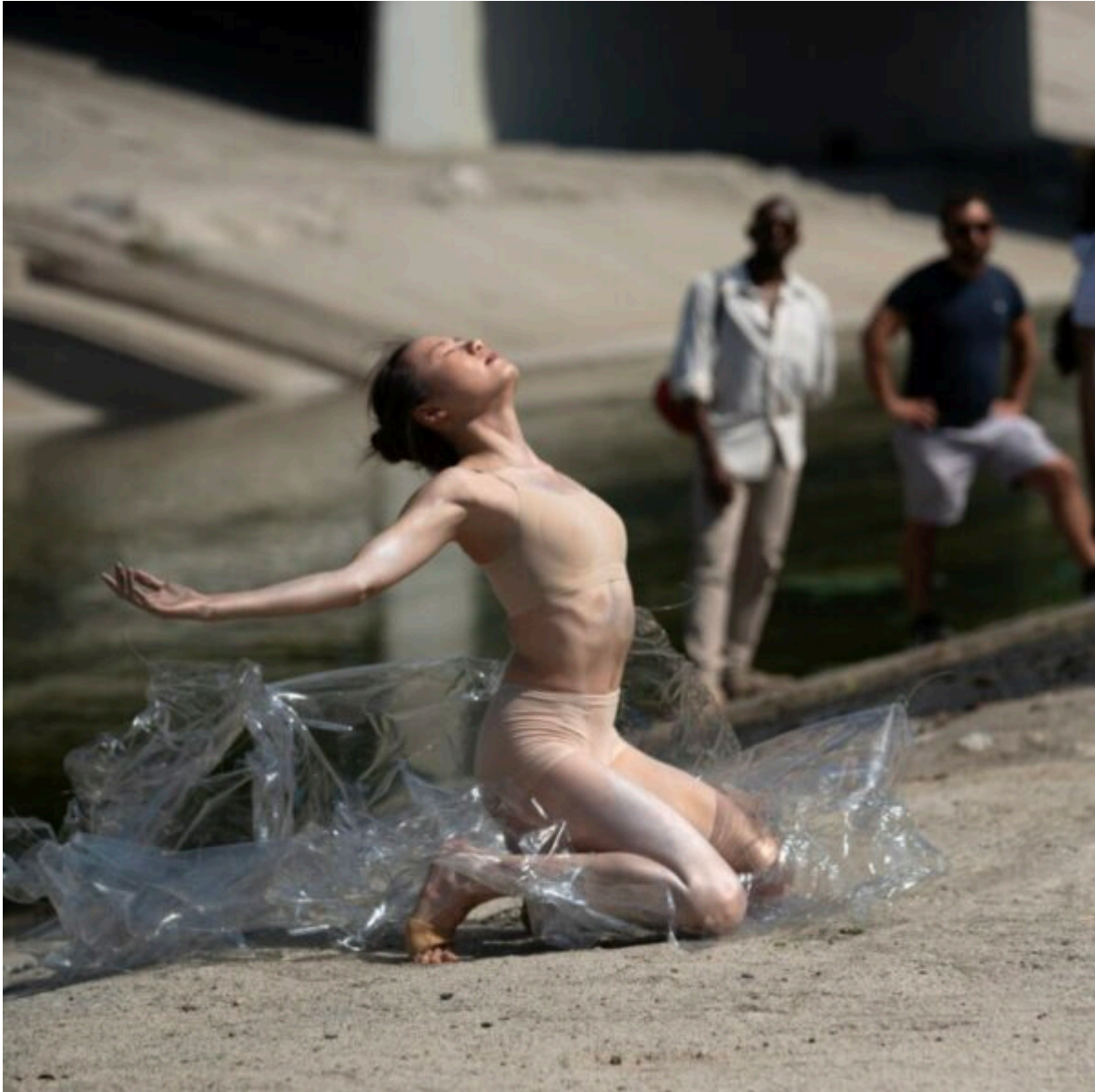
Heidi Duckler Dance.