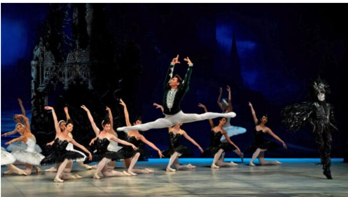
World Ballet.

The touring ensemble World Ballet Company , flies into SoCal, alighting at four venues in the next week with a full-length Swan Lake . Irvine Barclay Theatre, UC Irvine, 4242 Campus Dr., Irvine; Thurs.-Fri., Sept. 19-20, 7 pm, $64-$110. Irvine Barclay ; Also at the Alex Theatre, 216 N. Brand Ave., Glendale; Sat., Sept. 21, 7 pm, $58-$123. Ticketmaster . Also at Granada Theatre, 1214 State St., Santa Barbara; Sun., Sept. 22, 7 pm, $57-$132. Granada Theatre . Also at Fred Kavli Theatre, Bank of America Performing Arts Center, 2100 Thousand Oaks Blvd., Thousand Oaks; Sun., Sept. 25, 7 pm, $58-$143. Ticketmaster .