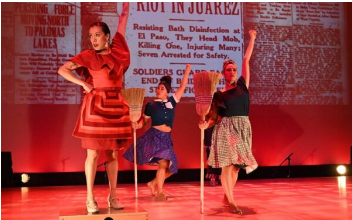
La Mezcla.