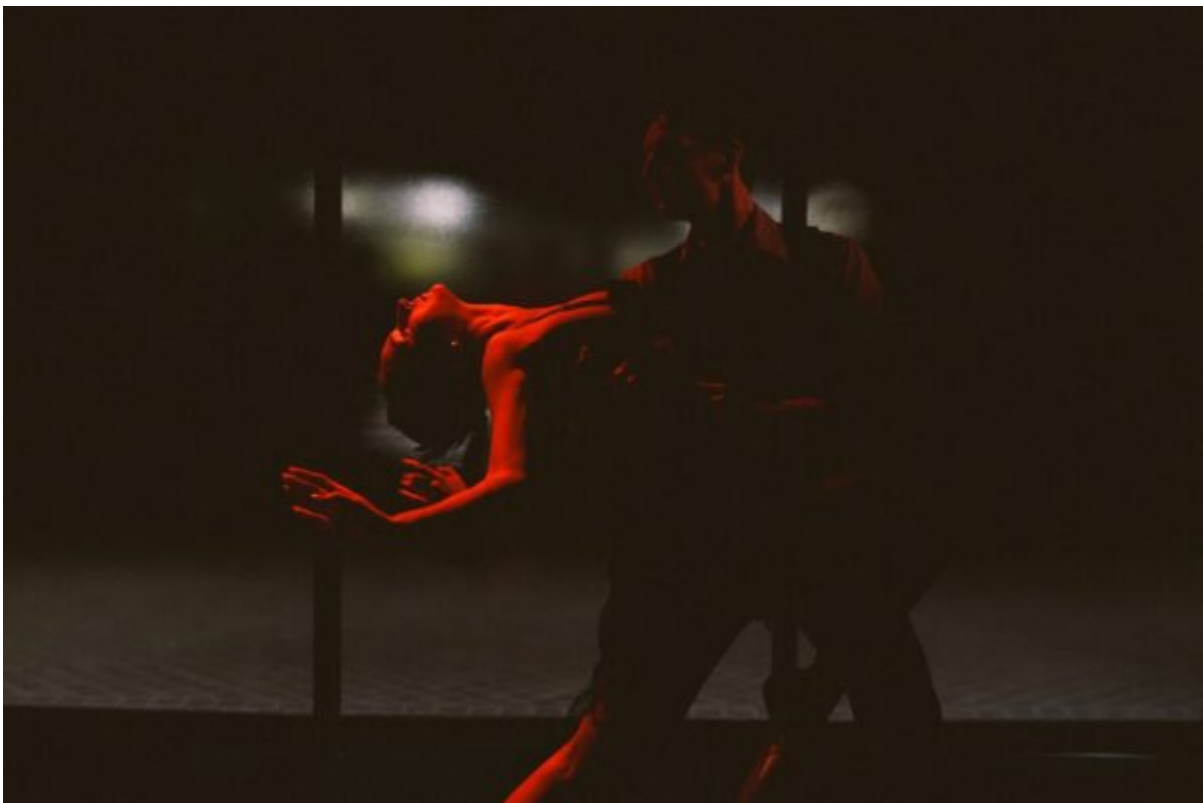
American Contemporary Ballet.

It's the final performances of American Contemporary Ballet's season opener, choreographer Lincoln Jones' Death and the Maiden and Burlesque: Variation IX . As always, the dances are accompanied by live music. ACB Studios, Bank of America Plaza, Co-150, 333 S. Hope St., Downtown; Fri.-Sat., Oct. 31-Nov. 1, 8 pm, $65-$140. ACB .