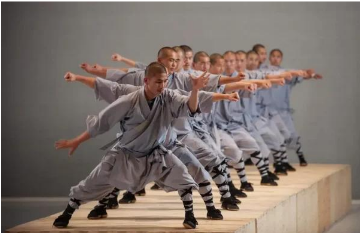
Warrior Monks of the Shaolin Temple.

Celebrated Belgian choreographer Sidi Larbi Cherkaoui launches 19 warrior monks from China's Shaolin Temple onto a set by British sculptor Antony Gormley for the LA premiere of Sutra . Luckman Fine Arts Complex, CalState LA, 5151 State University Dr., East LA: Sun., Nov. 2, 7 pm, $49-$98. Ticketmaster .