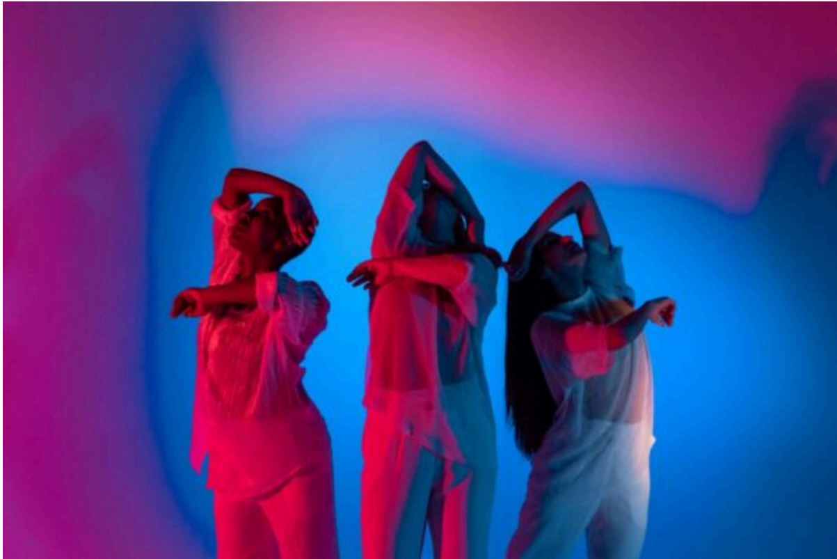
MashUp Contemporary Dance Company.

To celebrate its 15th anniversary, the female forward MashUp Contemporary Dance Company offers a one night only performance that reprises several significant works including UNRAVEL , Power , and Intrinsic Motivation . The celebratory show includes guests and surprises honoring the ensemble's legacy. Stomping Ground, 5453 Alhambra Ave., El Sereno; Sat., Nov. 1, 7:30 pm, $35. MashUp Contemporary Dance Company .