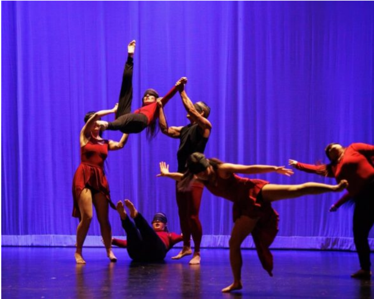
LA Unbound.