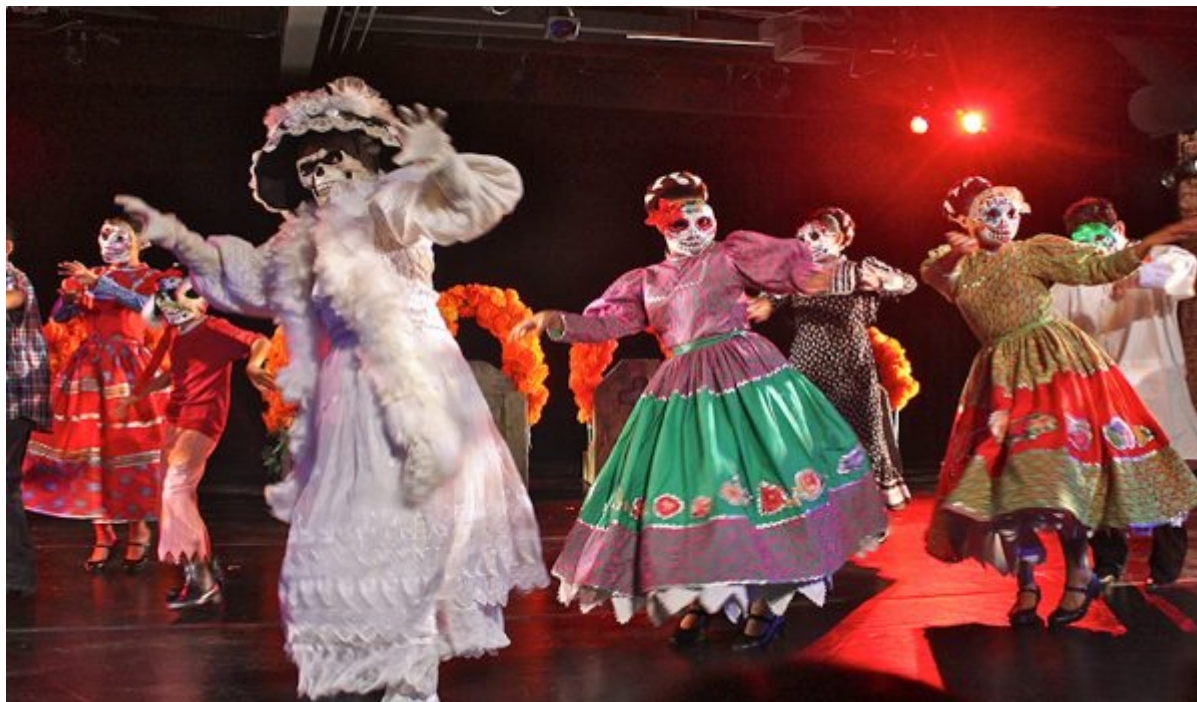
Danza Floricanto/USA.

Danza Floricanto/USA — Fiesta del Dia de los Muertos (Day of the Dead Festival) at The Floricanto Center for the Performing Arts, 2900 Calle Pedro Infante, East LA; Sun., Nov. 9, 6 pm, $15 pre-sale, $20 at door, $30 VIP, $10 children (at door only). Danza Floricanto/USA .