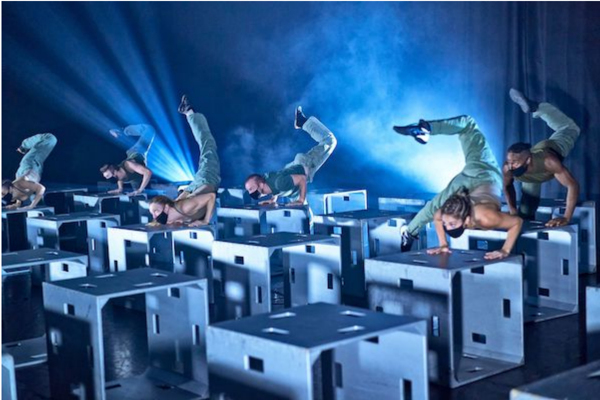
Diavolo Veterans Project.