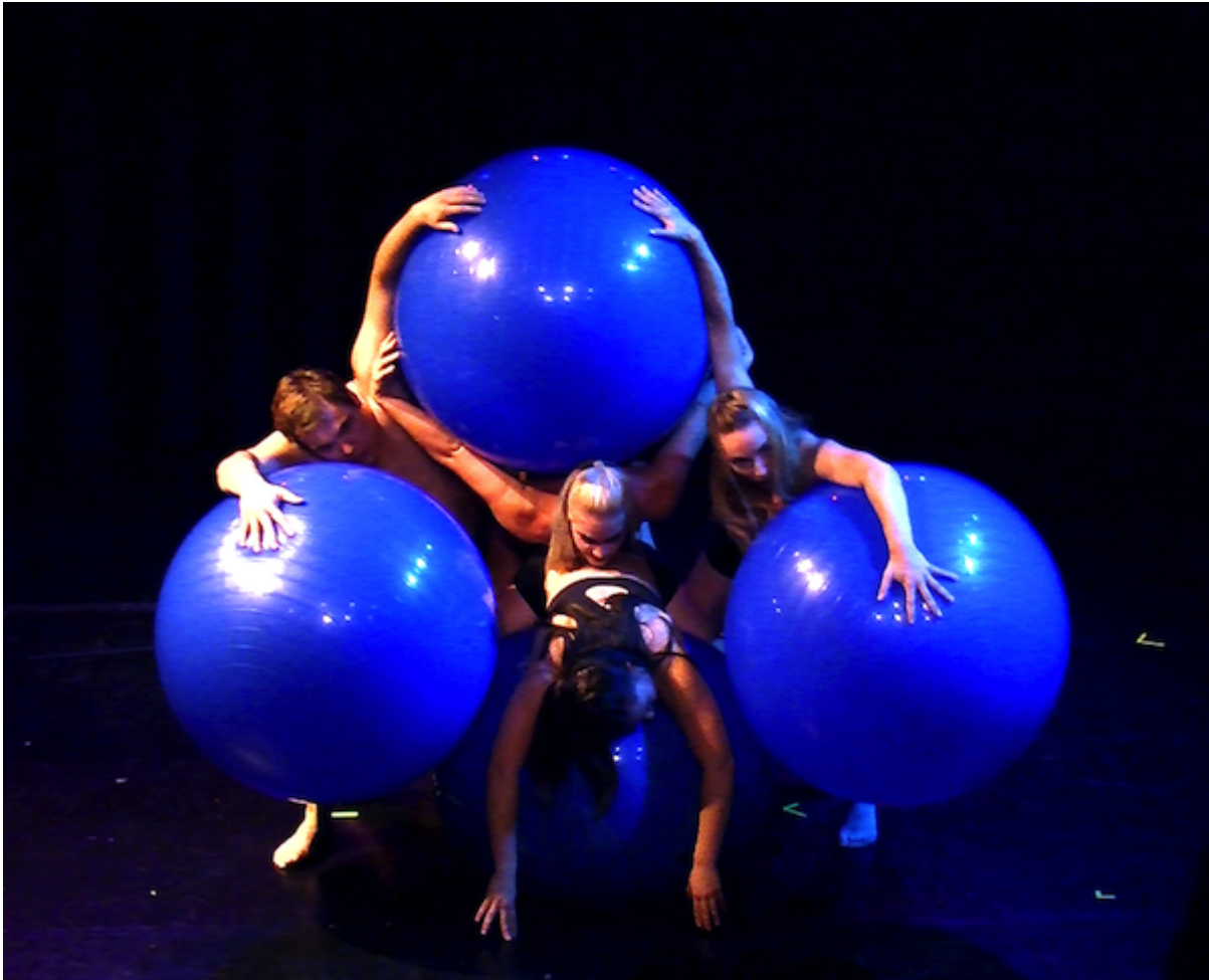
Max 10.