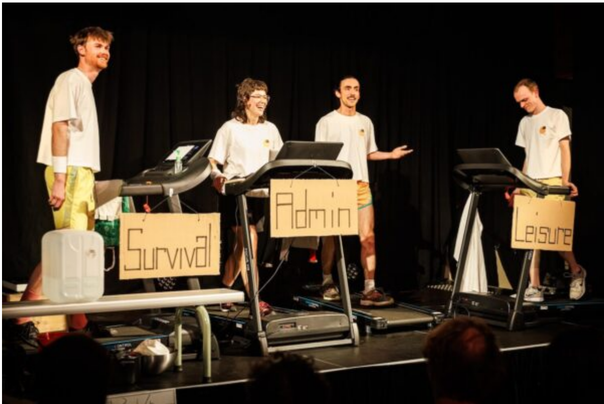
Pony Cam.

popularity argues for a yes to all three. UCLA Nimoy, 1262 Westwood Blvd., Westwood; Sat.-Sun., Nov. 1-2, 8 pm, $38.08-$48.67. Pony Cam .