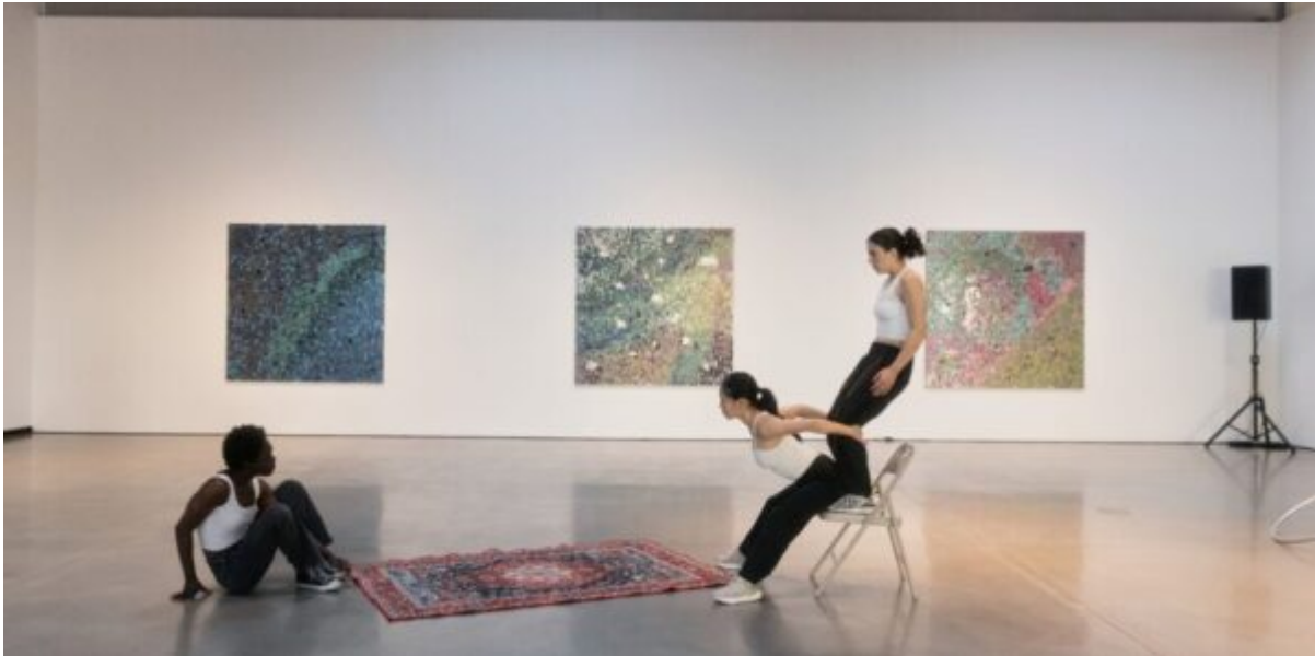
Volta Collective.