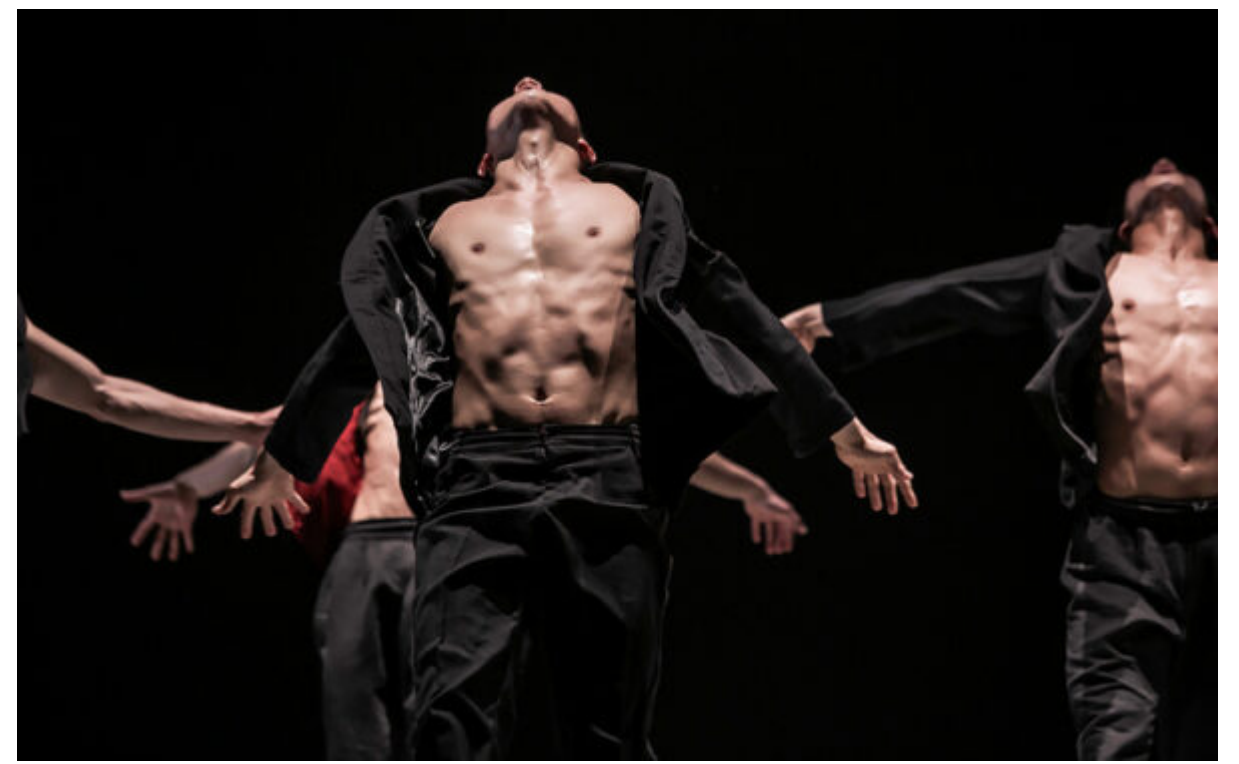
Bereishit Dance Company.