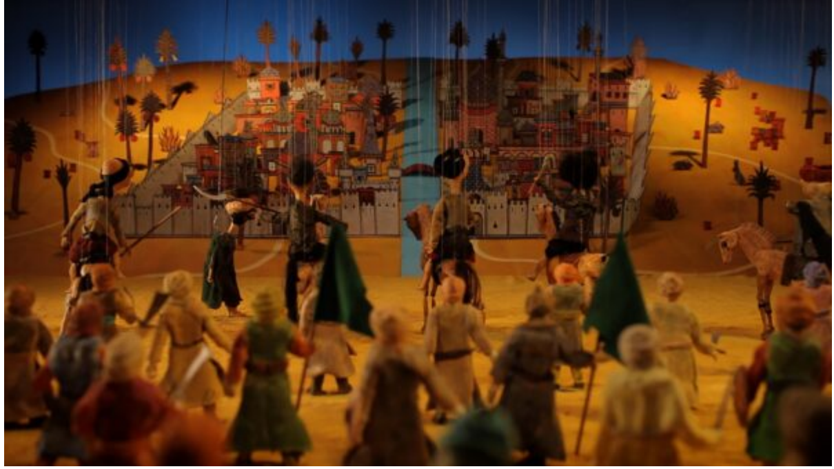
Wael Shawky.