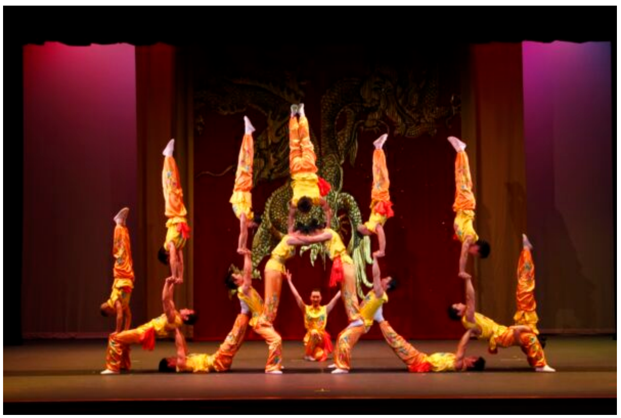
The Peking Acrobats.

Known for their astonishing flexibility, balance, athleticism and acrobatics, The Peking Acrobats return for one performance. The popular troupe retain the pre-Beijing name they have performed under since their founding, stating they feared audience confusion given their established brand. Segerstrom Center for the Arts, Segerstrom Concert Hall, 600 Town Center Dr., Costa Mesa; Sat., Jan. 18, 8 pm, $55.37 $111.87. SCFTA.