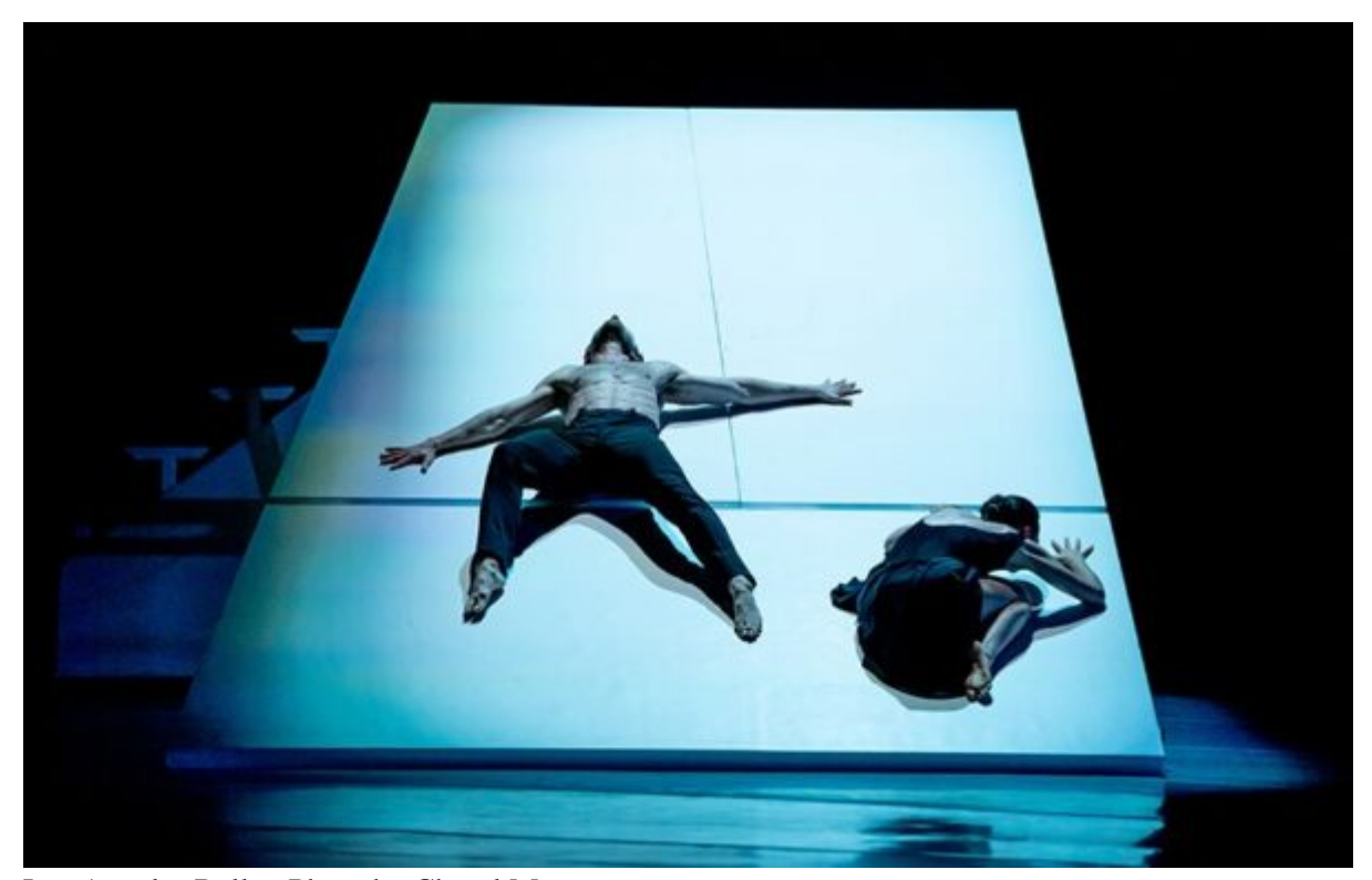
Los Angeles Ballet.