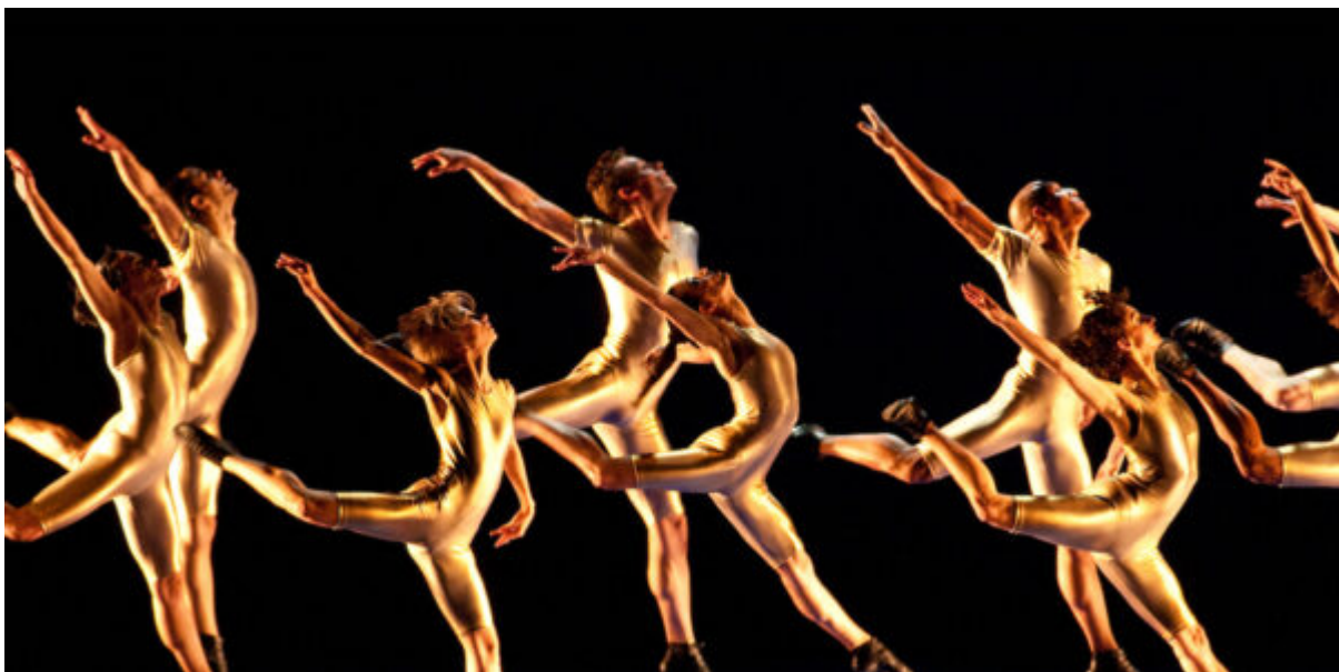
Grupo Corpo.