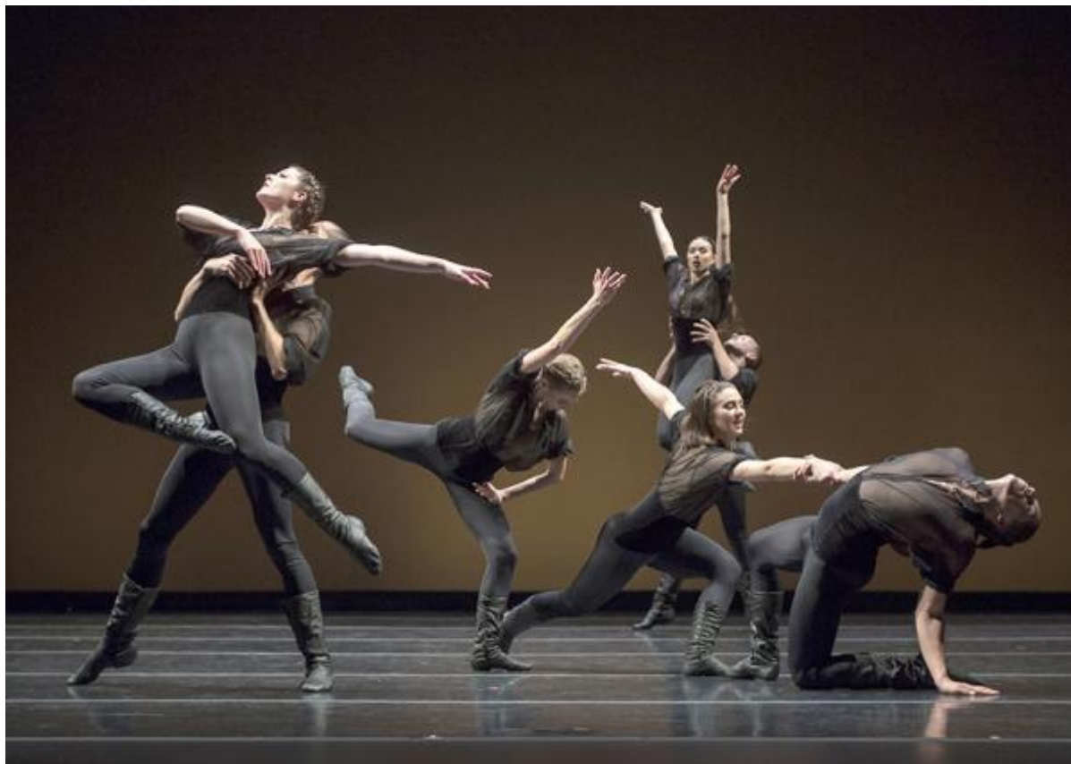
UC Irvine Dance Visions.