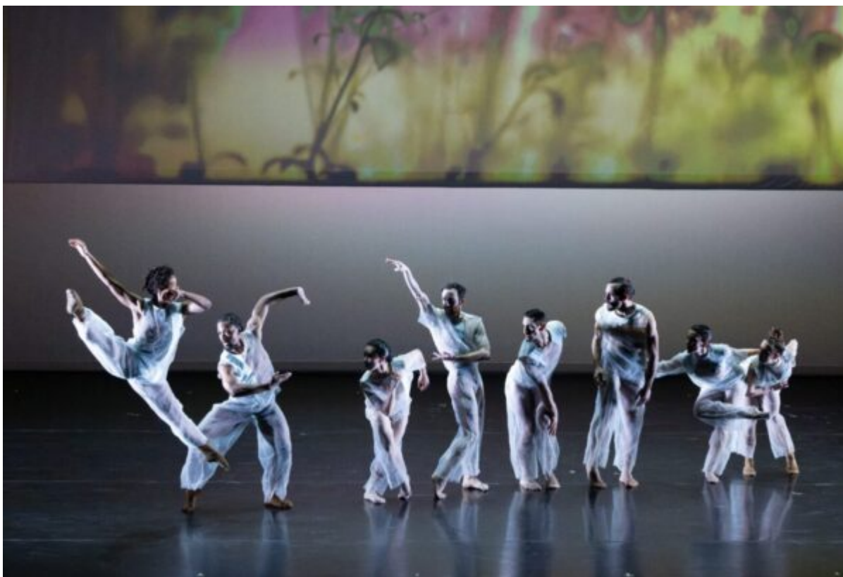
BODYTRAFFIC.