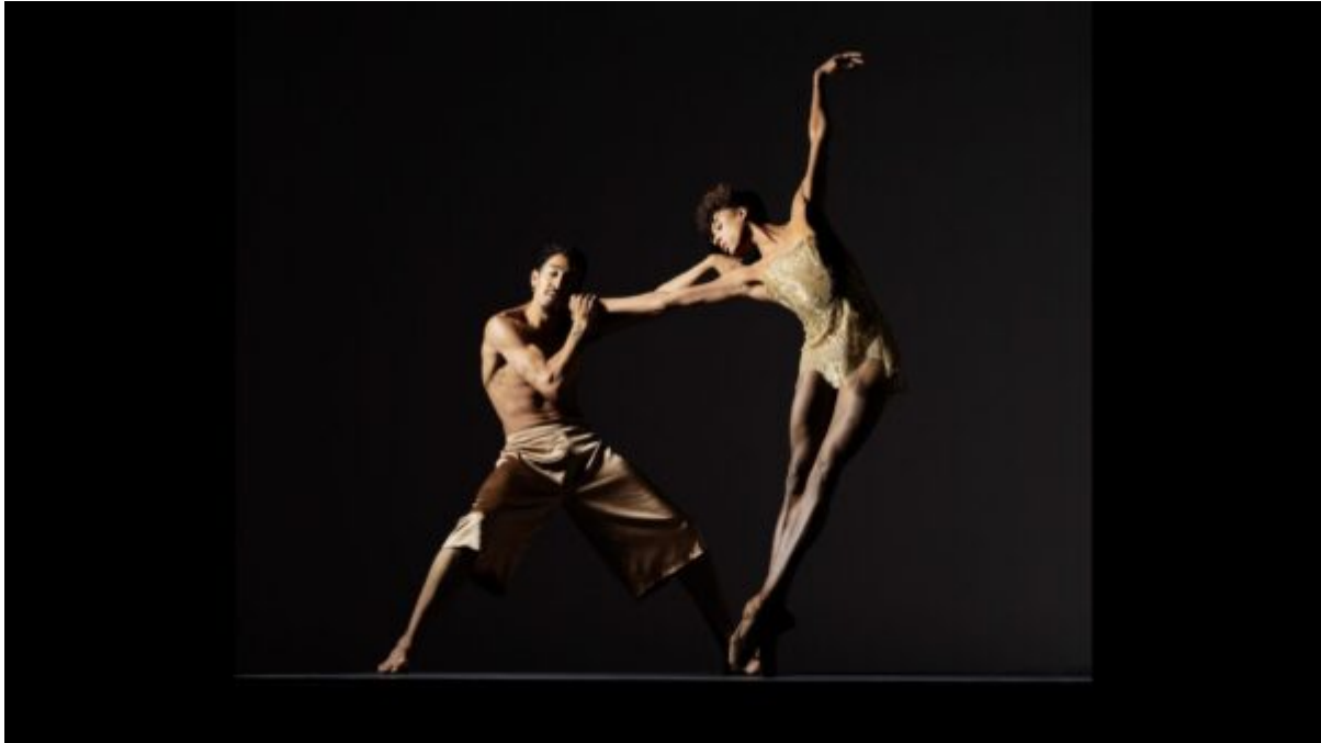
Alonzo King LINES Ballet.

The welcome mat should always be out for the dazzling dancers of San Francisco’s Alonzo King LINES Ballet . The celebrated choreographer and the distinctive dancers of his eponymous contemporary ballet company are often at their best working with jazz music. This visit brings King’s Ode to Alice Coltrane with music from her 1971 album Journey in Satchidananda , along with The Beauty of Dissolving Portraits set to jazz trumpeter Ambrose Akinmusire. At the Soraya, Cal State University Northridge, 18111 Nordhoff St., Northridge; Sat. Feb. 21, 8 pm $46-$94. LINES Ballet .