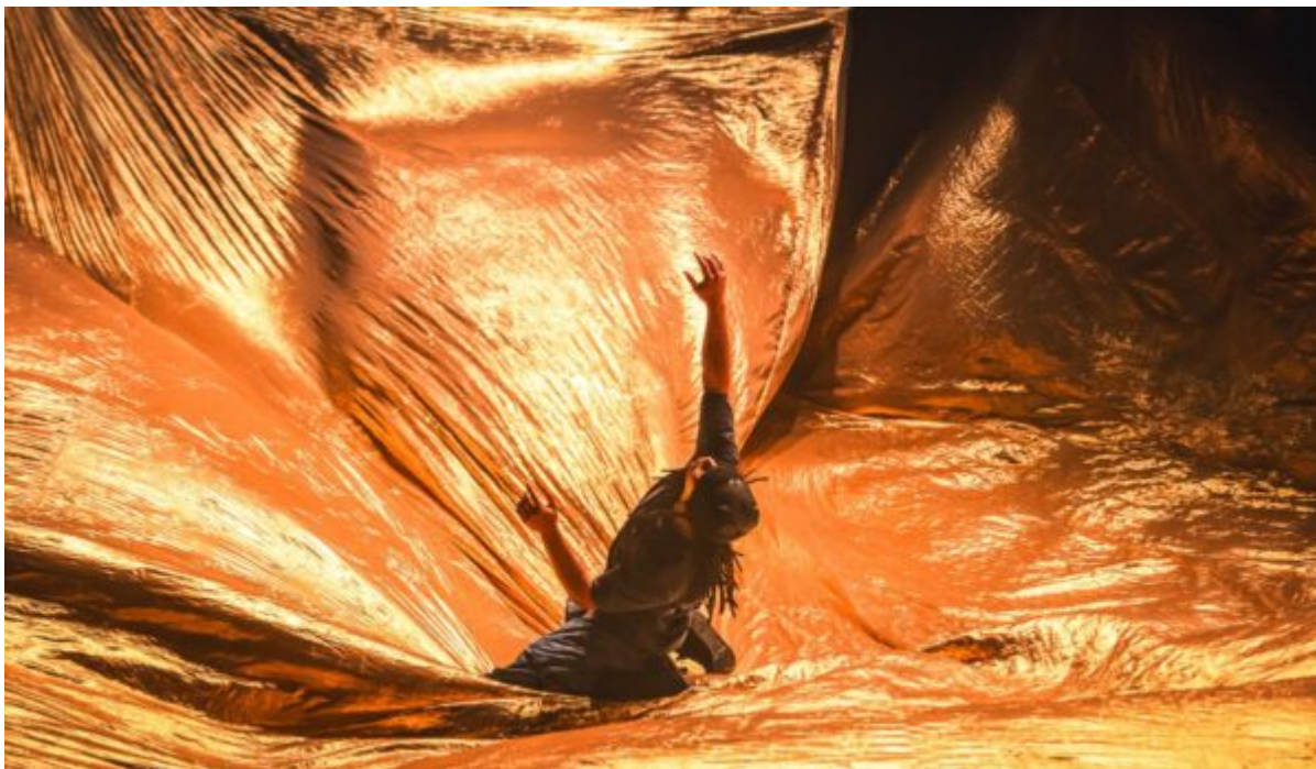
Compagnie Hervé Koubi.