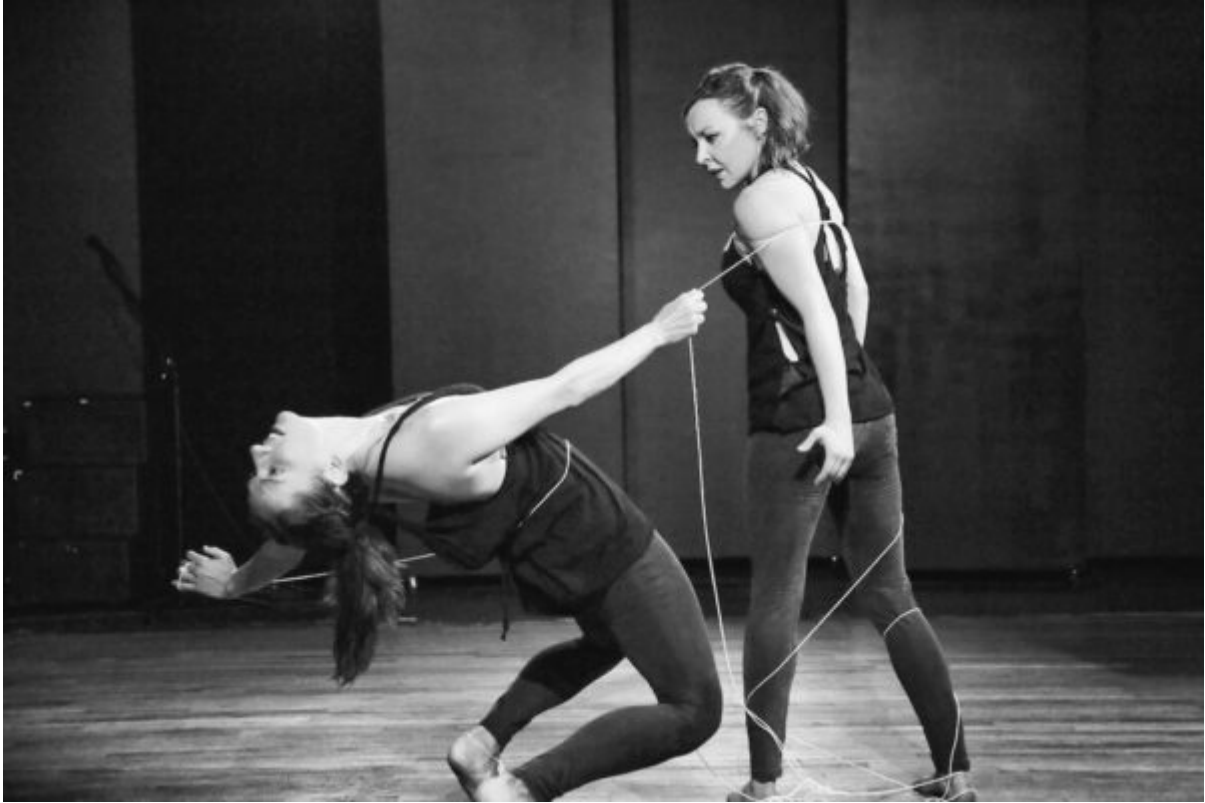
Lineage Dance.