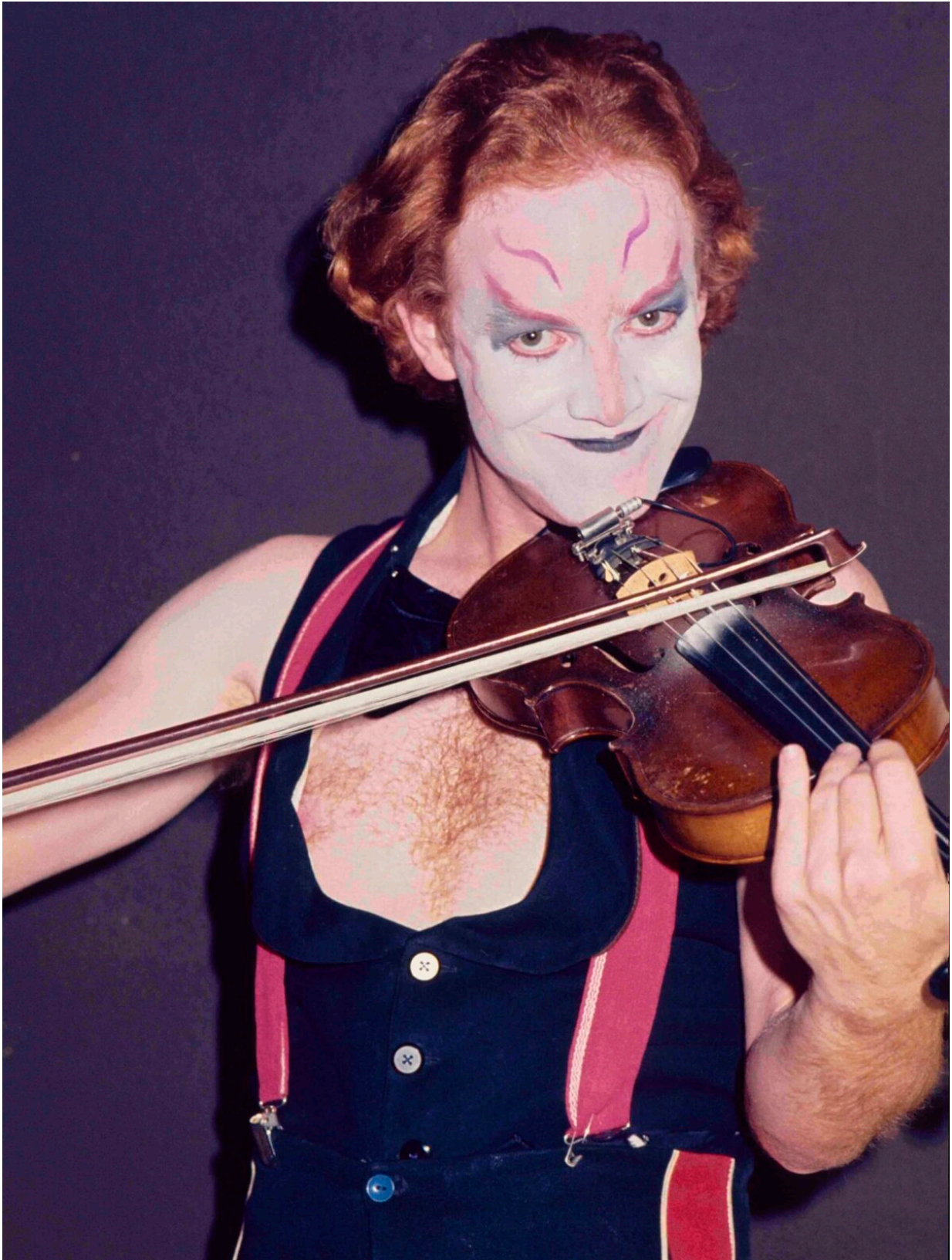
Danny Elfman

article about these performance artists and watch them perform the song at this link . You may watch the movie on Amazon Prime in the original 1980 B&W and the 2010 colorized version.