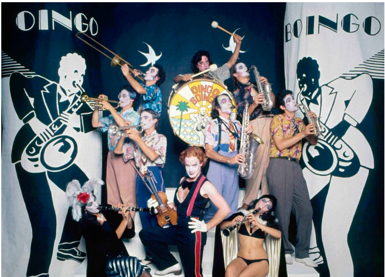
Mystic Knights of the Oingo Boingo