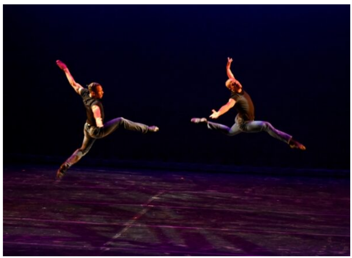
Jazzantiqua Dance & Music Ensemble.