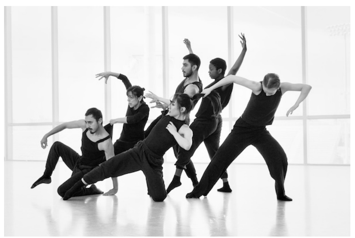
Kybele Dance Theater.

Kybele Dance Theater at the Glorya Kaufman Performing Arts Center, 3200 Motor Ave., Cheviot Hills; Sat., March 9, 7:30 pm, Sun., March 10, 3 pm, $30-$45, $20 students. Kybele Dance tickets.