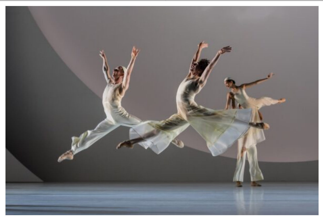
Les Ballets de Monte-Carlo.