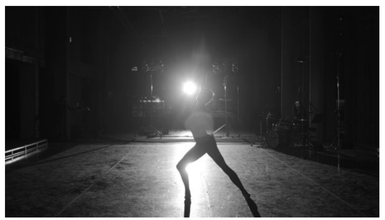
American Contemporary Ballet.