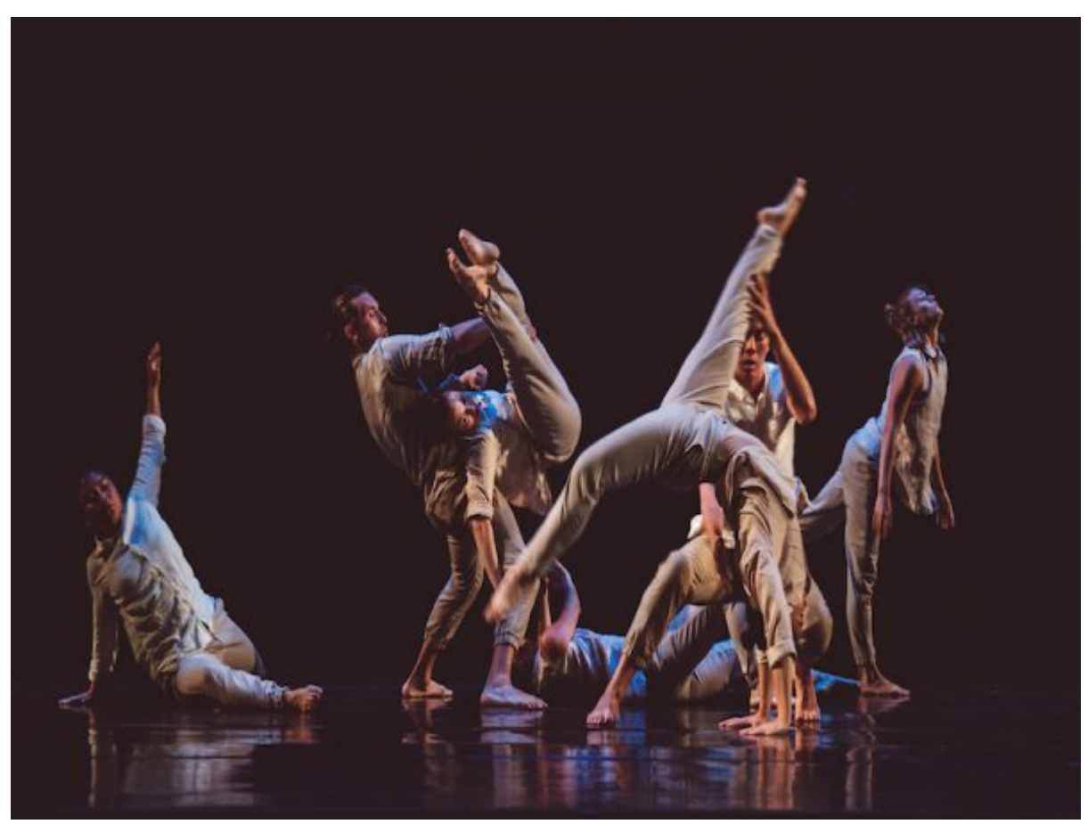
Entity Contemporary Dance.