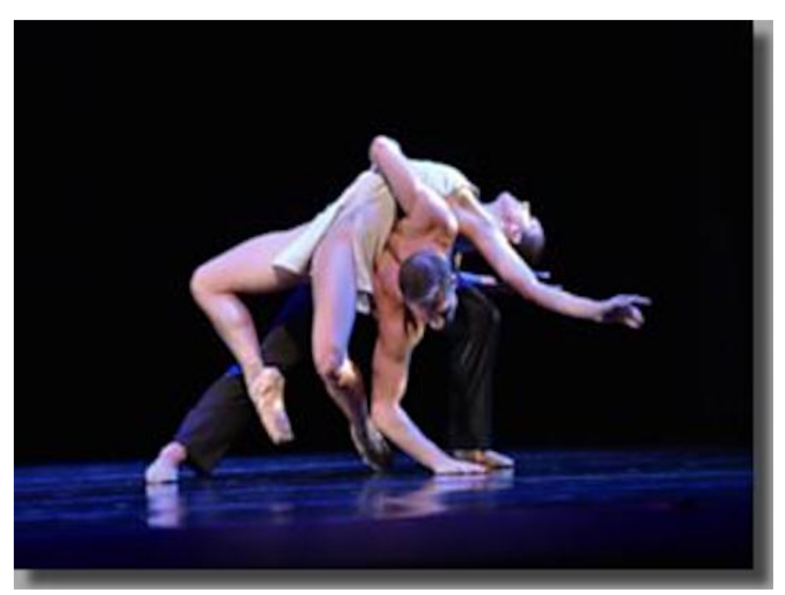
National Choreographers Initiative.

National Choreographers Initiative (NCI) at Irvine Barclay Theatre, University of California Irvine, 4242 Campus Dr., Irvine; Sat., July 29, 8 pm, $20-$60, livestream-$20. The Barclay.