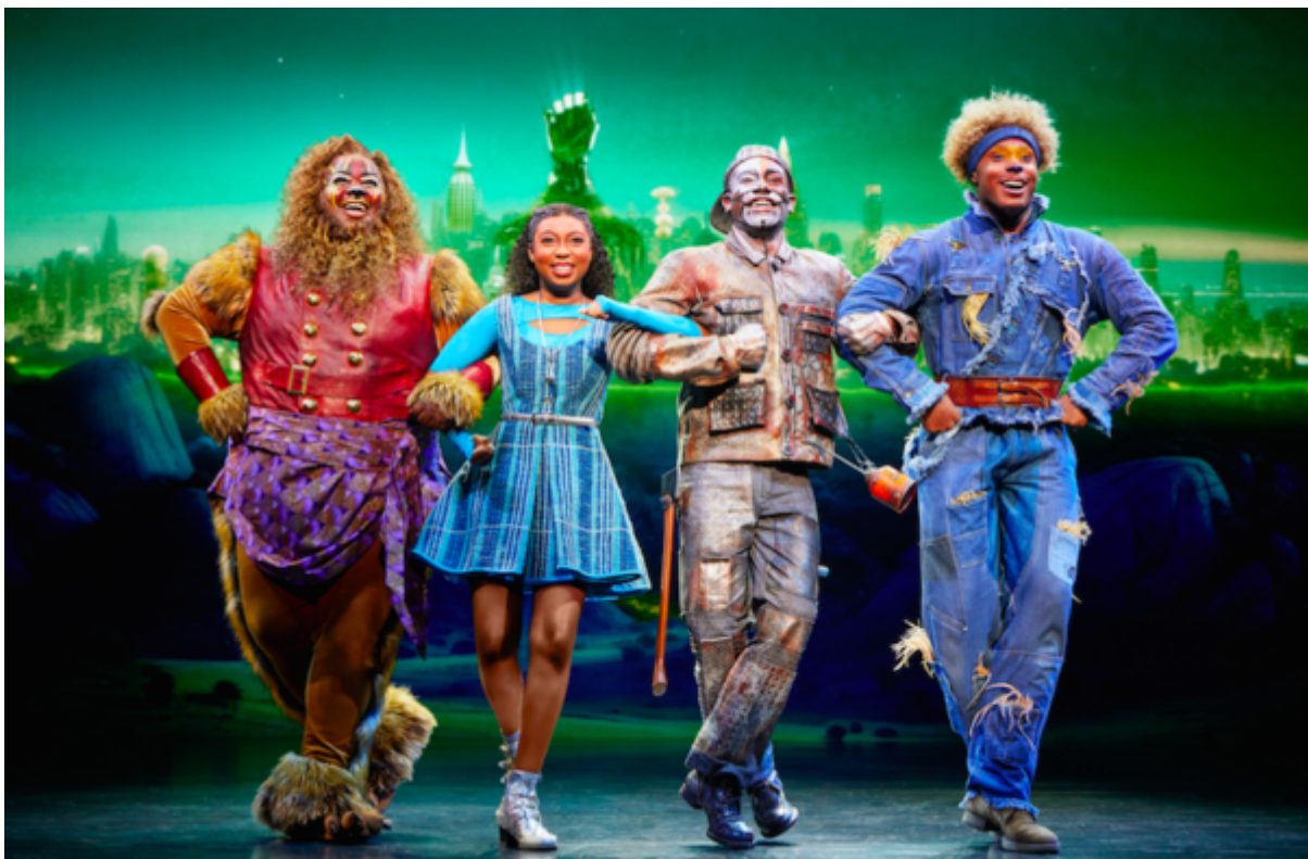
The Wiz.

Presenting itself as “China before communism,” the touring company Shen Yun built its reputation on the athleticism, flexibility, and group precision of its dancers, but dodged questions about its connections with China’s banned Falun Gong. More recently, the organization has faced accusations of dancer abuse and a lawsuit alleging child labor violations. In that context, the company tours four local venues from now through early February. The Soraya, Cal State University Northridge, 18111 Nordhoff St., Northridge; Thurs., Jan 15, 2 pm, Fri., Jan. 16, 7 pm, Sat.-Sun., Jan. 17-18, 1 pm, $86-$186. Also at The Music Center, Dorothy Chandler Pavilion, 135 N. Grand Ave., Downtown LA; Thurs., Jan. 22, 2 pm, Fri., Jan., 23, 7:30 pm, Sat.-Sun., Jan. 24-25, 1 pm, $91-$231. Also at Thousand Oaks Civic Arts Plaza, 2100 E. Thousand Oaks Blvd., Thousand Oaks; Fri., Jan. 30, 7:30 pm, Sat.-Sun., Jan. 31-Feb. 1, 1 pm, $94.40-$196.95. Also at Long Beach Terrace Theater, 300 E. Ocean Blvd., Long Beach; Fri., Feb. 6, 7:30 pm, Sat.-Sun., Feb. 7-8, 1 pm, $89-$218. Shen Yun .