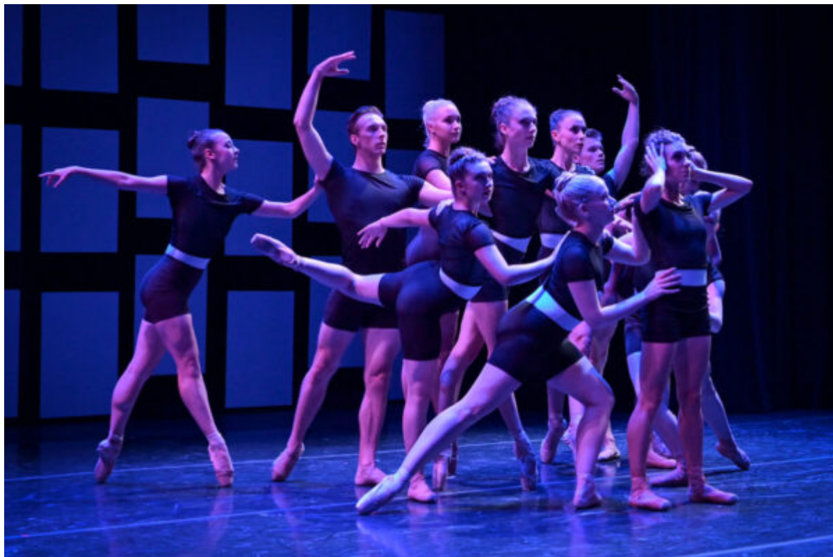
Ballet Project OC.