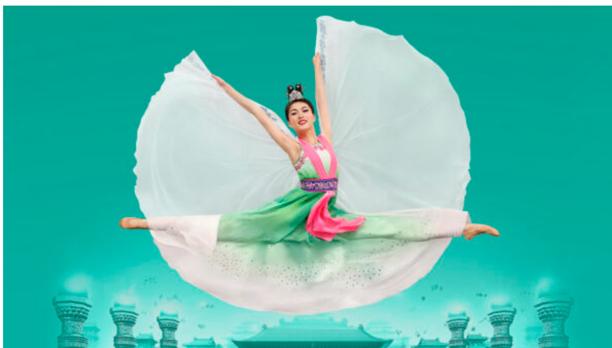
Shen Yun.