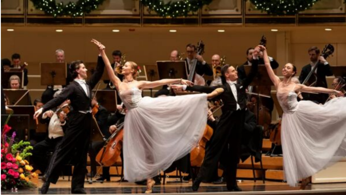
Salute to Vienna.