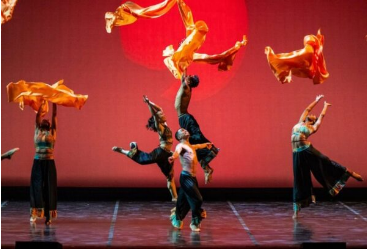
Lula Washington Dance Theatre.